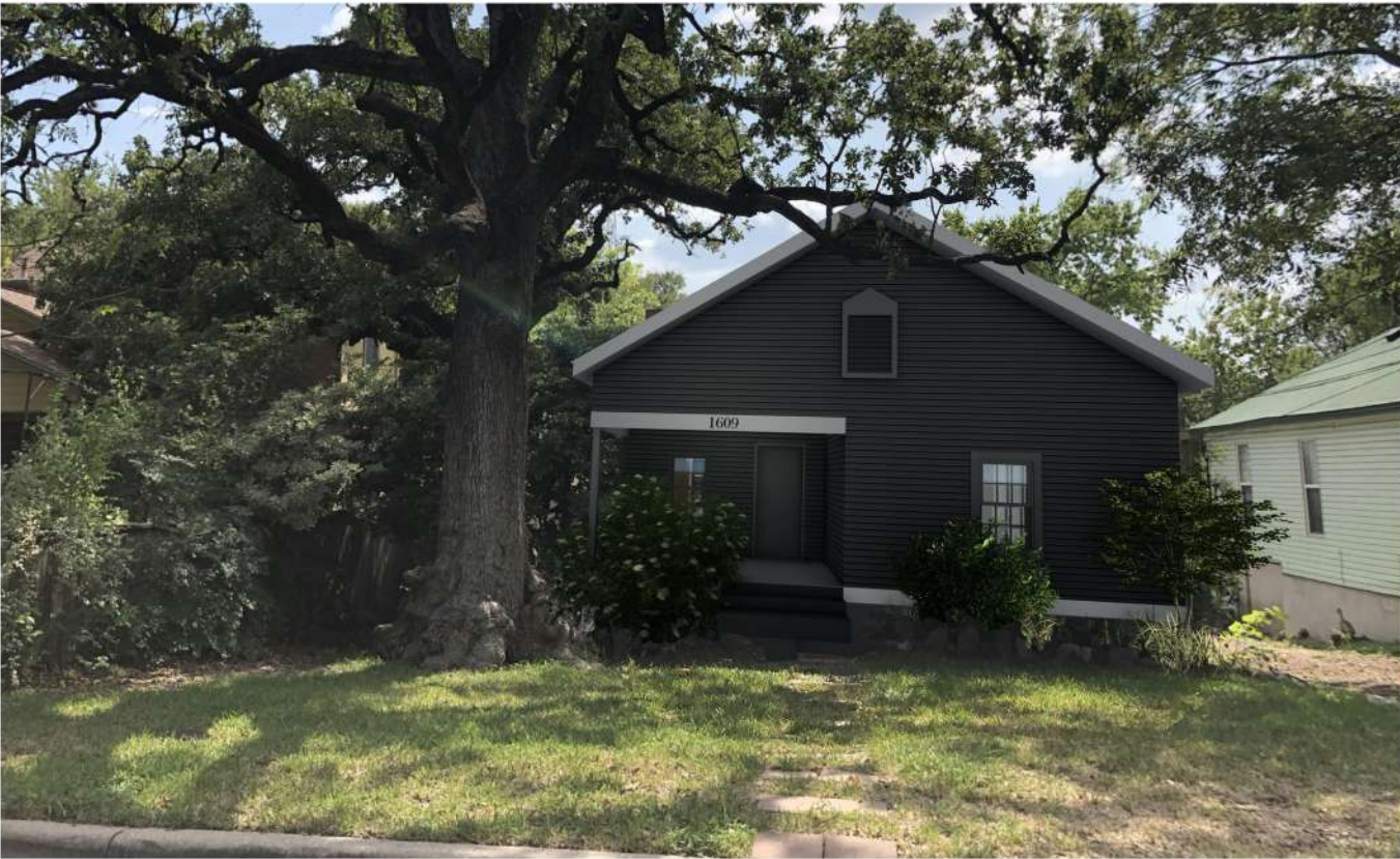
Renovated House with Proposed Addition

HaileyStudio architecture + planning 1011 East 5th Street #11311 Austin, Texas 78702 512.913.0396 www.haileystudio.com email: thailey@haileystudio.com