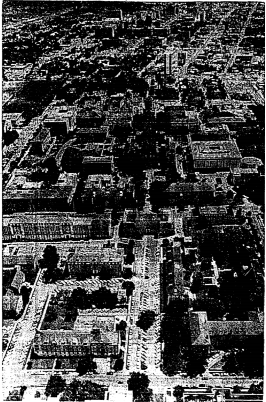
UT AREA MAY GO SKYWARD

"This will not change the mainstream of university thought," he says, "but it will divert it to some degree into new channels."