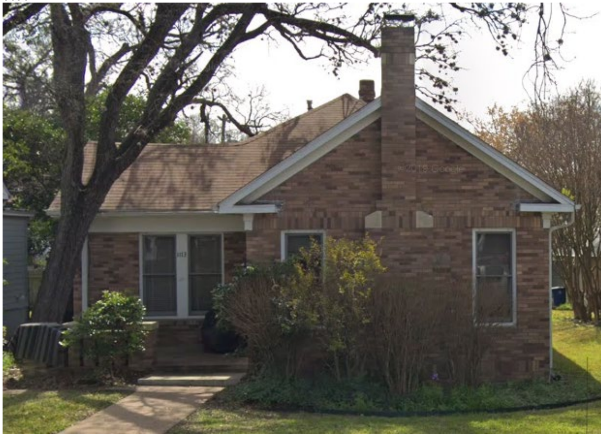
Primary (north) façade of 1113 W. 22 nd Half Street.