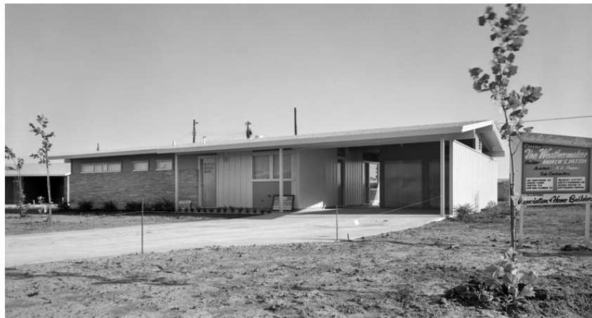
1954 photograph of the house when brand new