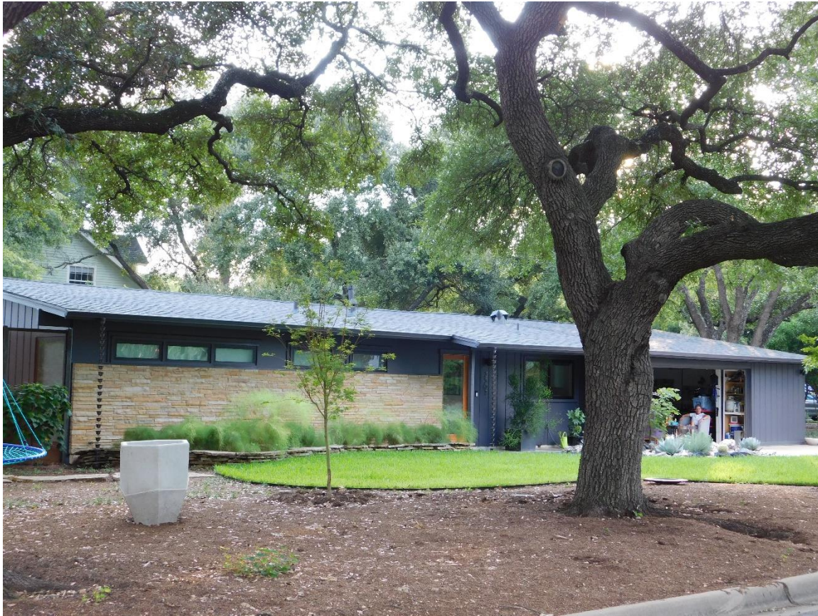
2507 Park View Drive ca. 1954