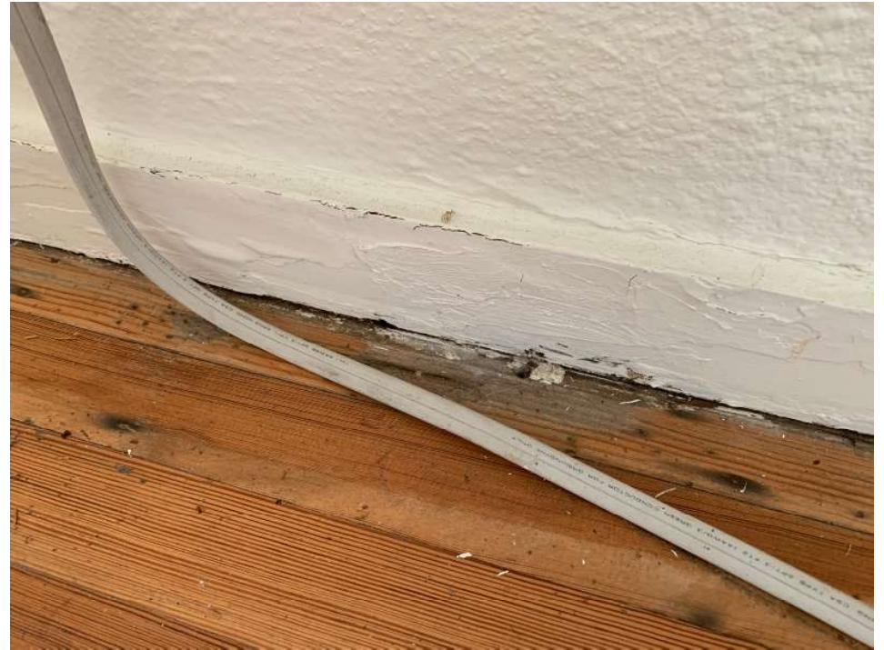
CONDITION OF FLOOR AT PERIMETER