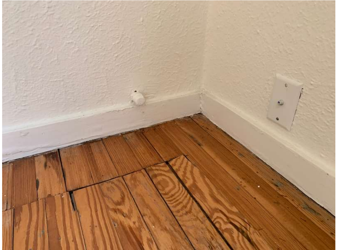
CONDITION OF FLOOR AT PERIMETER