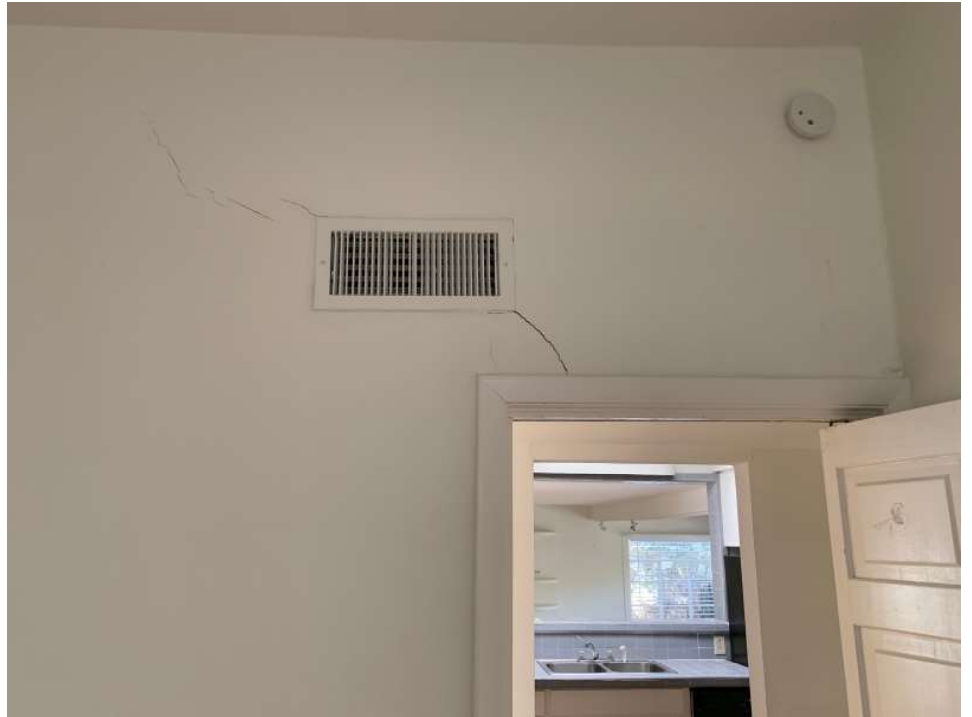
CONDITION OF INTERIOR WALL