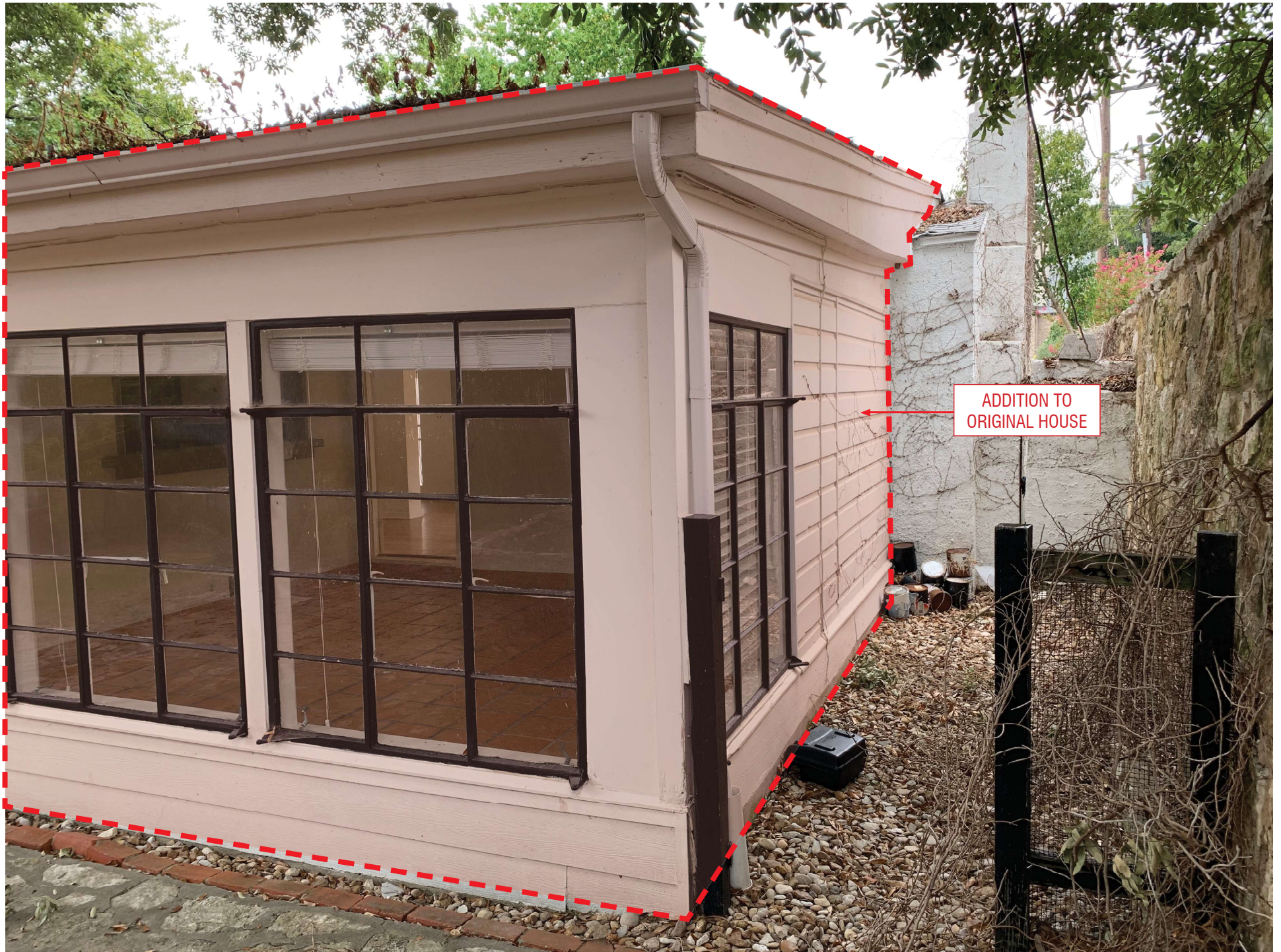
EXISTING (NORTH - FROM BACKYARD)