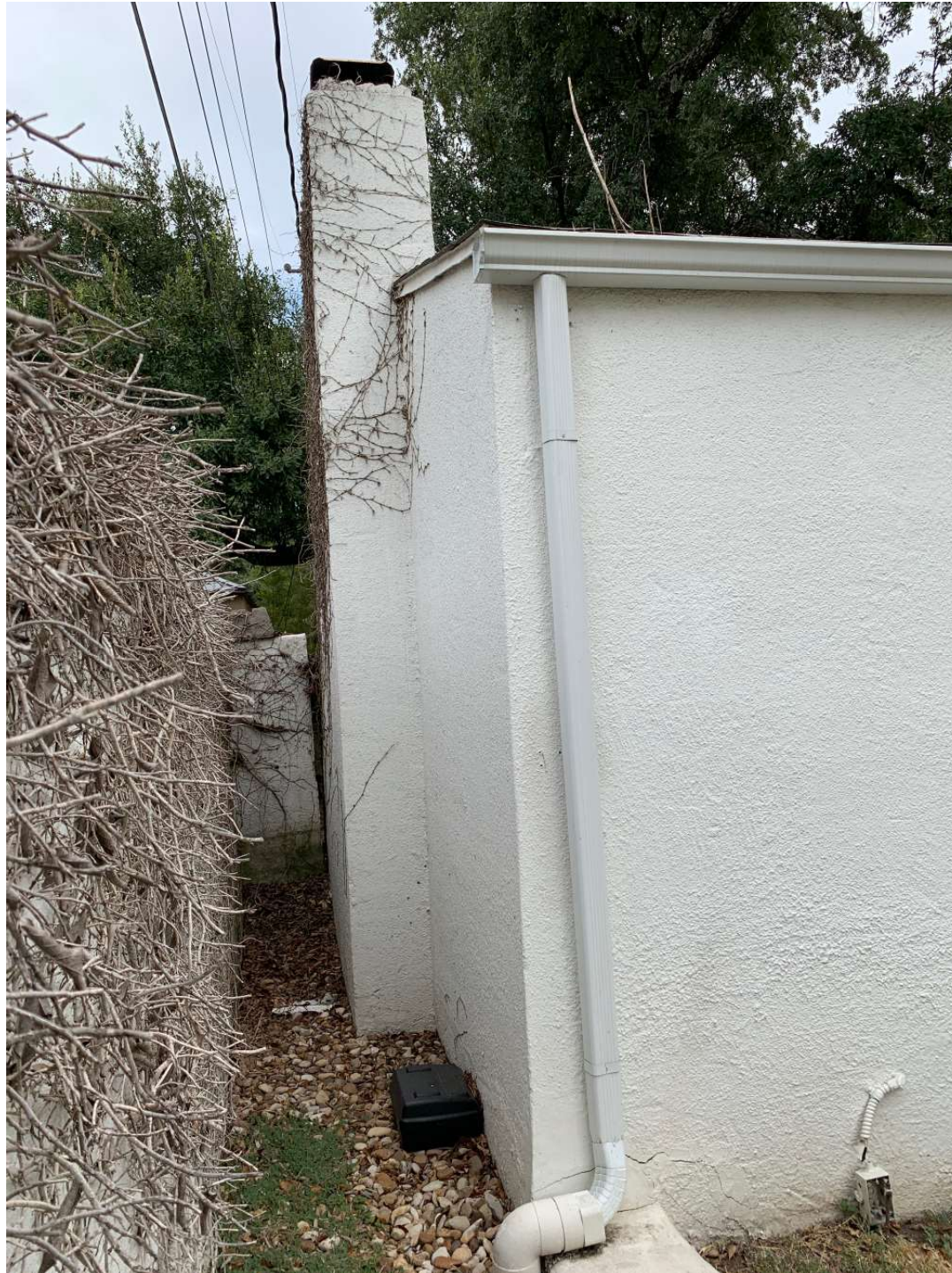
EXISTING (NORTH - FROM FRONT-YARD)