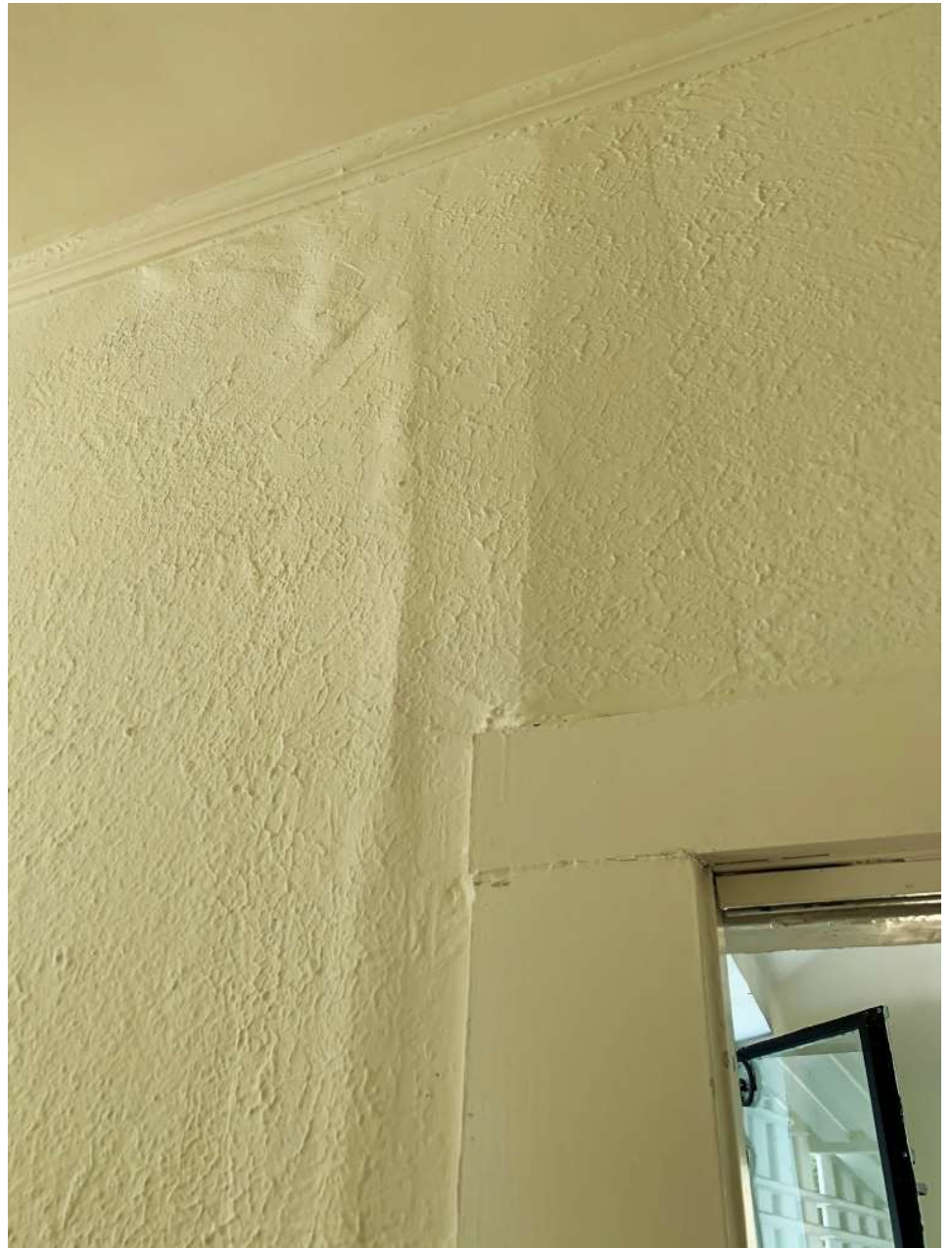
CONDITION OF INTERIOR WALL