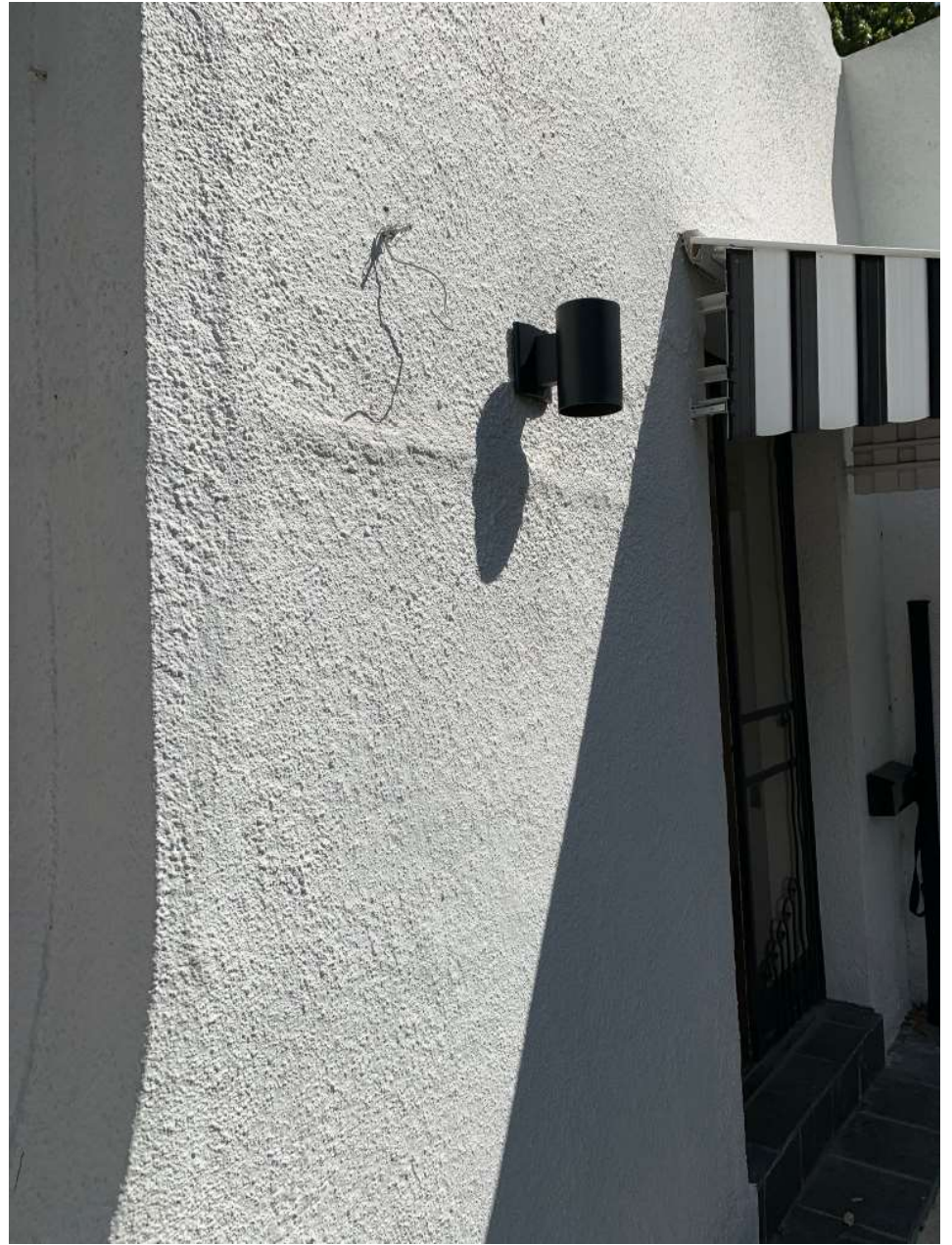
EXISTING (WEST CONT'D)