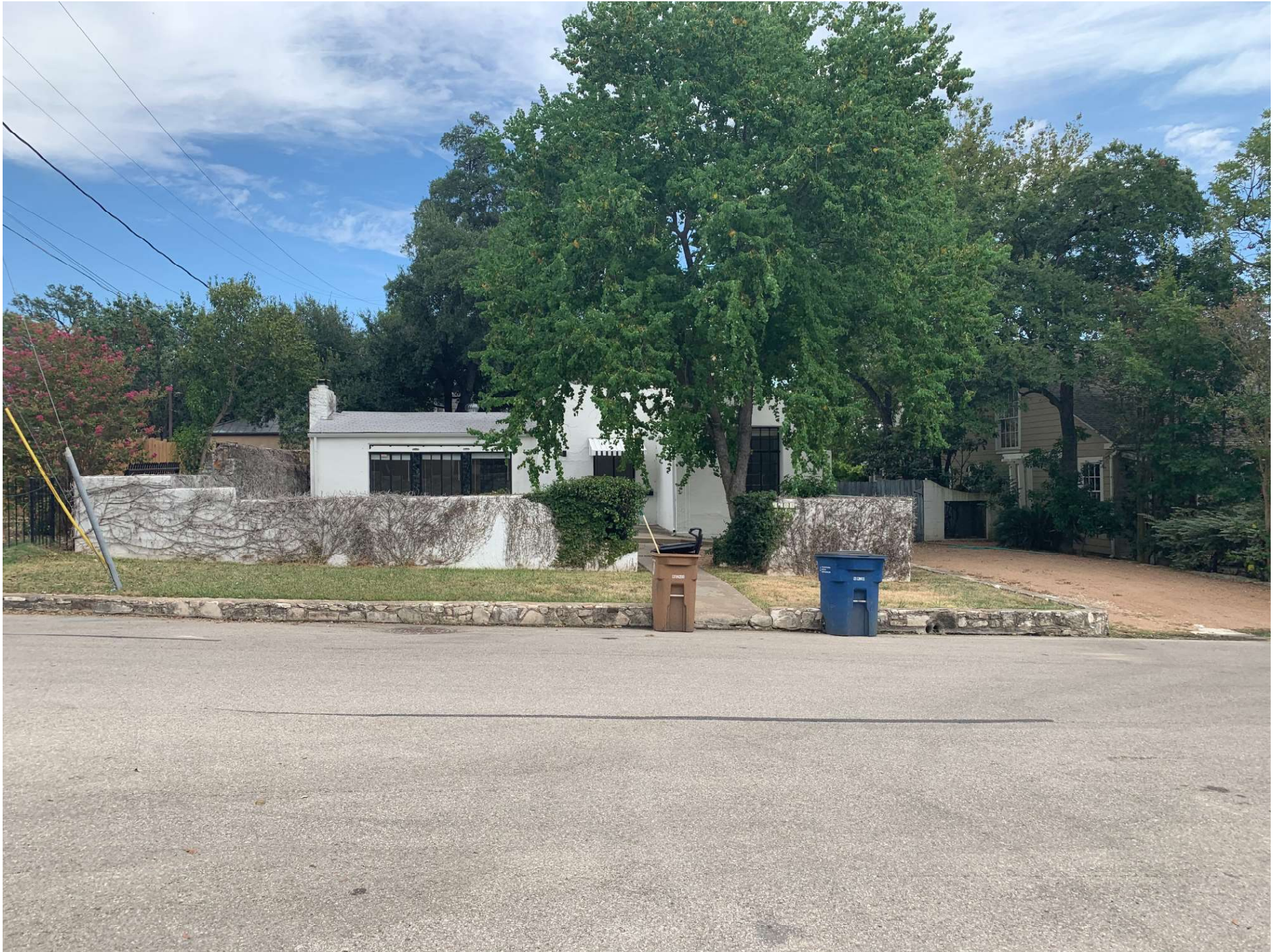
EXISTING (WEST) (FROM WOODLAWN BLVD)