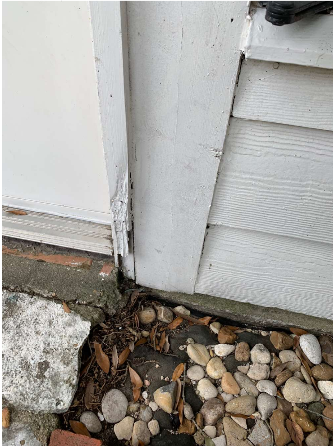
EXISTING (EAST CONT'D)