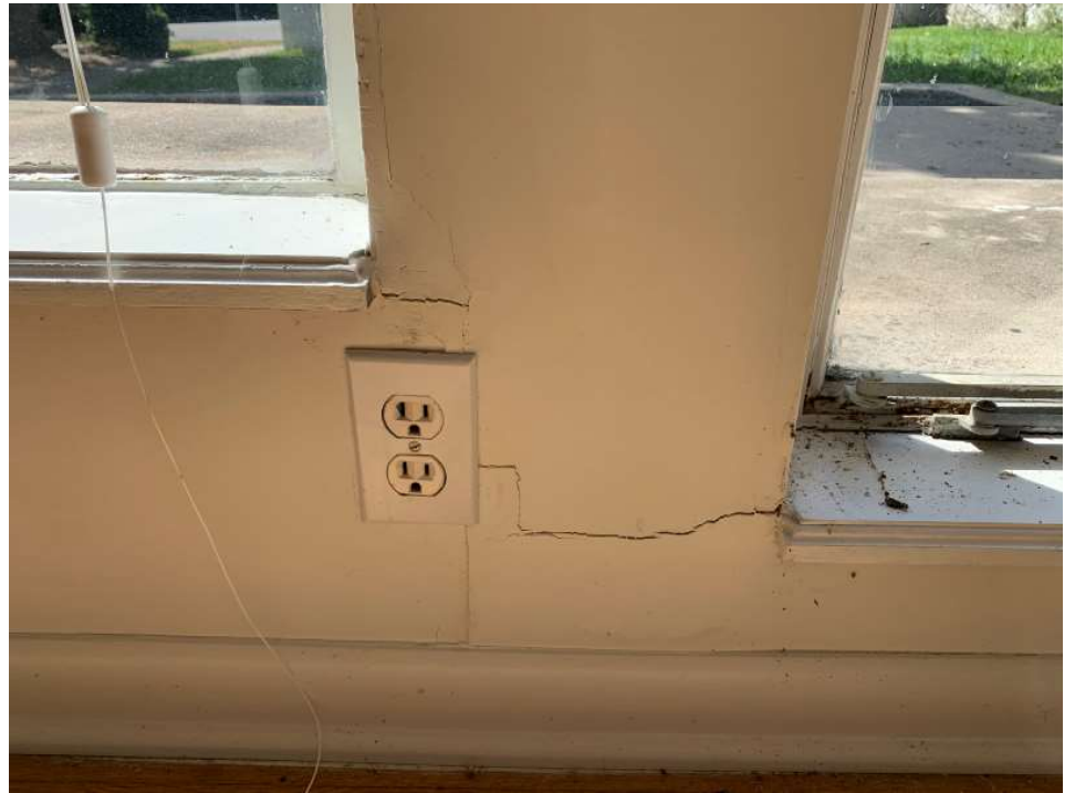
CONDITION OF INTERIOR WALL