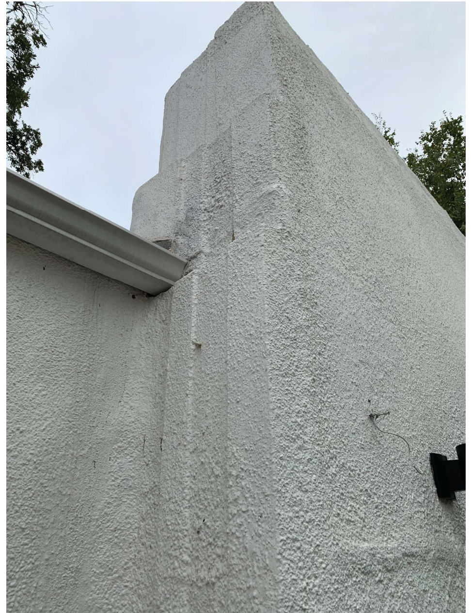
EXISTING (WEST CONT'D)