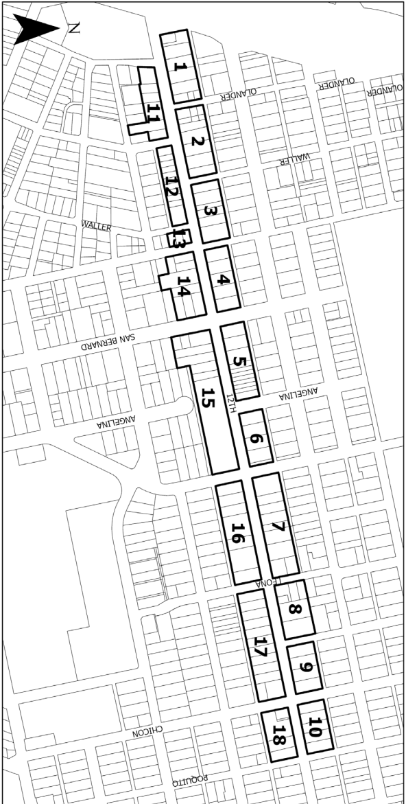
Neighborhood Conservation Combining District (NCCD) Tracts for East 12th Street