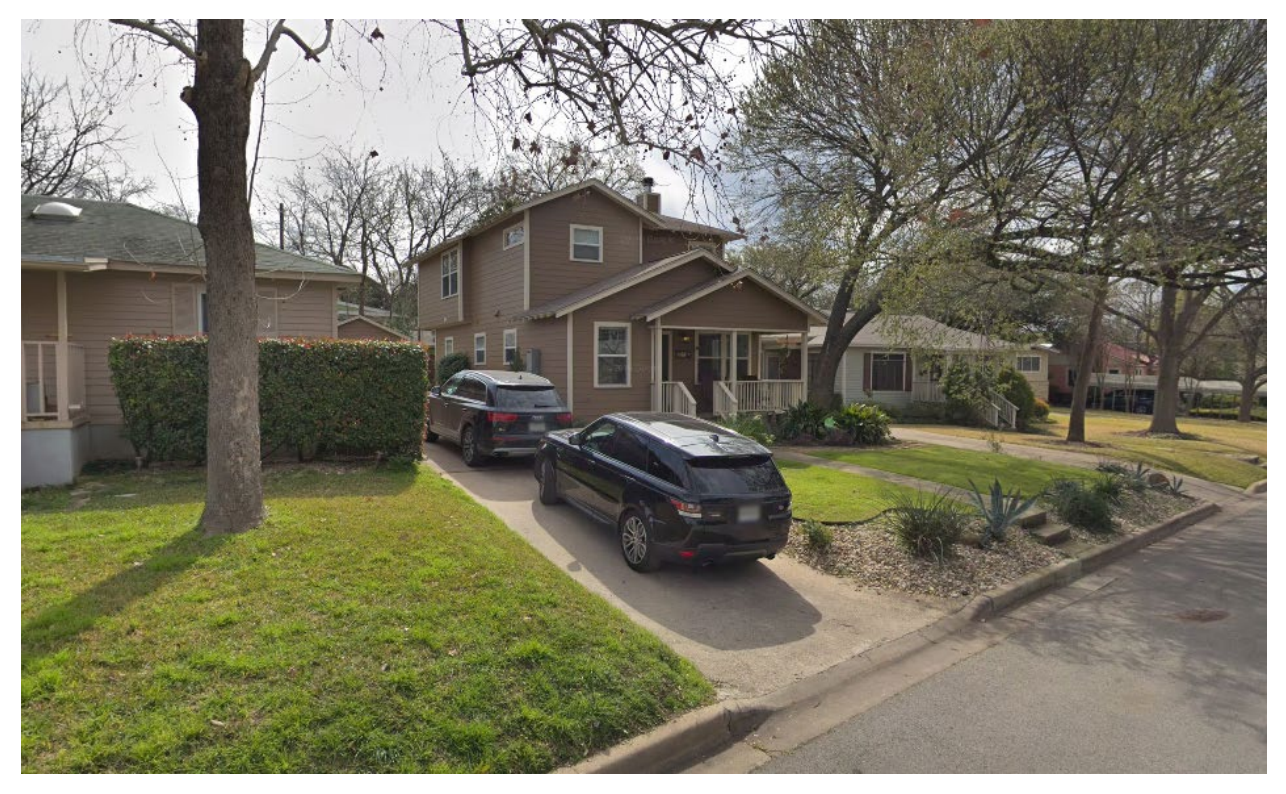
Subject house at left, looking south on Funston Street with new two-story construction next door – photo from February, 2019.