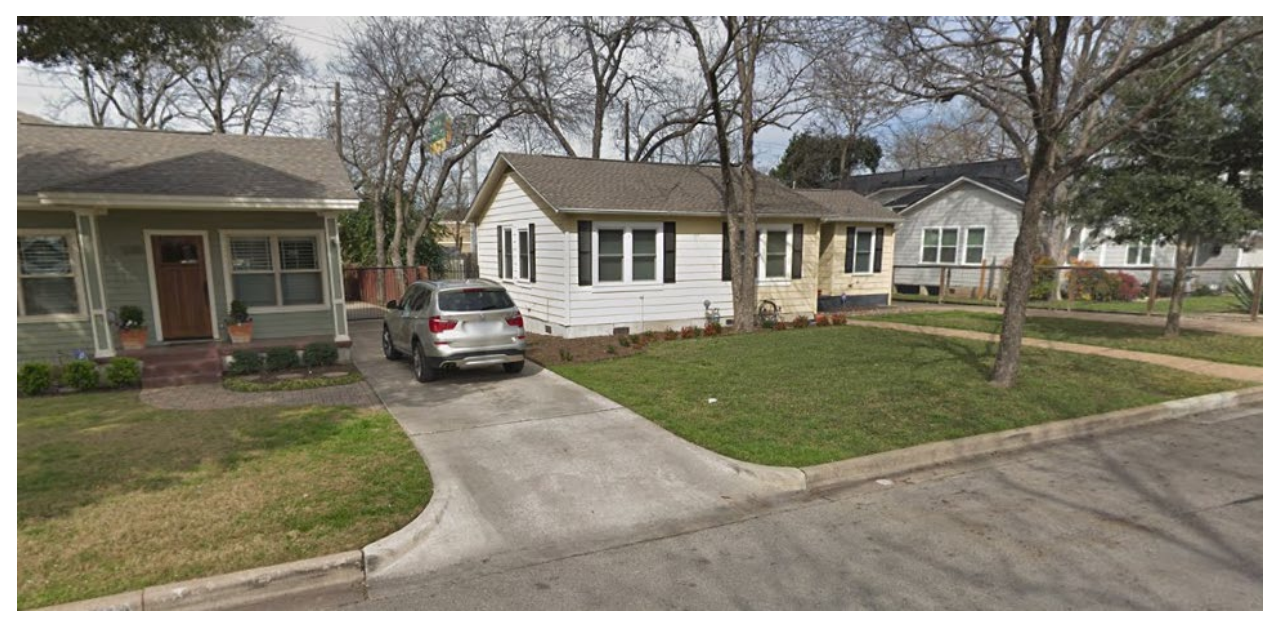
Across Funston Street from the subject house – photo taken February, 2019

of the house be graduated to lessen the height difference between this house and the contributing houses in the district.