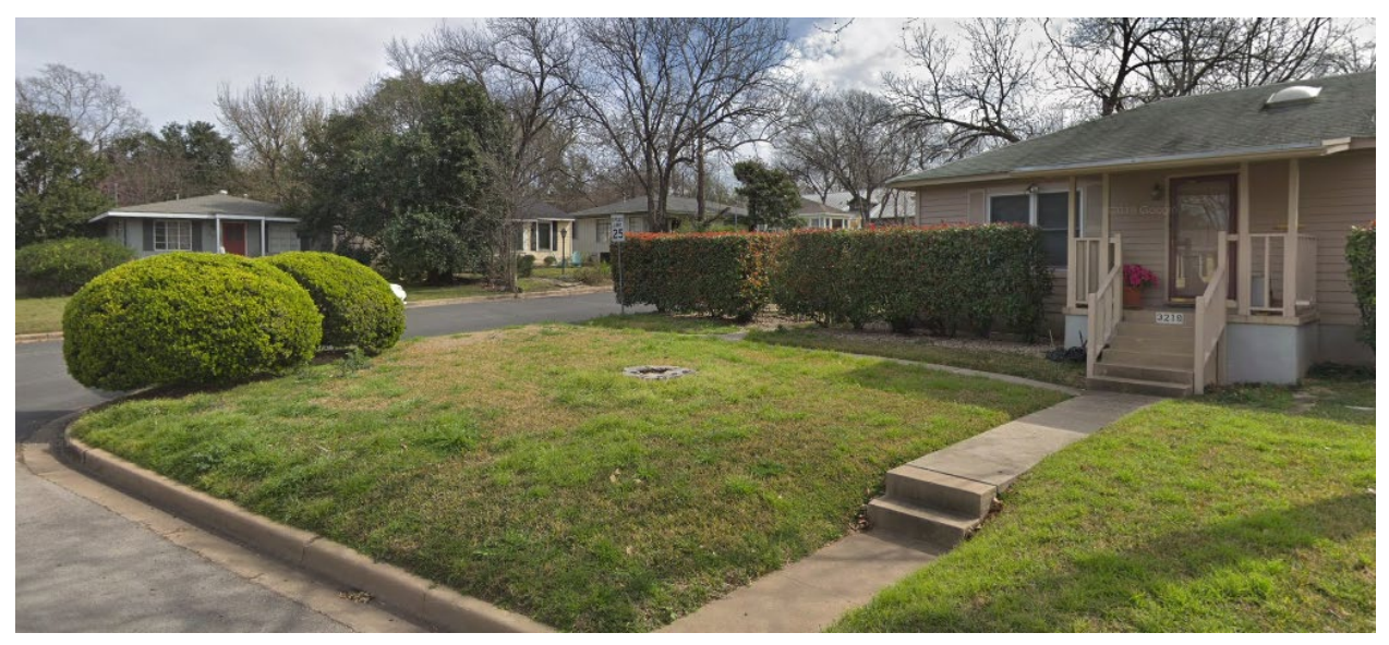
The subject house is at the right of this photo, taken February, 2019, looking towards the houses on W. 33^{rd} Street.