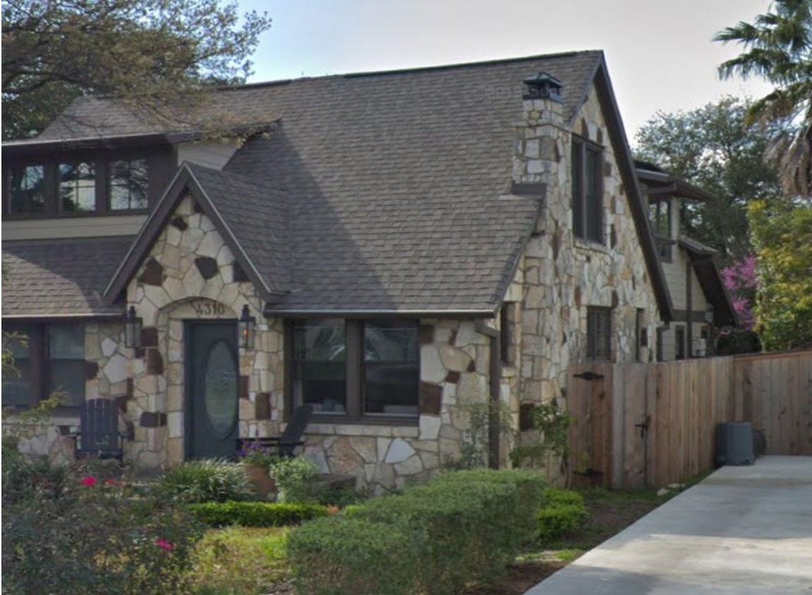
View showing the dormer and rear additions to the house (2019)