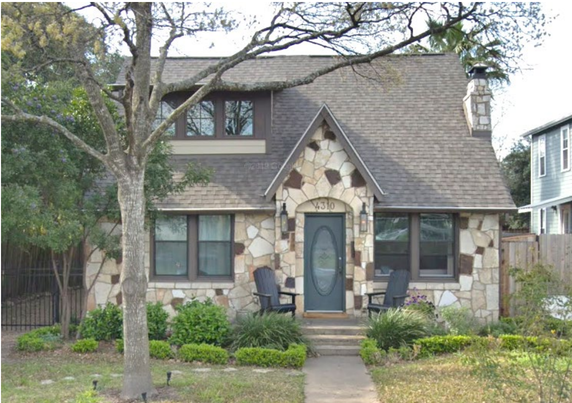
February, 2019 view