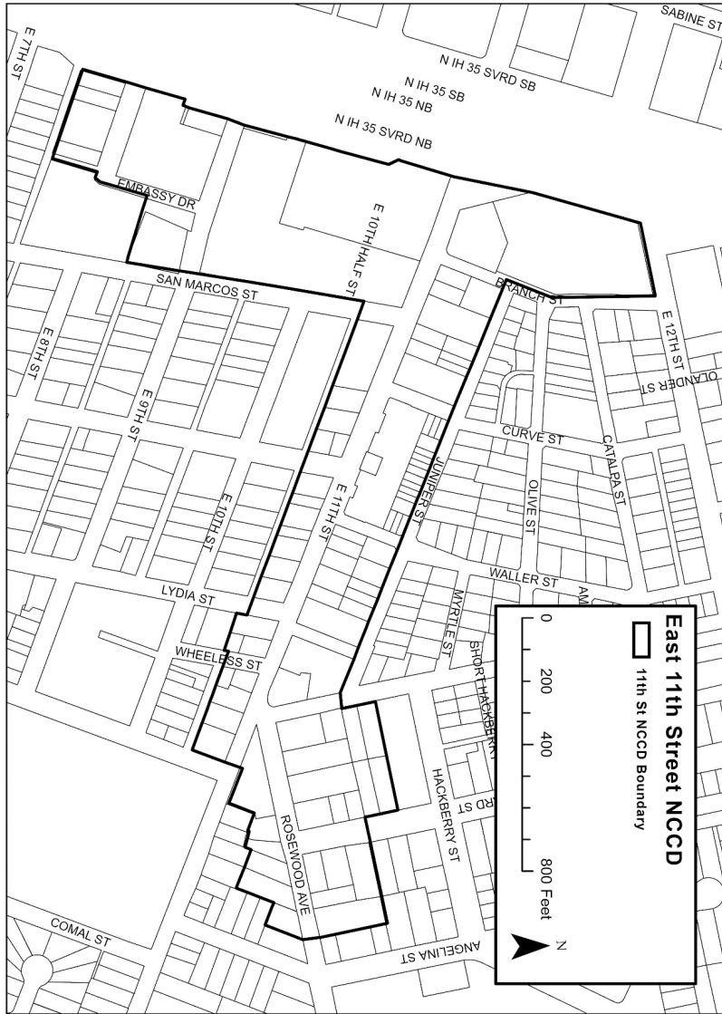
Exhibit A: Boundary Map