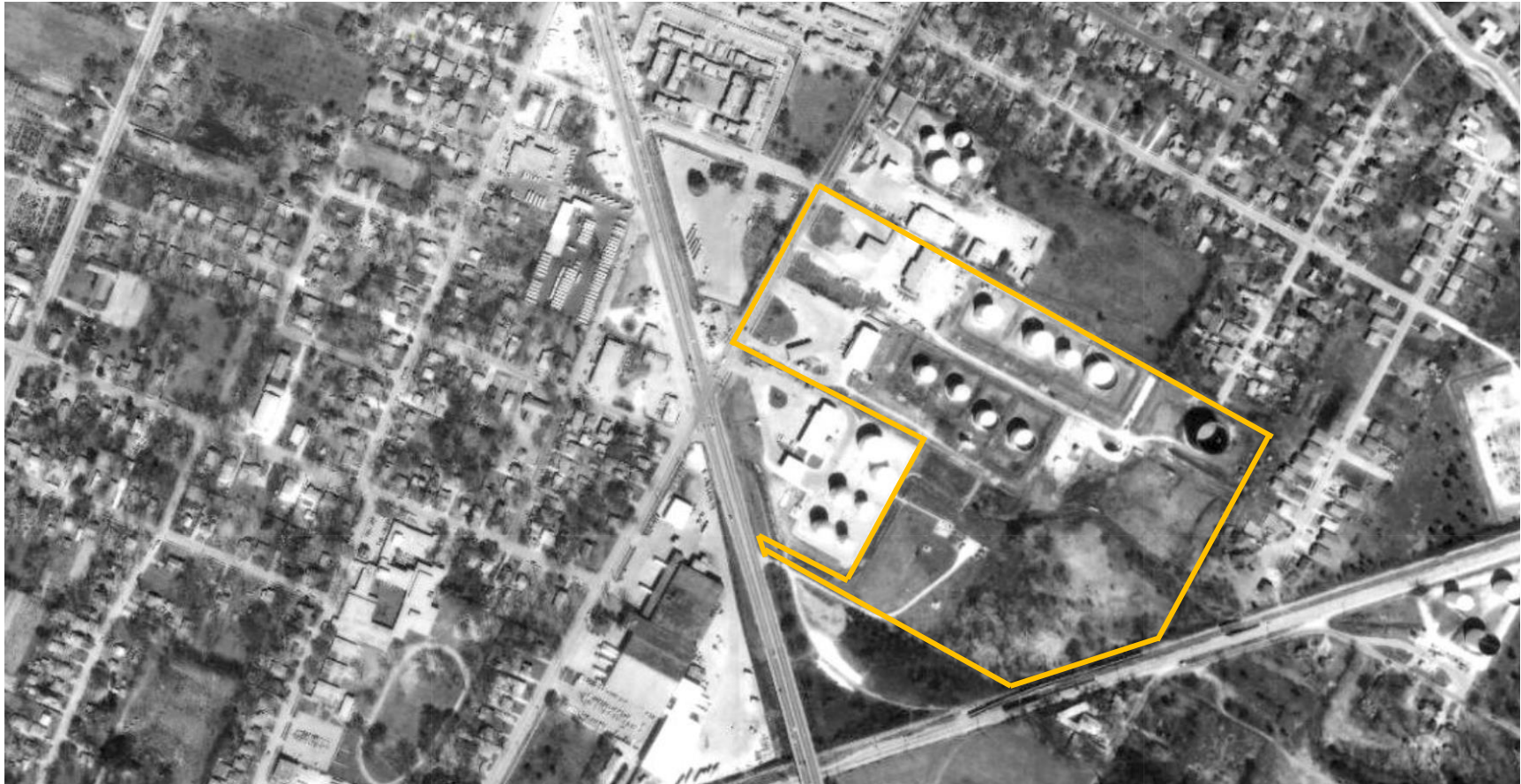
Figure 1. Site Aerial (1987)