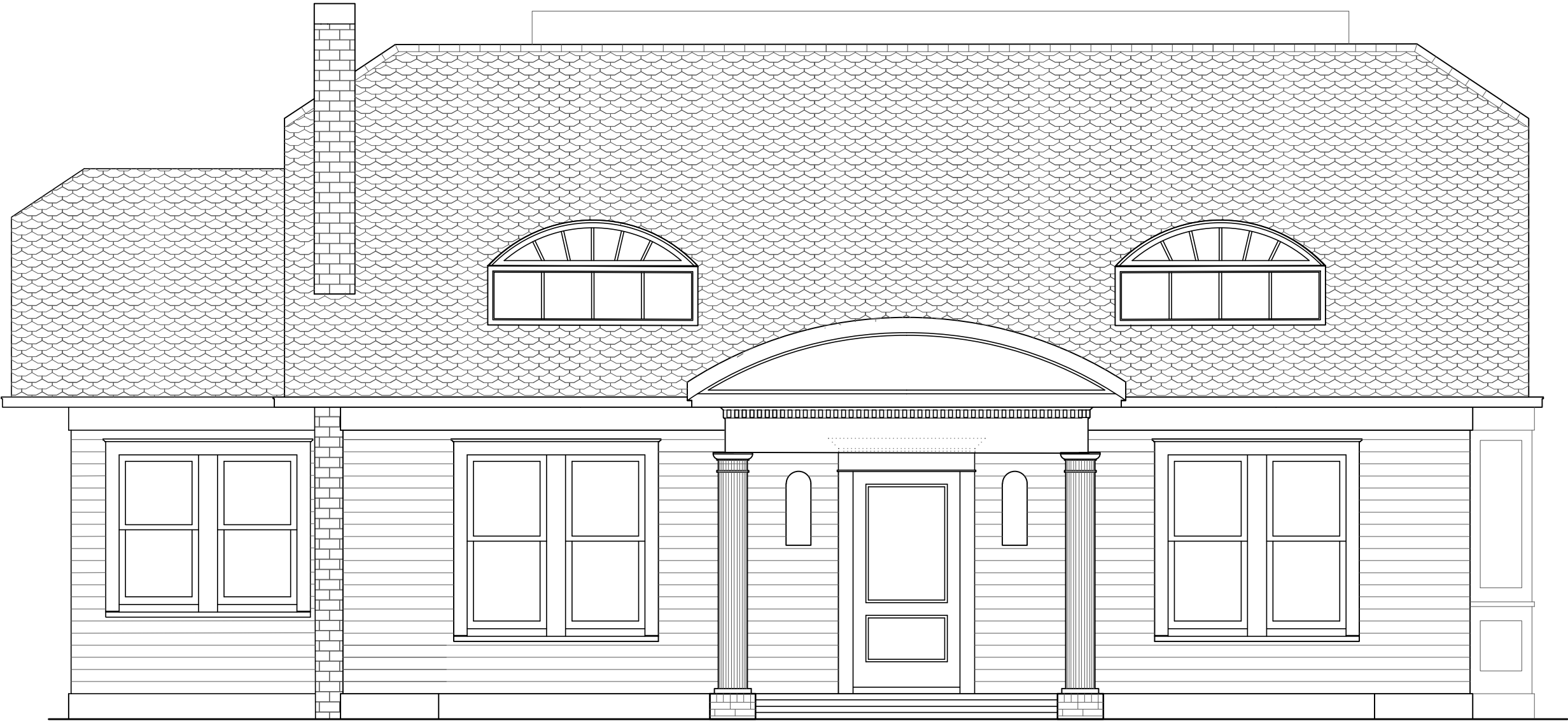
1 WEST ELEVATION SCALE AS NOTED