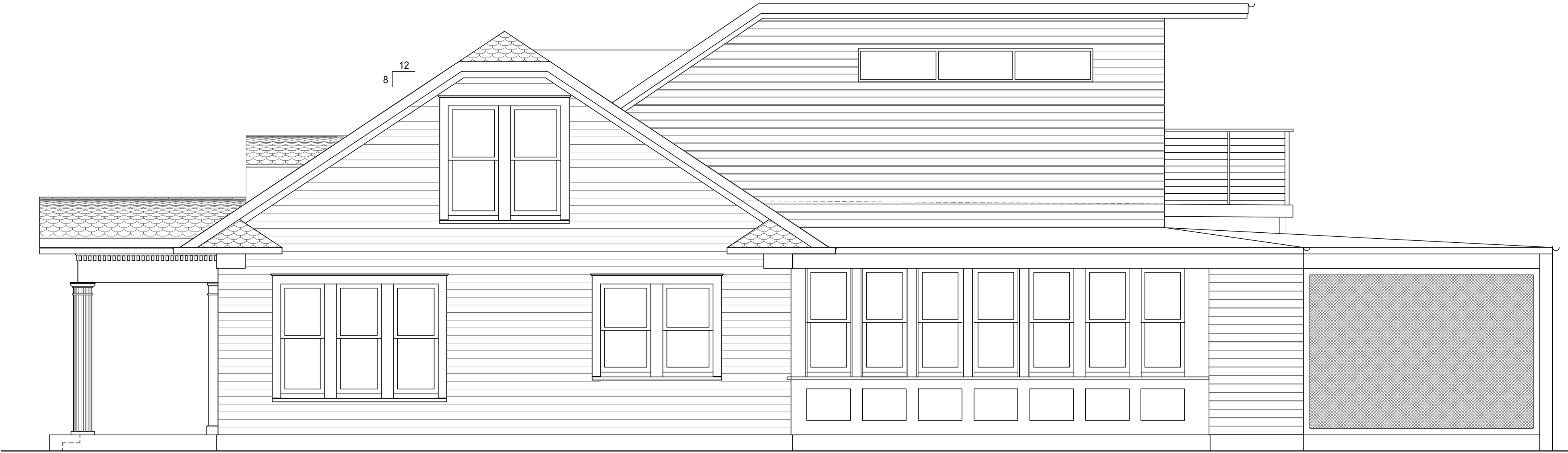
1 SOUTH ELEVATION SCALE AS NOTED