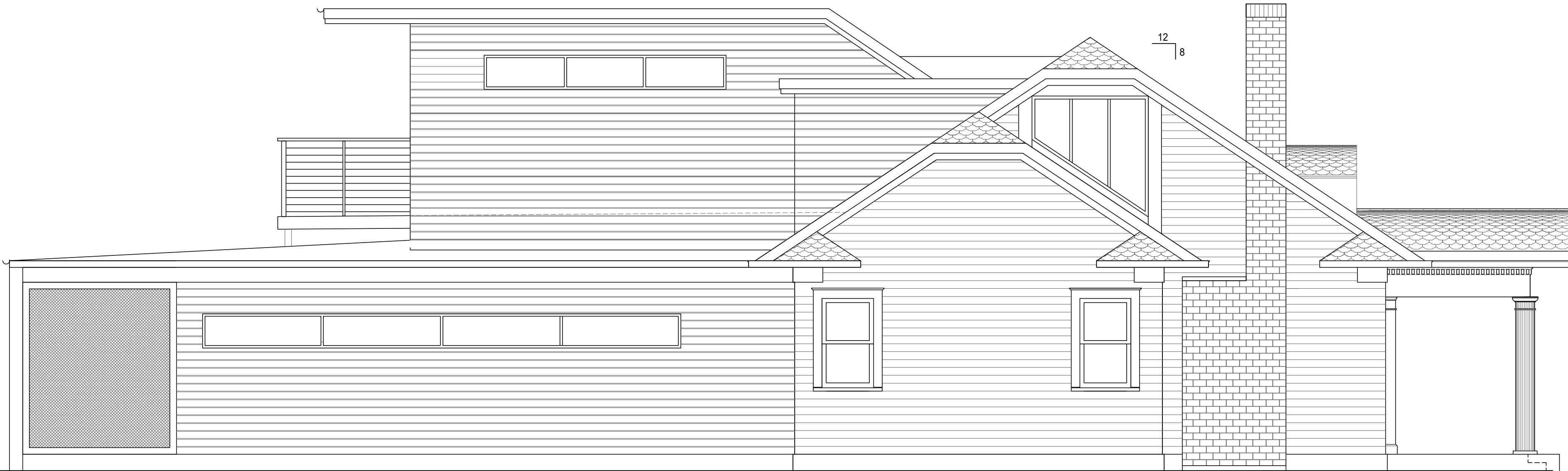
1 NORTH ELEVATION