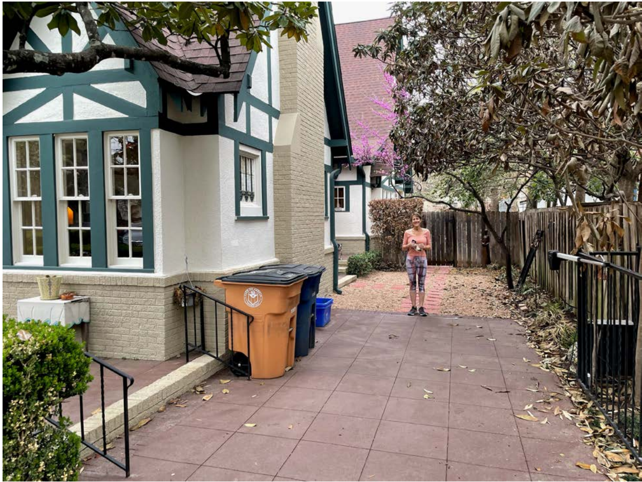
Fence and gate location (at person's location)