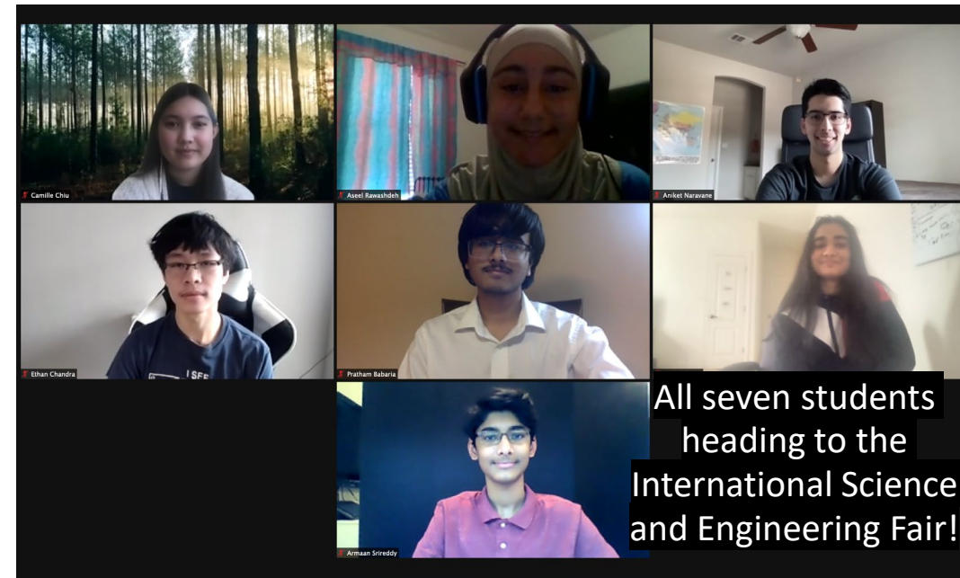
All seven students heading to the International Science and Engineering Fair!