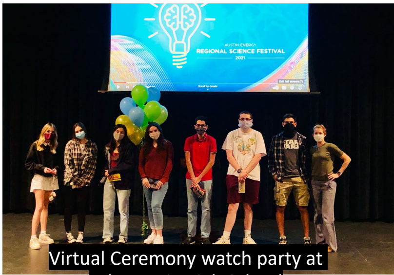
Virtual Ceremony watch party at Lake Travis High School