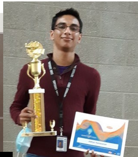
Senior Division students from College Station High School