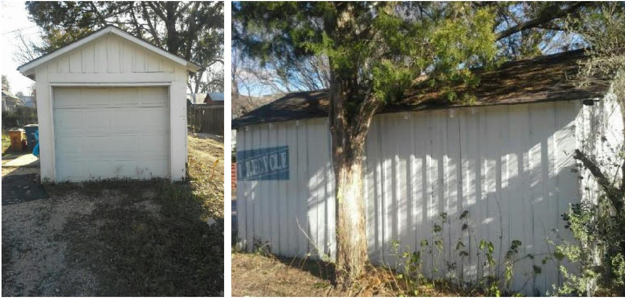
North (from street) and west (from alley) walls of existing garage. Photographs provided by applicant.