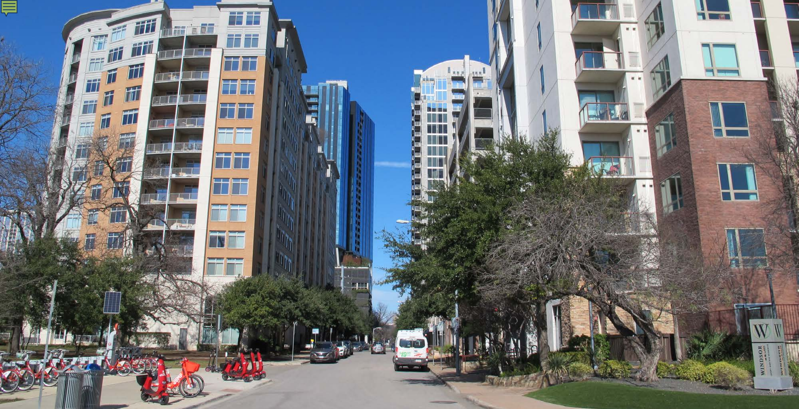
Rainey Street Neighborhood & Historic District