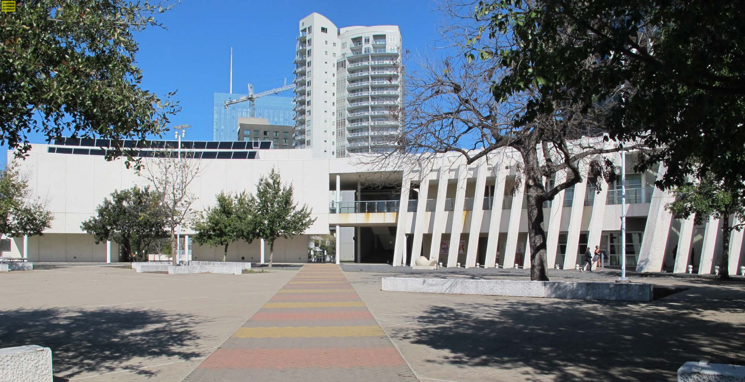
Emma S. Barrientos Mexican American Cultural Center (ESB-MACC)