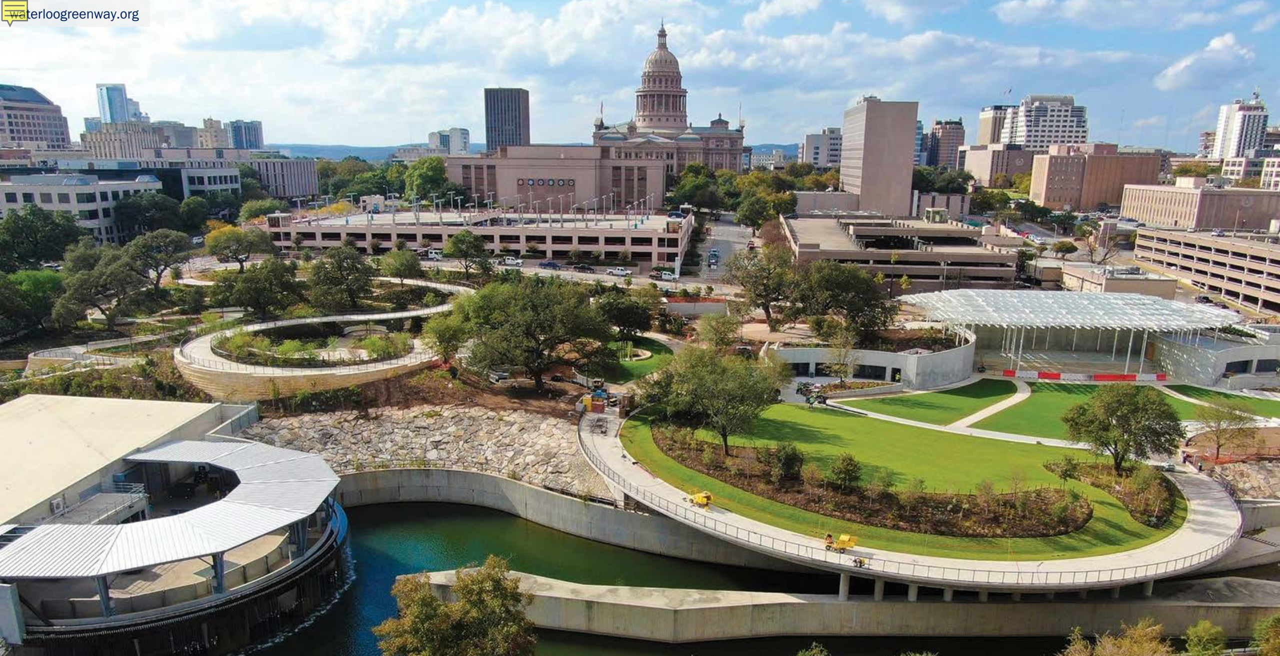
Waterloo Greenway/Waterloo Park