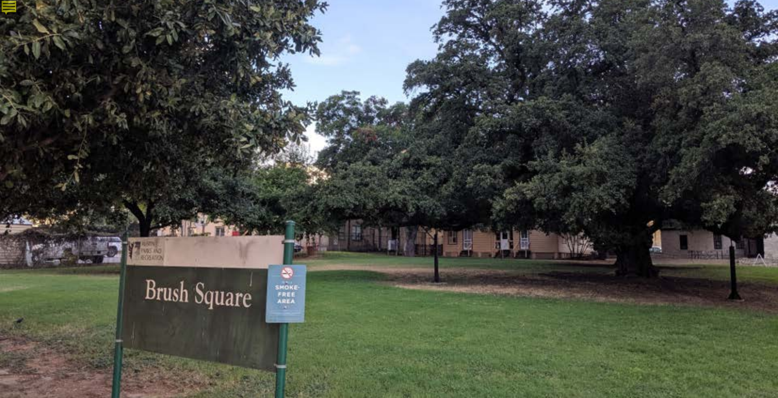
Brush Square/O. Henry Museum