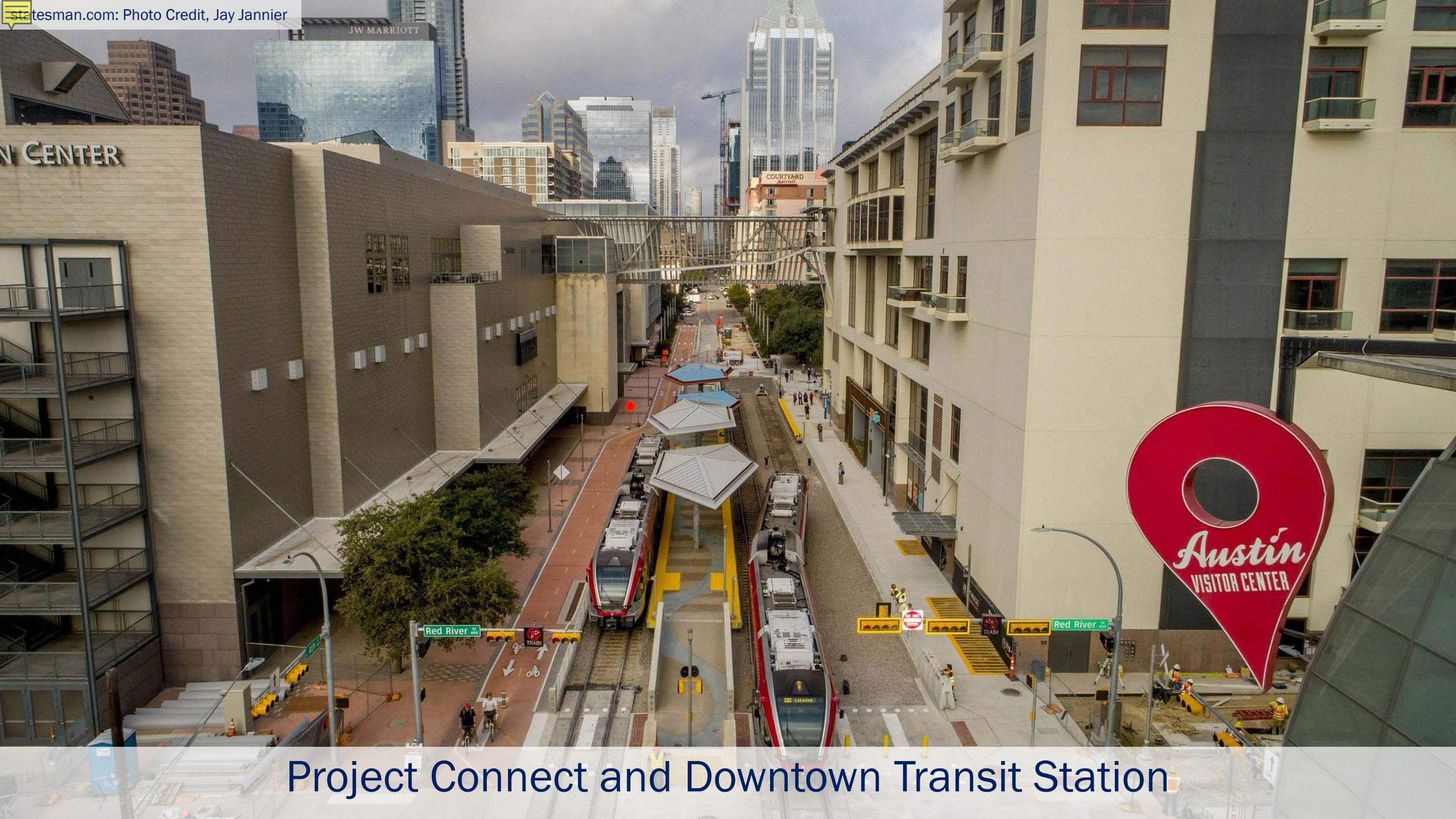
Project Connect and Downtown Transit Station