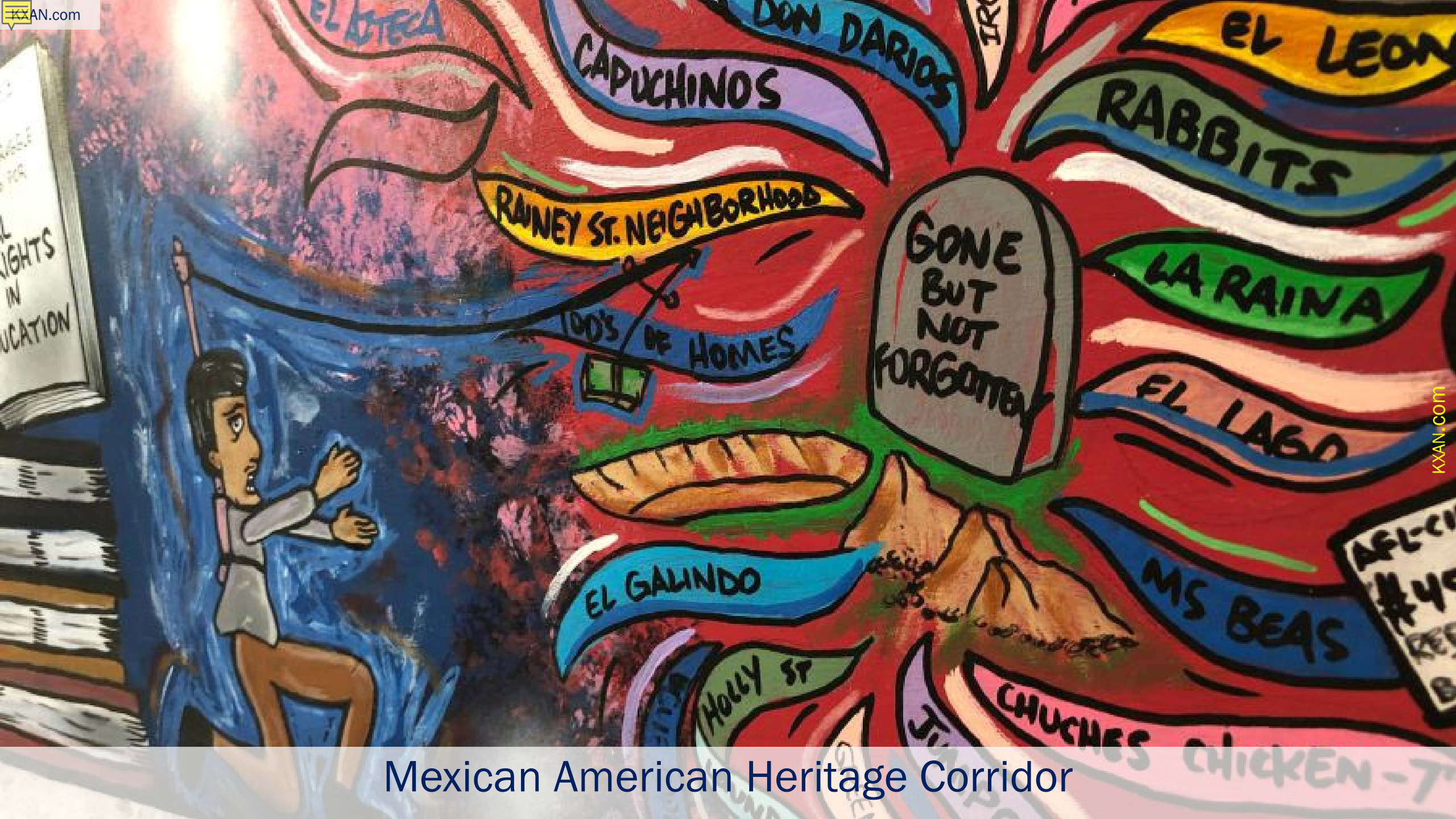
Mexican American Heritage Corridor