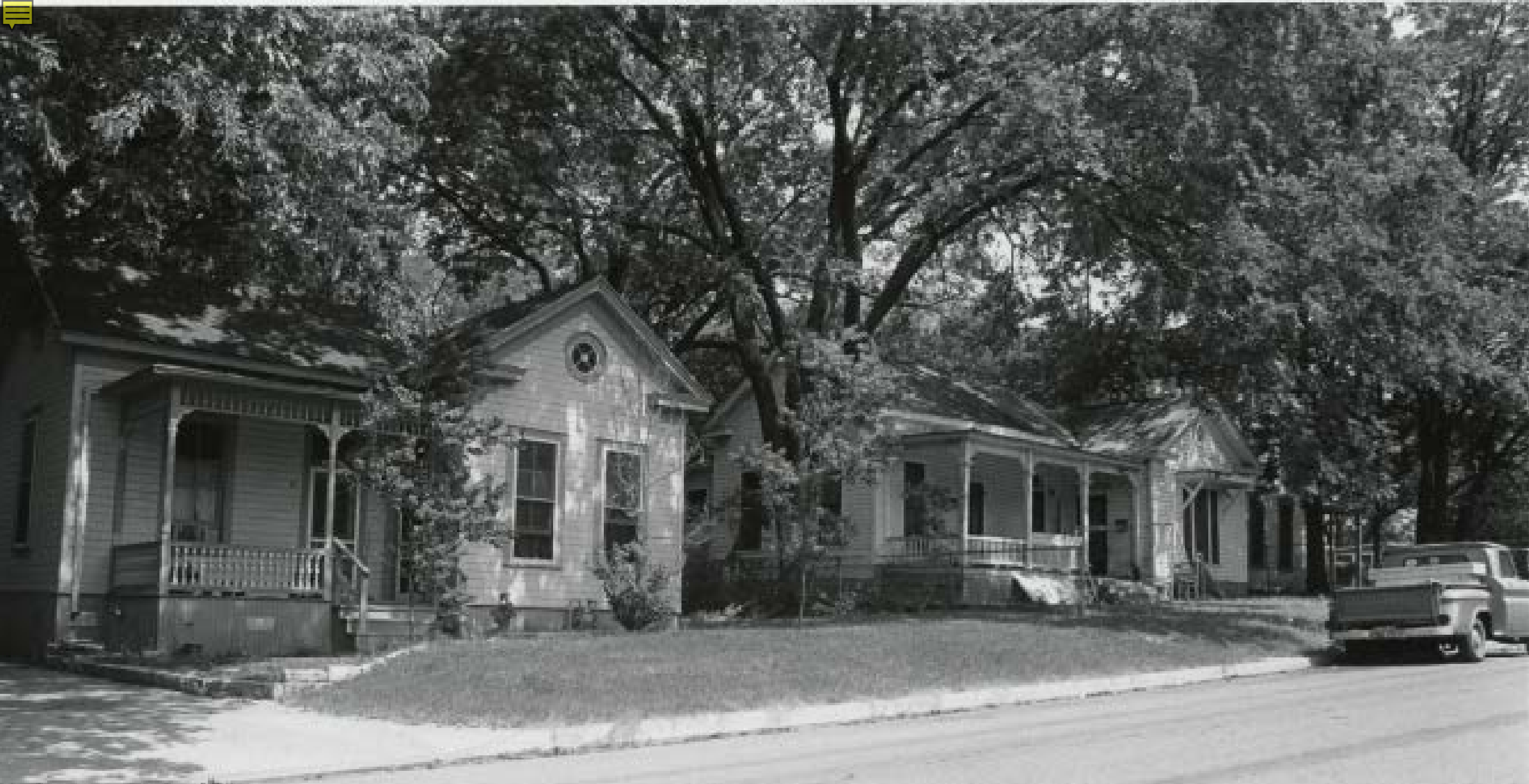
Rainey Street Neighborhood & Historic District