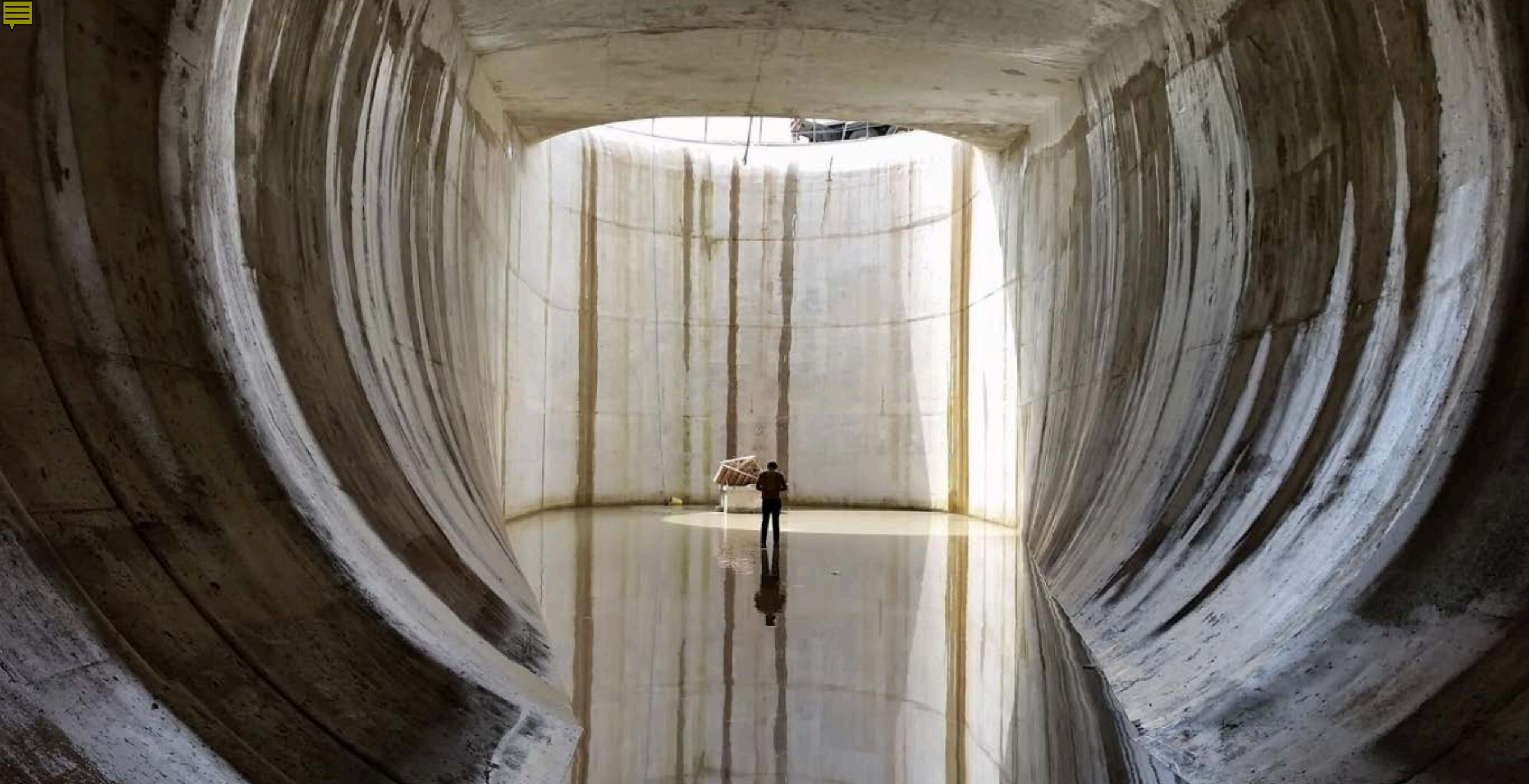
Waller Creek Tunnel