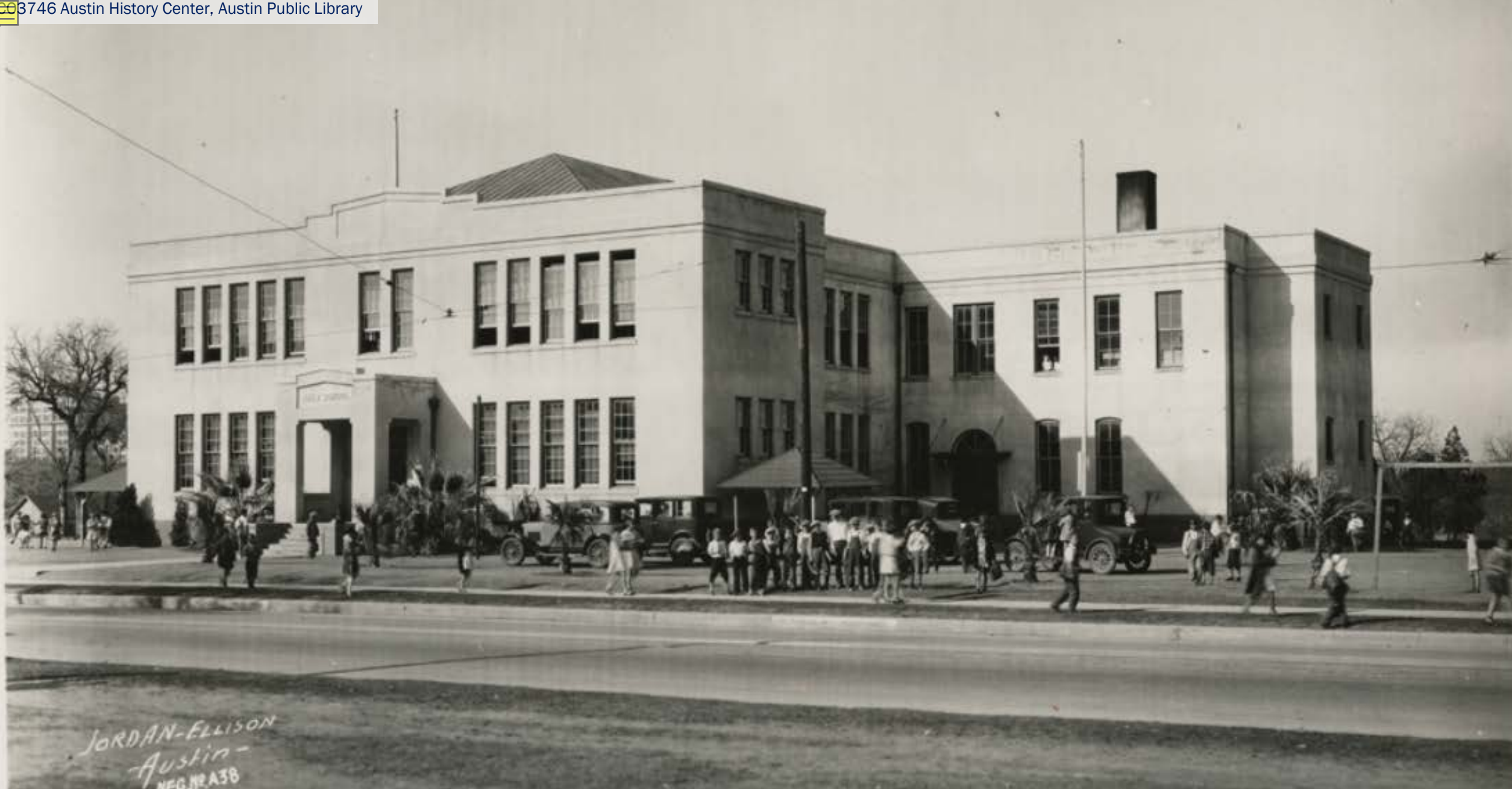
Sir Swante Palm School