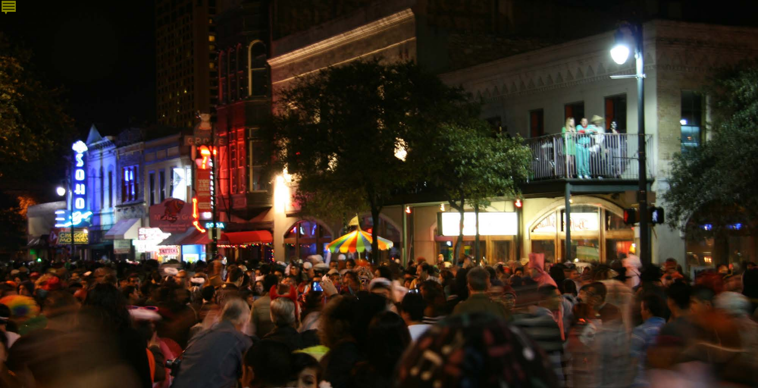
Sixth Street Historic and Entertainment District