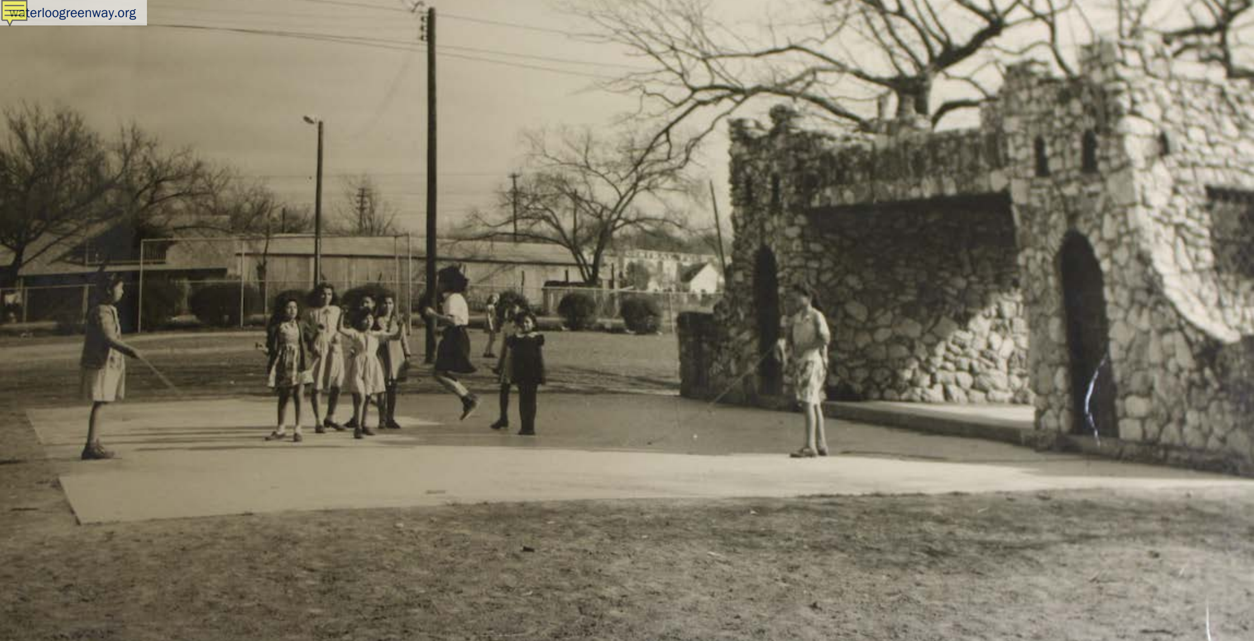
Sir Swante Palm Neighborhood Park