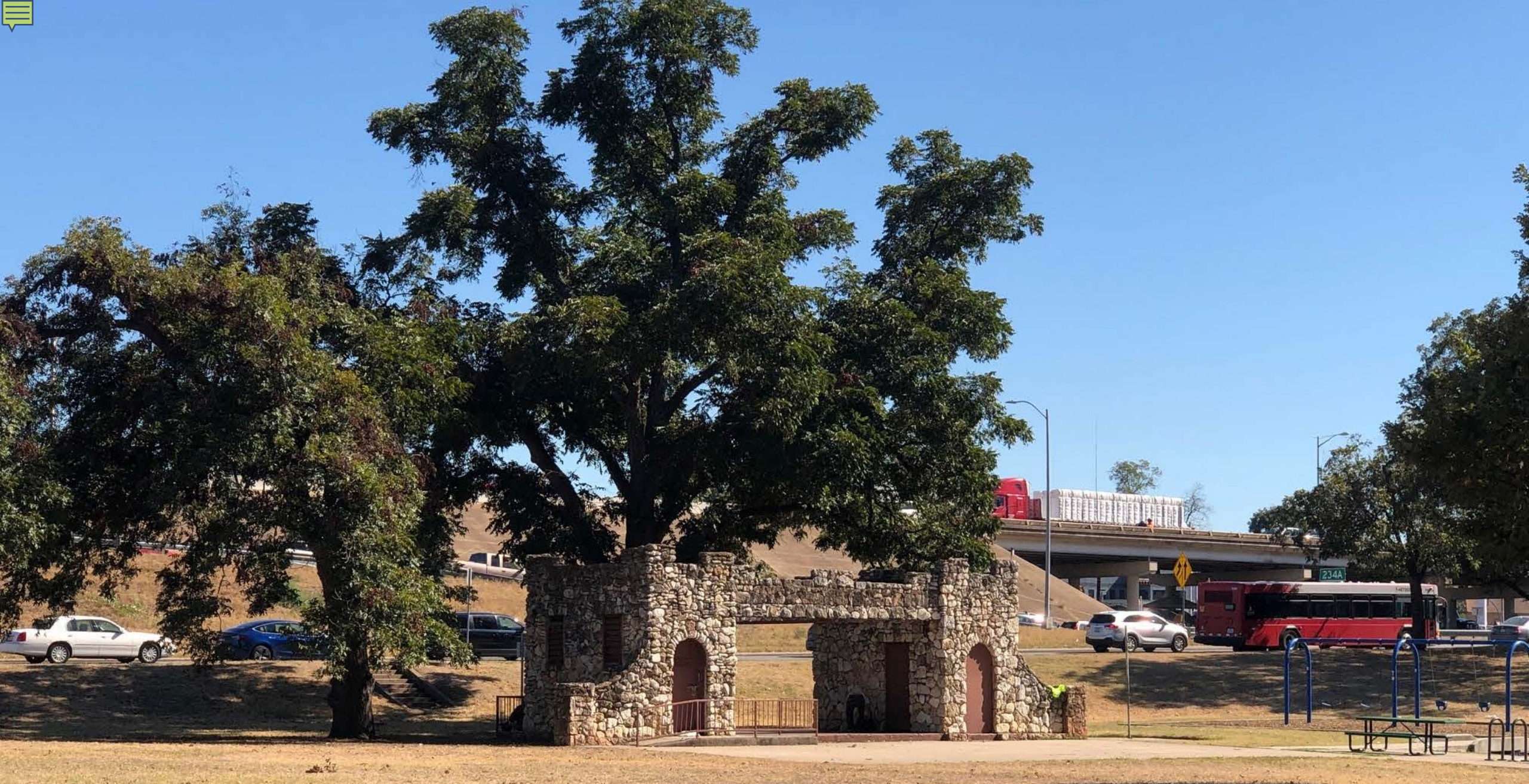
Sir Swante Palm Neighborhood Park