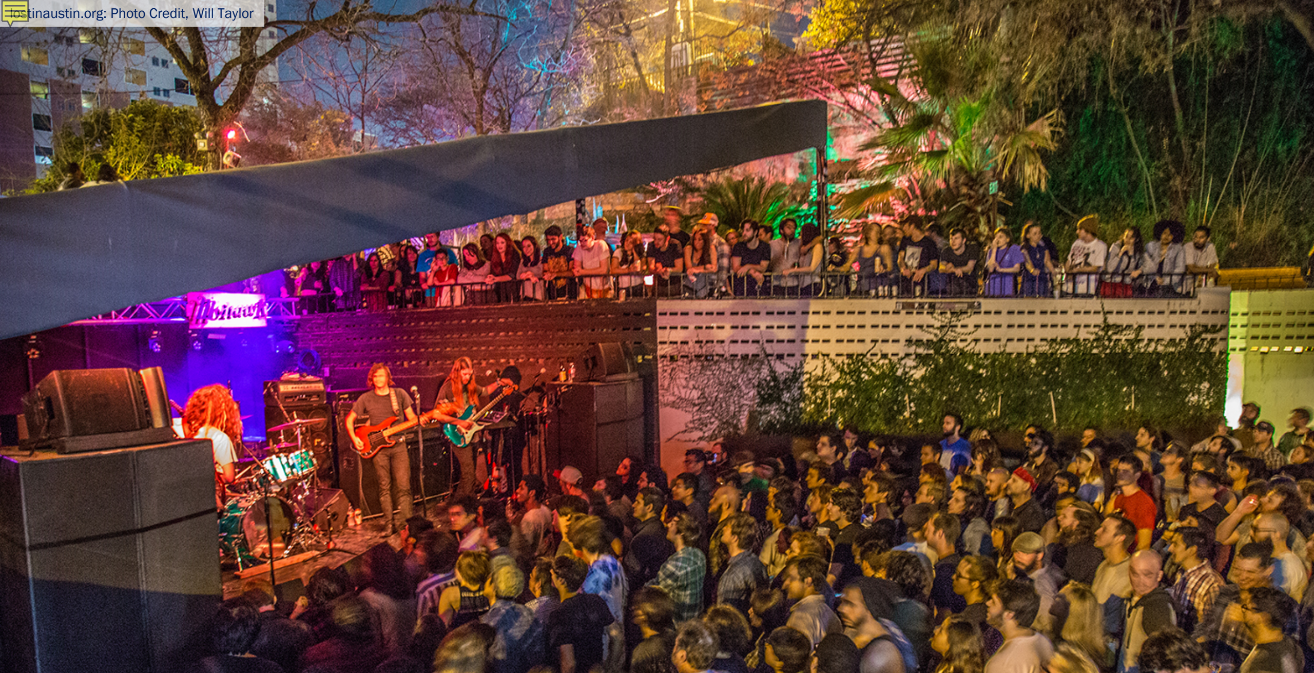
Red River Cultural District