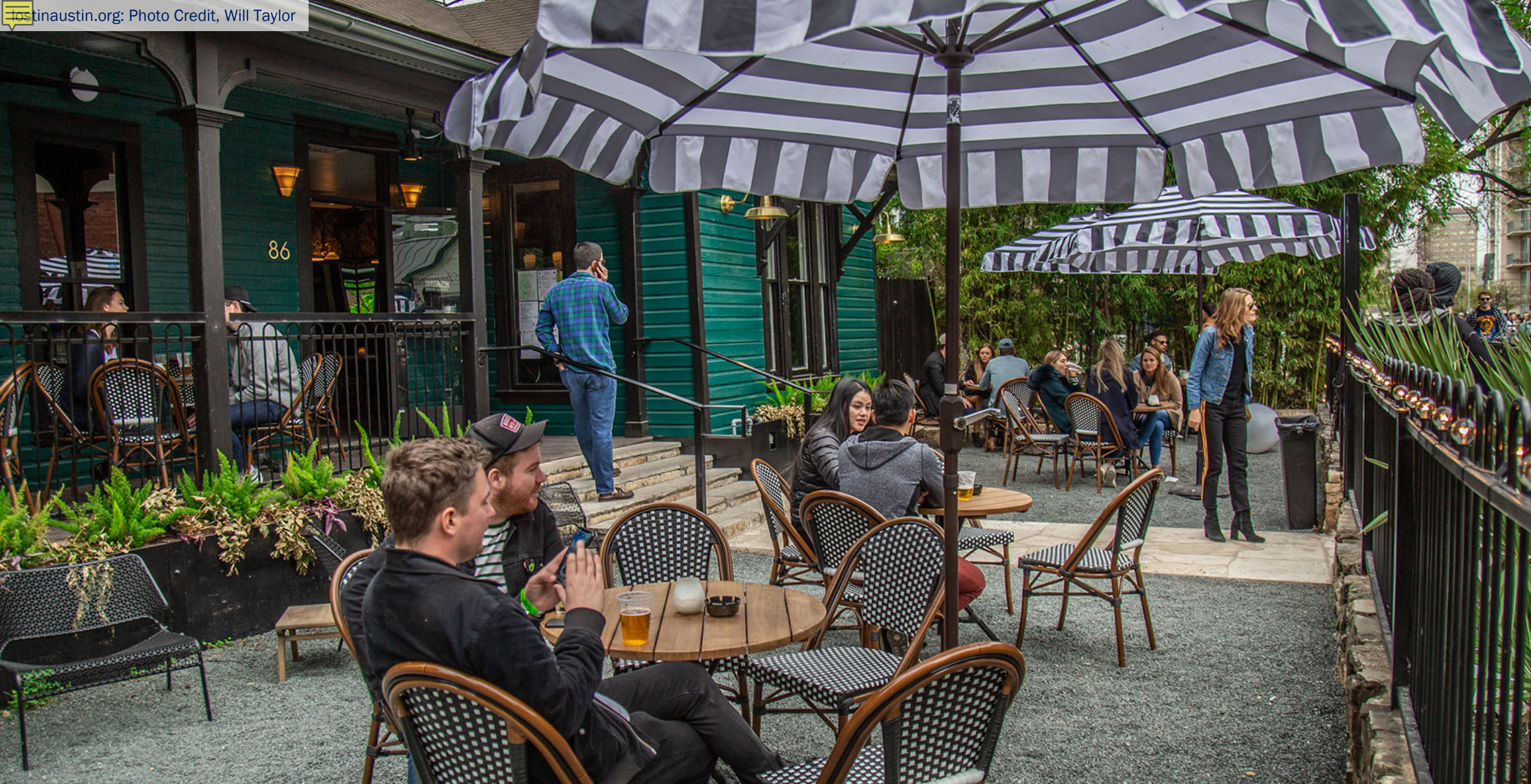
Rainey Street Neighborhood & Historic District