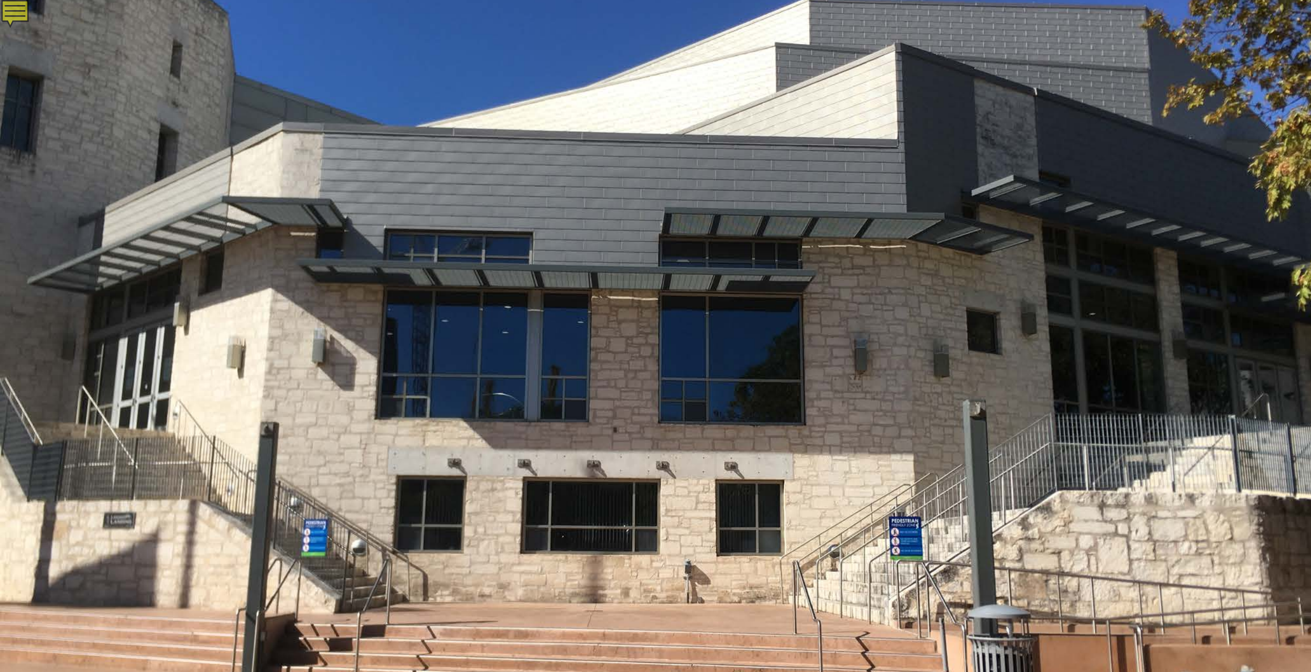
Neil Kocurek Memorial Austin Convention Center