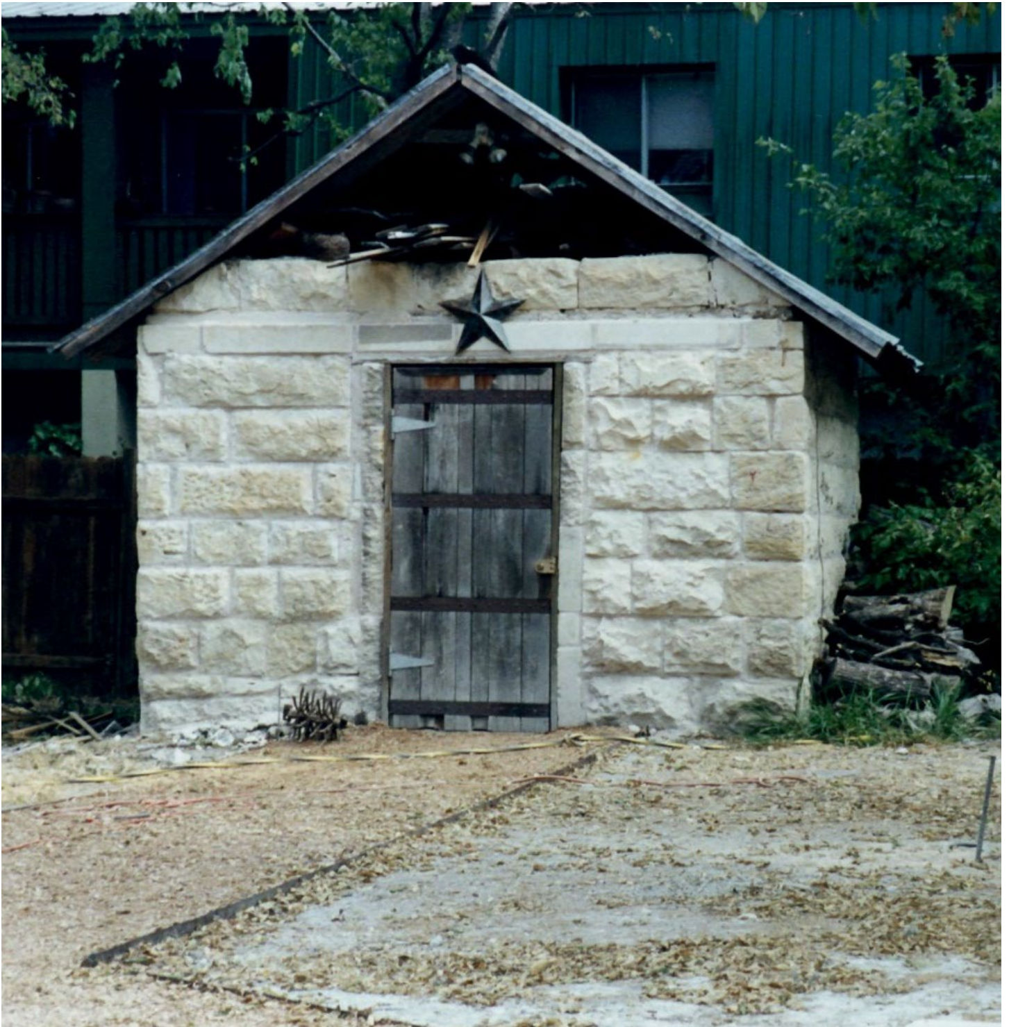
Stanley Homestead Outbuilding, south elevation prior to relocation, photo from historic zoning file, 2000