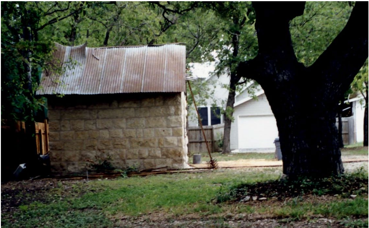
West elevation prior to relocation, 2000