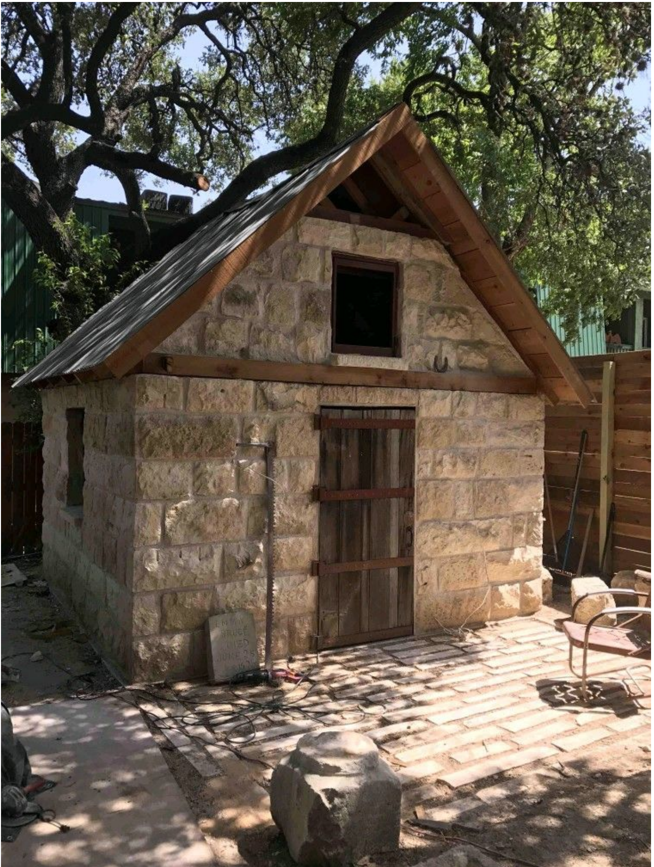
South elevation after relocation with changes in stonework patterns, including heavy timber beam in place of smooth stonework and infill of gable end, date of image unknown