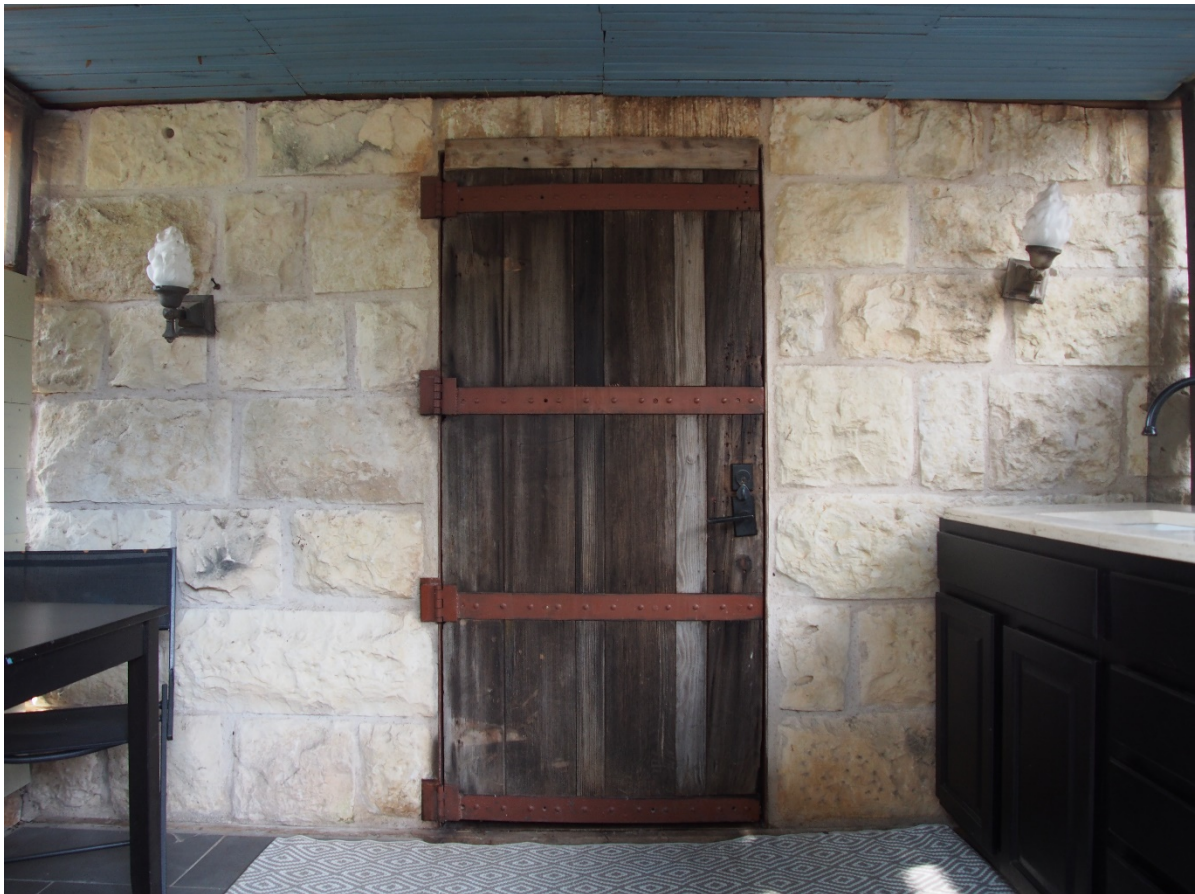
South elevation with unauthorized front addition, photos by Historic Preservation Office staff, May 28, 2021