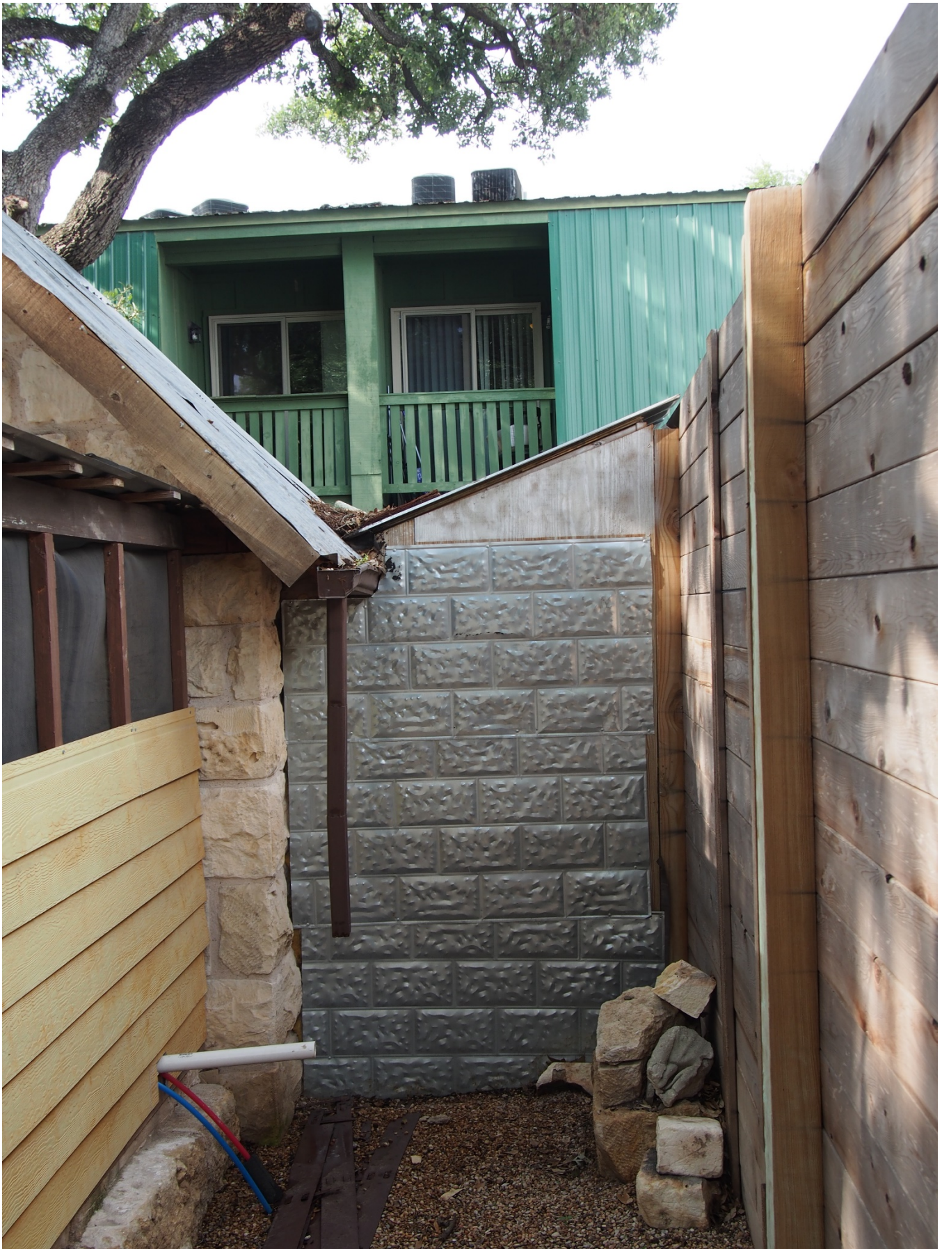
Second unauthorized addition at east elevation, photo by Historic Preservation Office staff, May 28, 2021