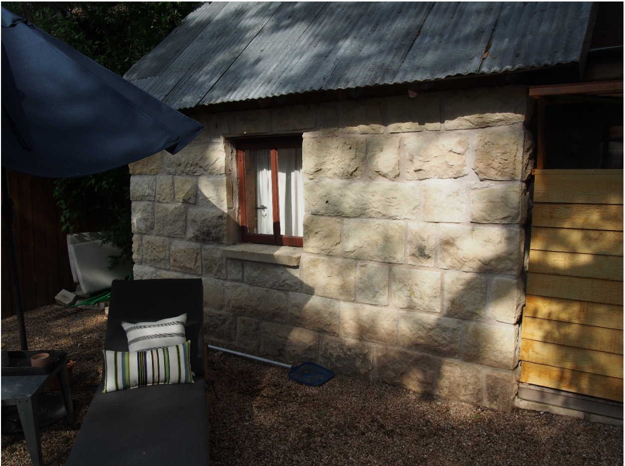
West elevation with added window, photo by Historic Preservation Office staff, May 28, 2021