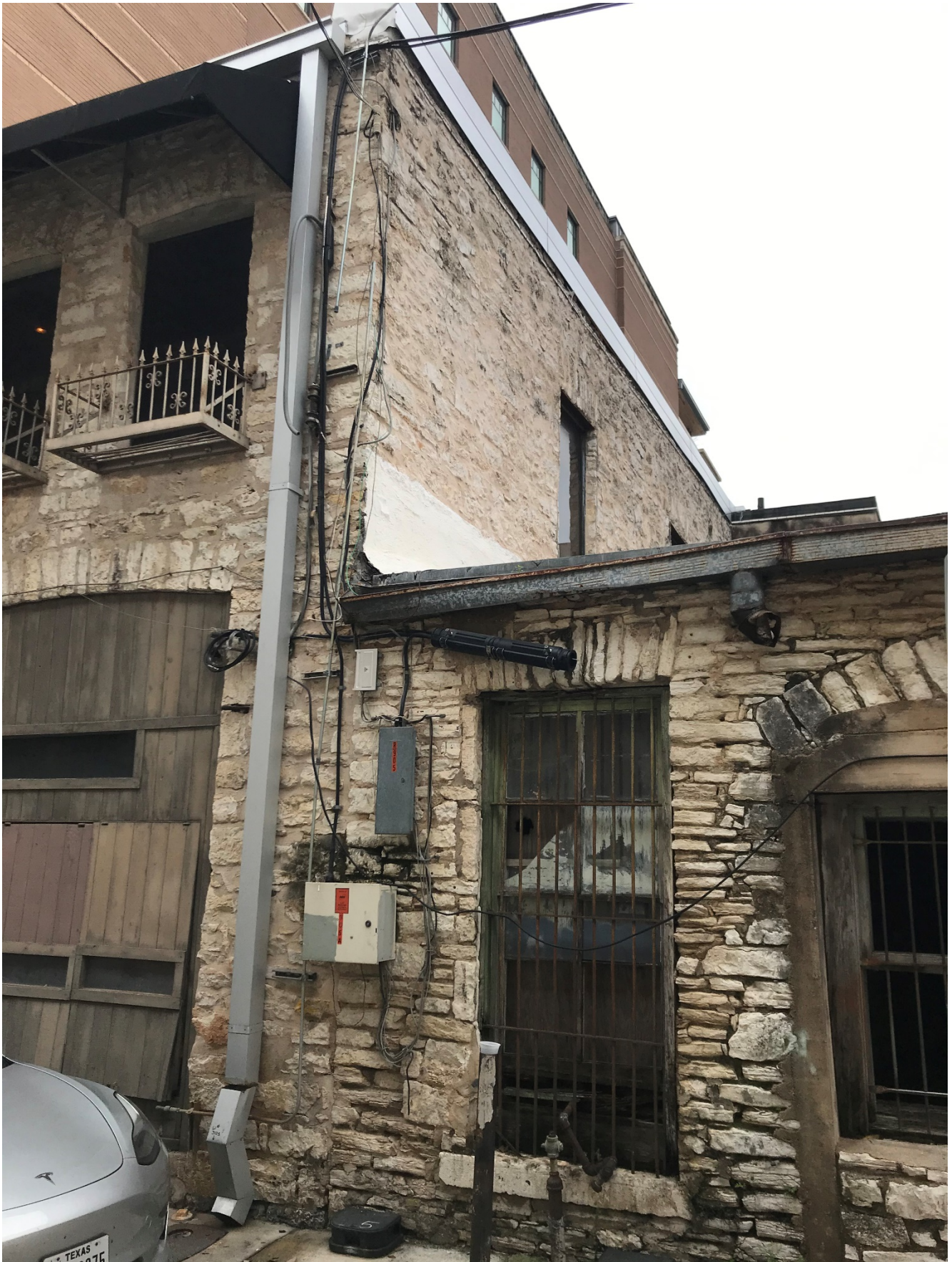
Alley elevation of 907 Congress Ave., Historic Preservation Office staff, May 2021. Note connection of one-story portion with the two-story Mutual Building, 905 Congress Ave.