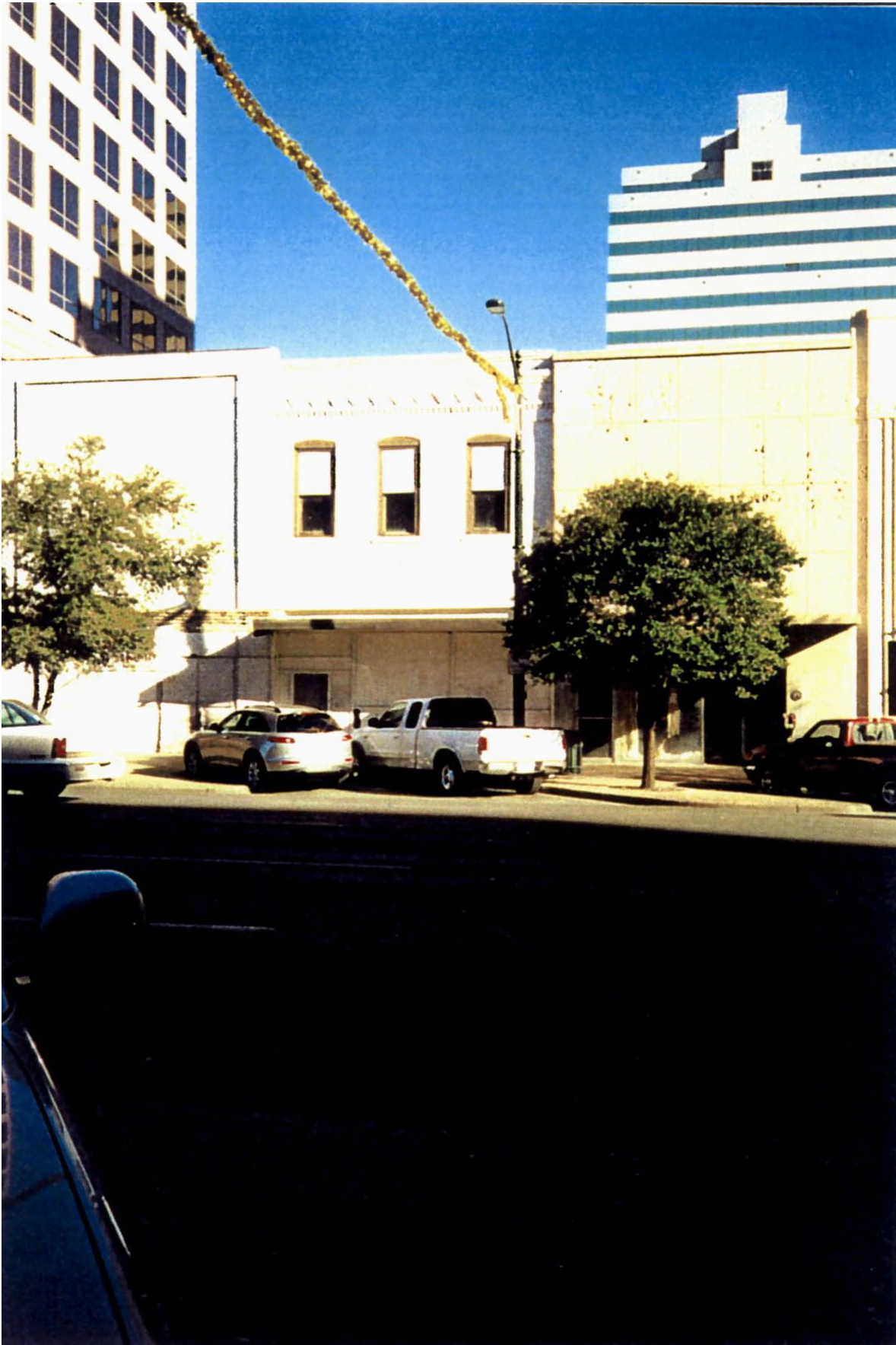
Photograph from historic landmark file for 909 Congress Ave. showing slipcover remaining on 907 Congress Ave., 2004.