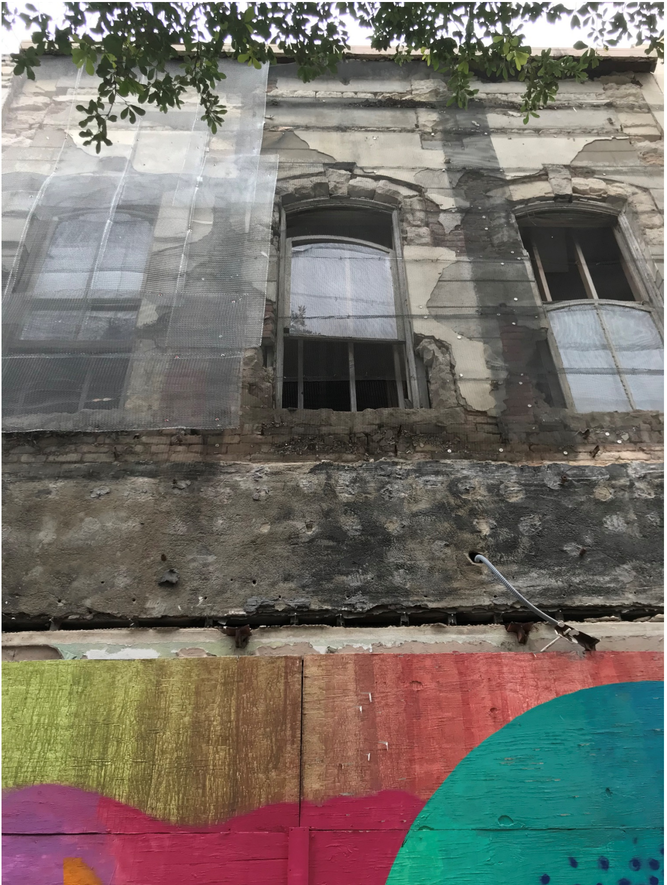
Current condition of 907 Congress Ave. façade, Historic Preservation Office staff, May 2021.