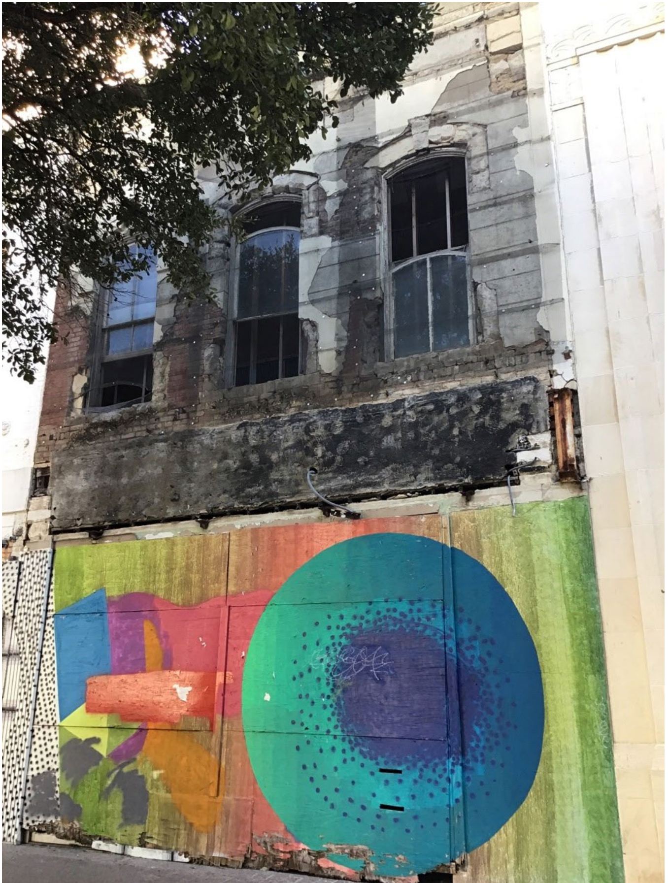
907 Congress Avenue, Historic Preservation Office staff, historic landmark inspections, 2020-2021.