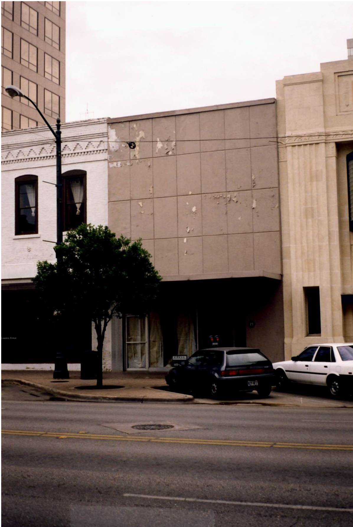
907 Congress Avenue, Historic Preservation Office staff, historic landmark inspections, undated.