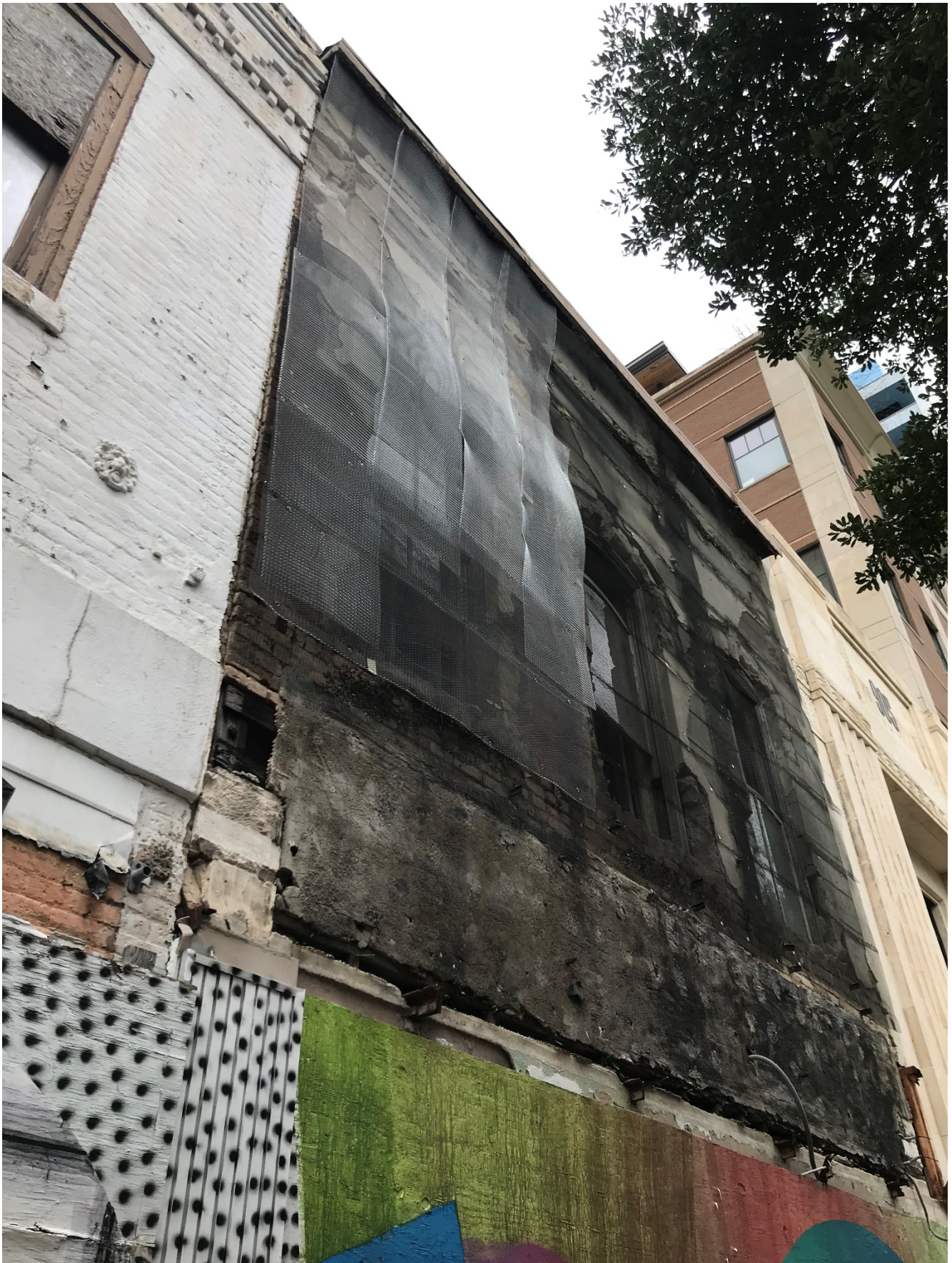
Current condition of 907 Congress Ave. façade, Historic Preservation Office staff, May 2021. Note wood structural members supporting brick façade.