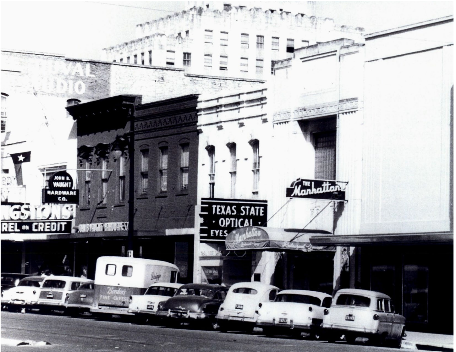
Historic photograph of 911 Congress Ave. (John B. Vaught Hardware Co.), 909 Congress Ave., and 907 Congress Ave. (Texas State Optical), Historic Preservation Office files, no date.