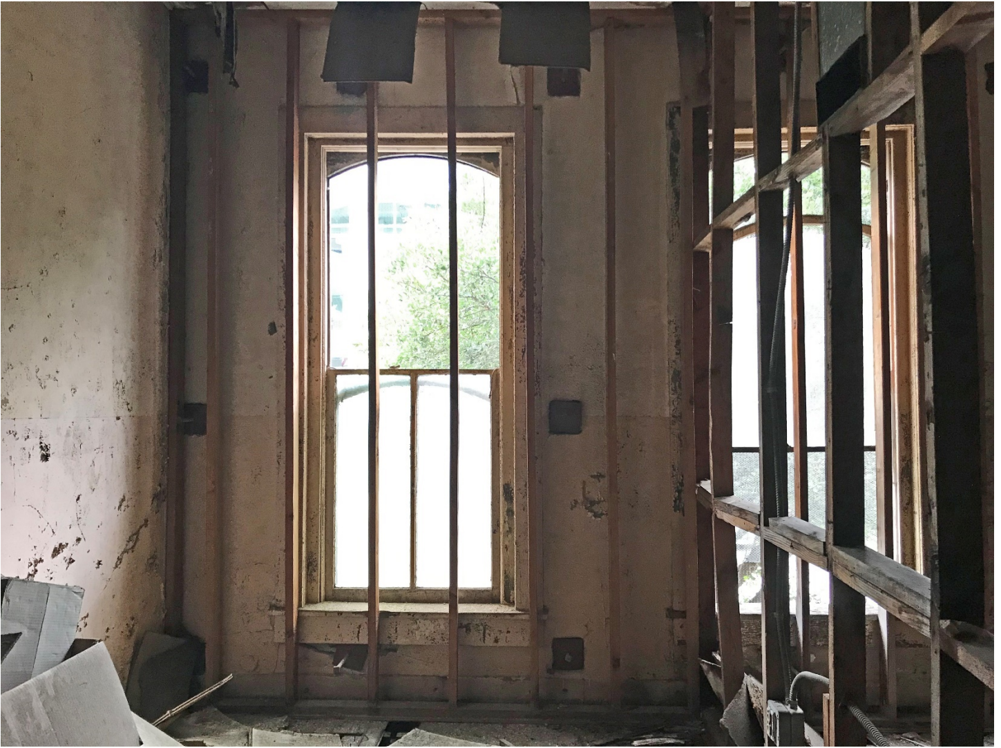
Interior of 907 Congress Ave. façade at second floor, Historic Preservation Office staff, May 2021.