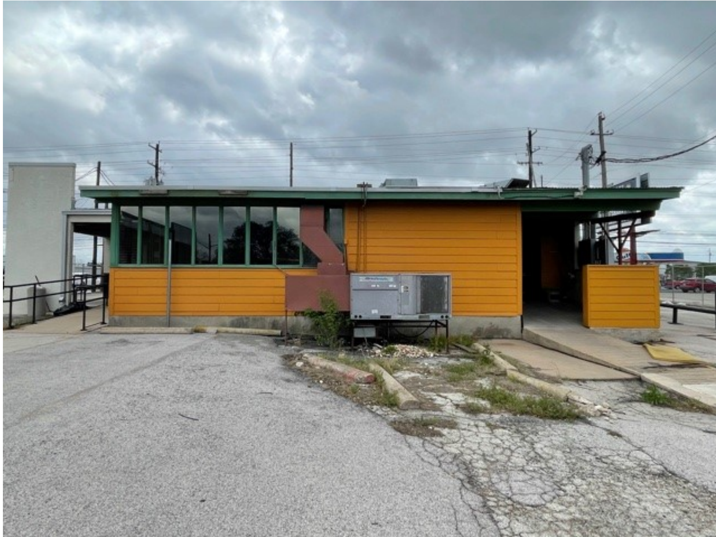
Threadgill's Old #1 – 6414 N. Lamar Blvd.

City of Austin – Historic Landmark Commission – June 28, 2020