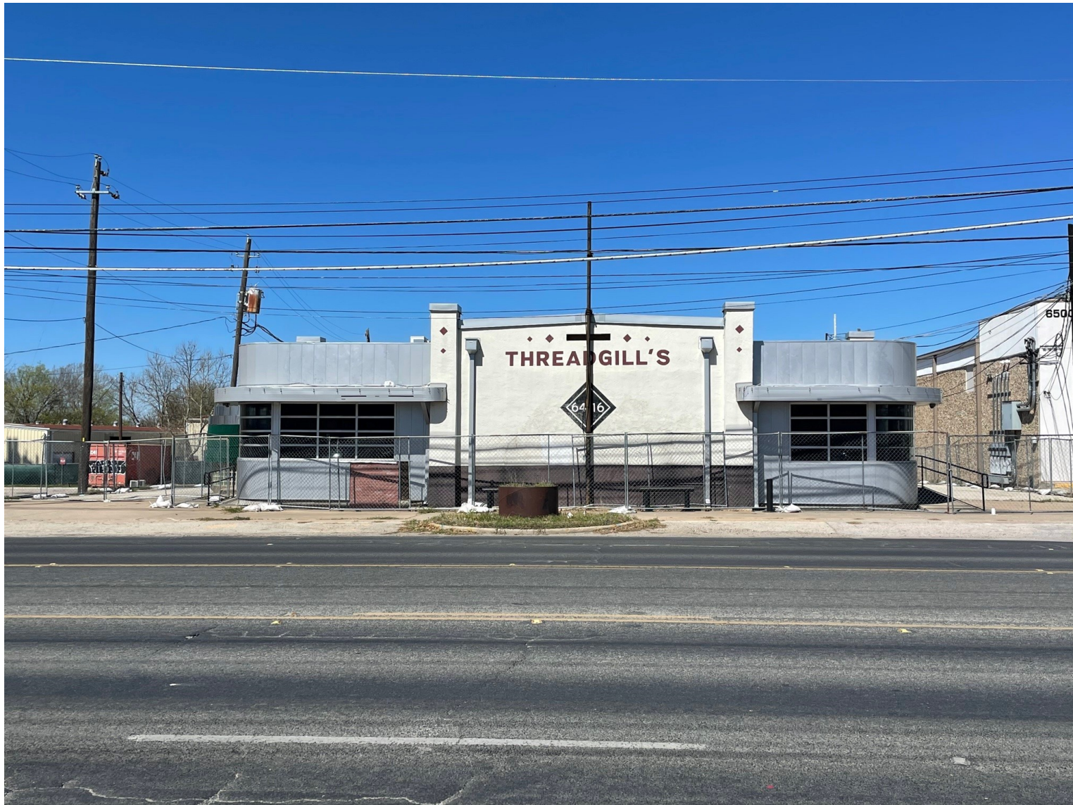
Threadgill's Old #1 – 6414 N. Lamar Blvd.

City of Austin – Historic Landmark Commission – June 28, 2020