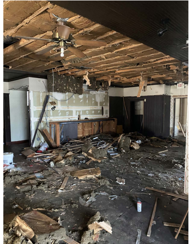
Threadgill's Old #1 – 6414 N. Lamar Blvd.

City of Austin – Historic Landmark Commission – June 28, 2020