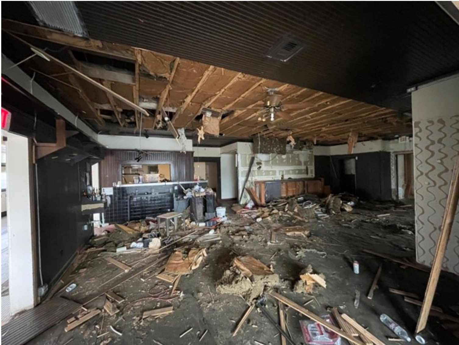
Threadgill's Old #1 – 6414 N. Lamar Blvd.

City of Austin – Historic Landmark Commission – June 28, 2020