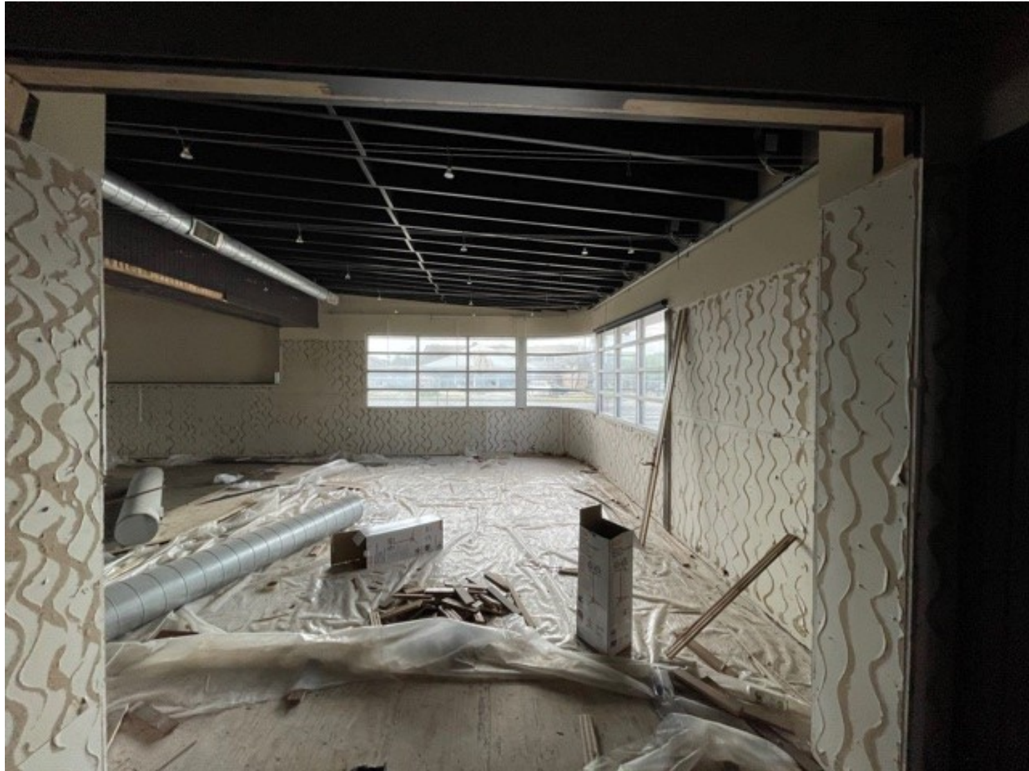
Threadgill's Old #1 – 6414 N. Lamar Blvd.

City of Austin – Historic Landmark Commission – June 28, 2020