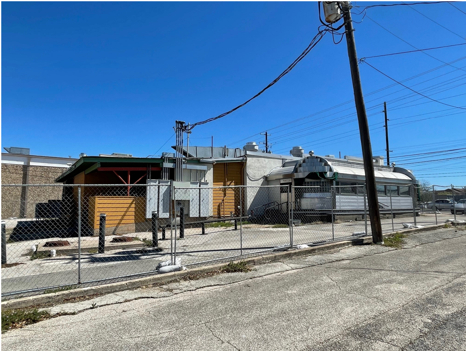
Threadgill's Old #1 – 6414 N. Lamar Blvd.

City of Austin – Historic Landmark Commission – June 28, 2020