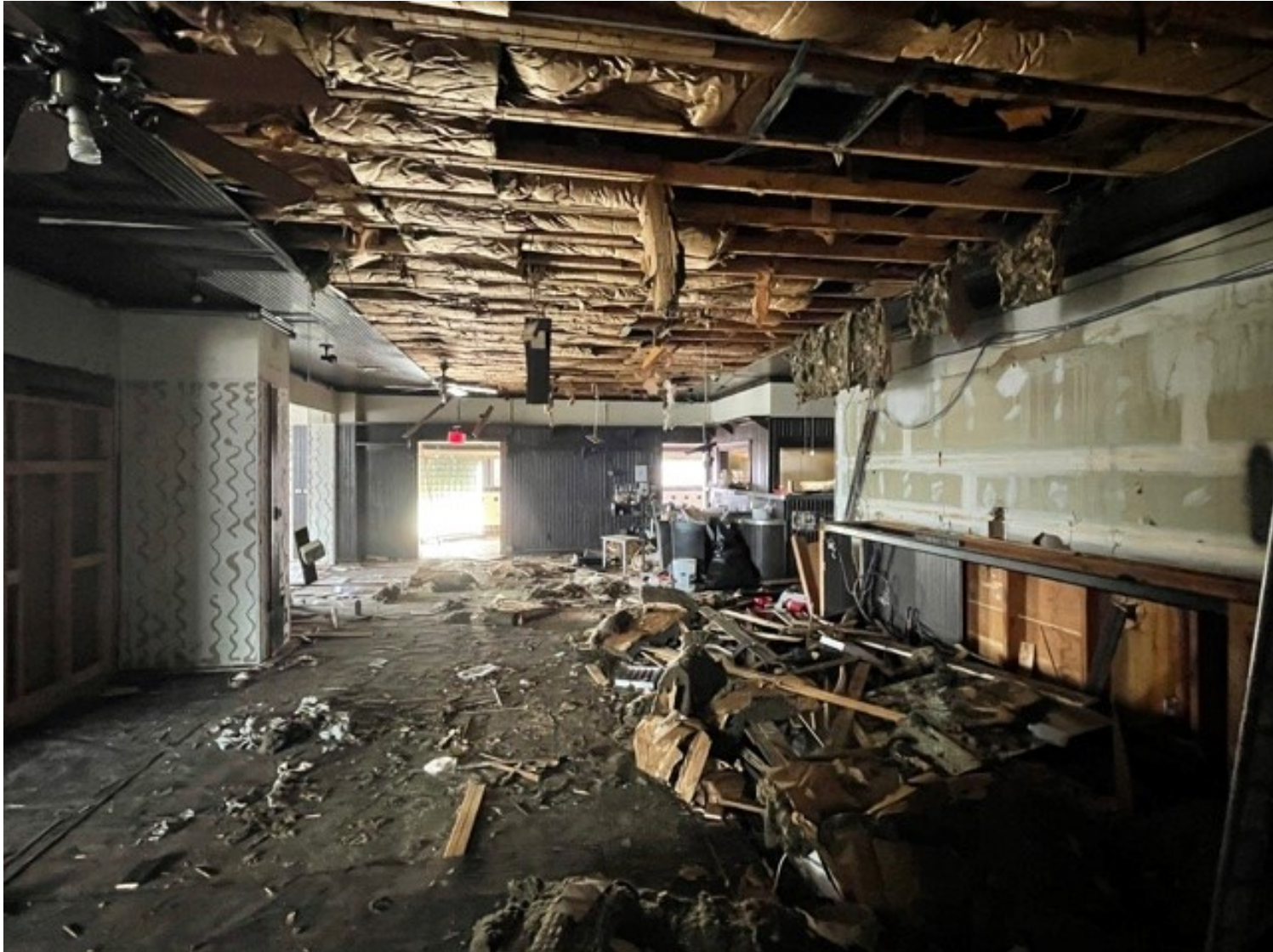
Threadgill's Old #1 – 6414 N. Lamar Blvd.

City of Austin – Historic Landmark Commission – June 28, 2020