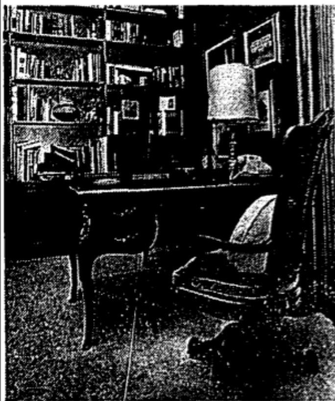
STUDY IS BRIGHT ORANGE AND WHITE Paneled walls provide nice accent