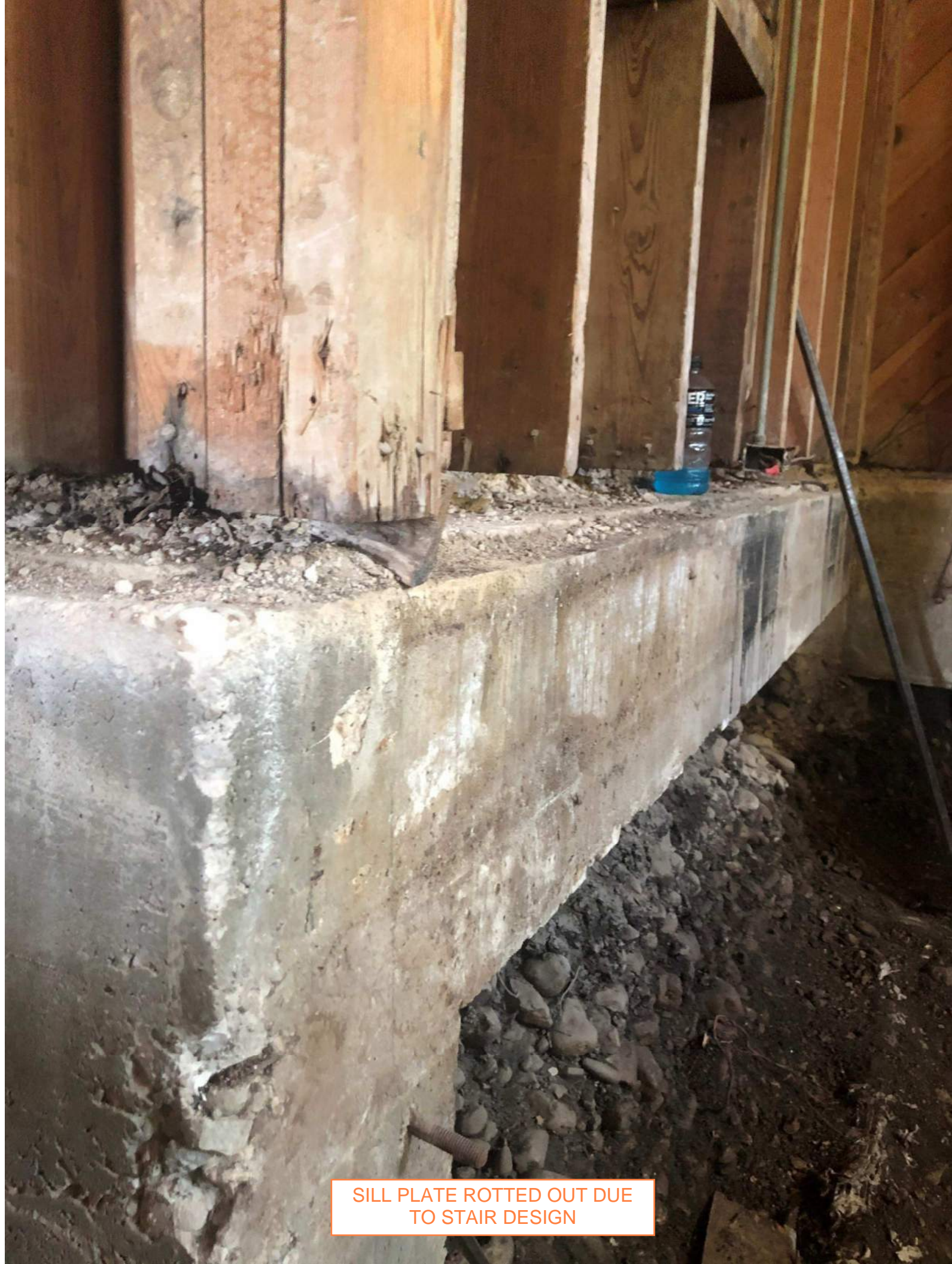
SILL PLATE ROTTED OUT DUE TO STAIR DESIGN