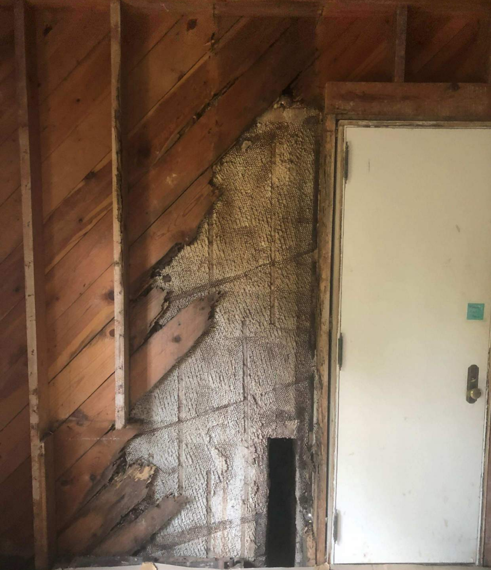
WOOD WITHIN STAIRCASE WALL ROTTED OUT AND SHEATHING ROT ON ALL VERTICAL PLANES ADJACENT TO STAIRCASE