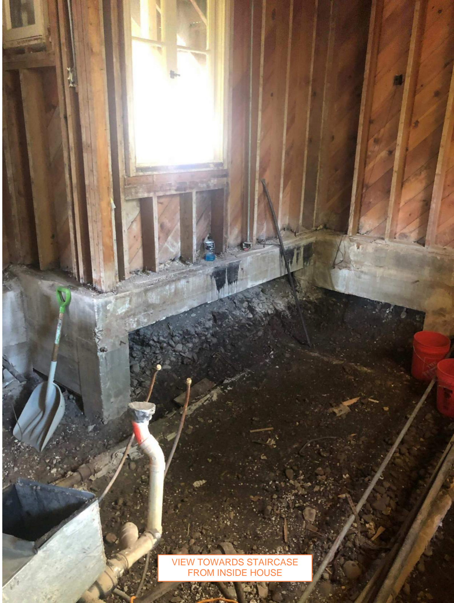
VIEW TOWARDS STAIRCASE FROM INSIDE HOUSE