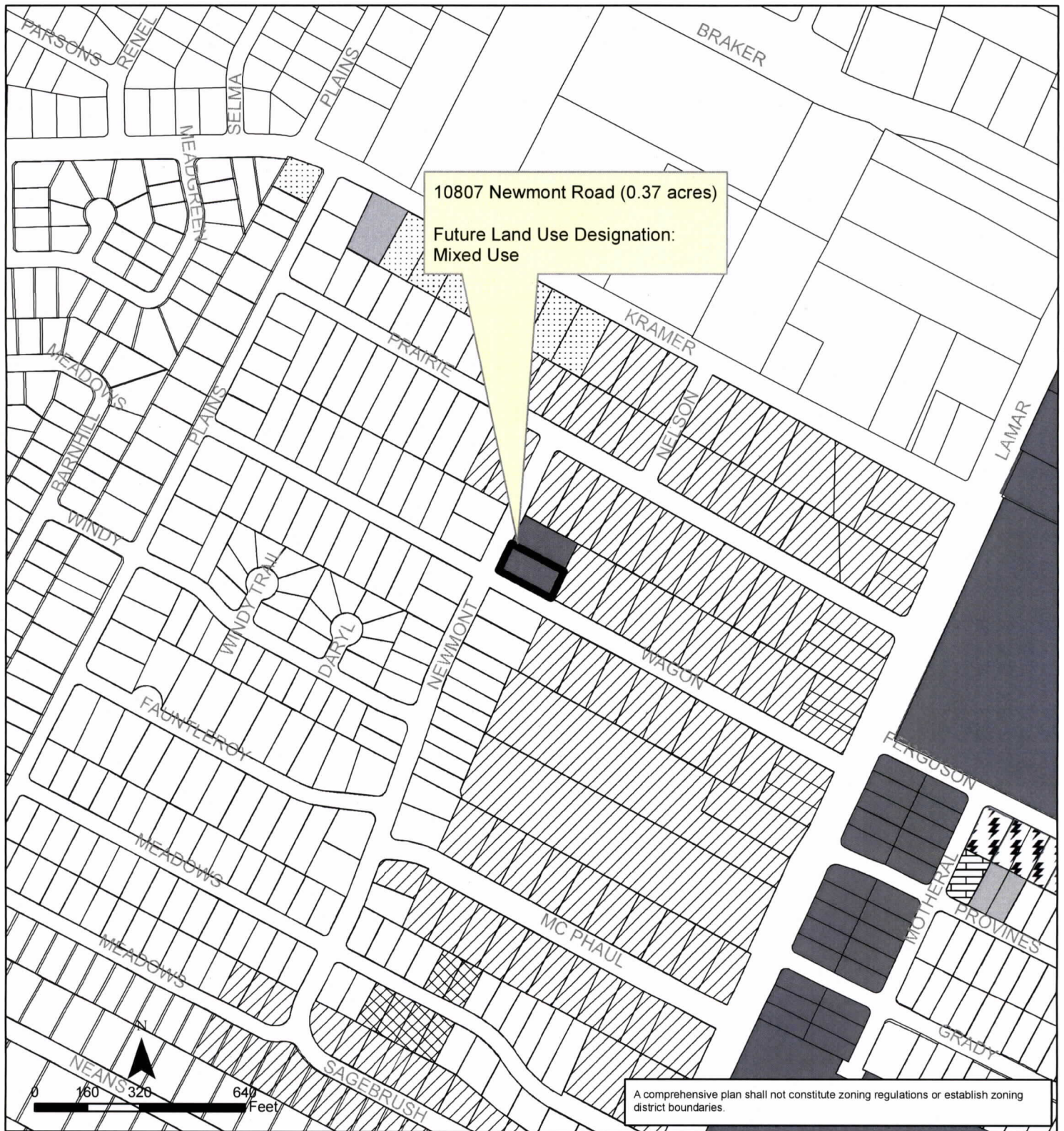
Exhibit A North Austin Civic Association Neighborhood Planning Area NPA-2021-0007.01

This product is for informational purposes and may not have been prepared for or be suitable for legal, engineering, or surveying purposes. It does not represent an on-the-ground survey and represents only the approximate relative location of property boundaries.