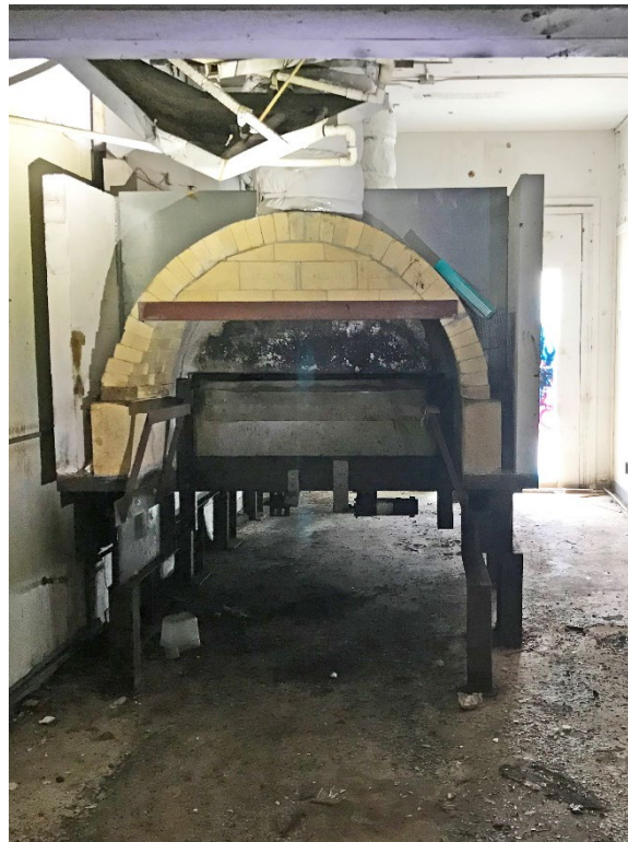
Historic Preservation Office Staff, August 10, 2021