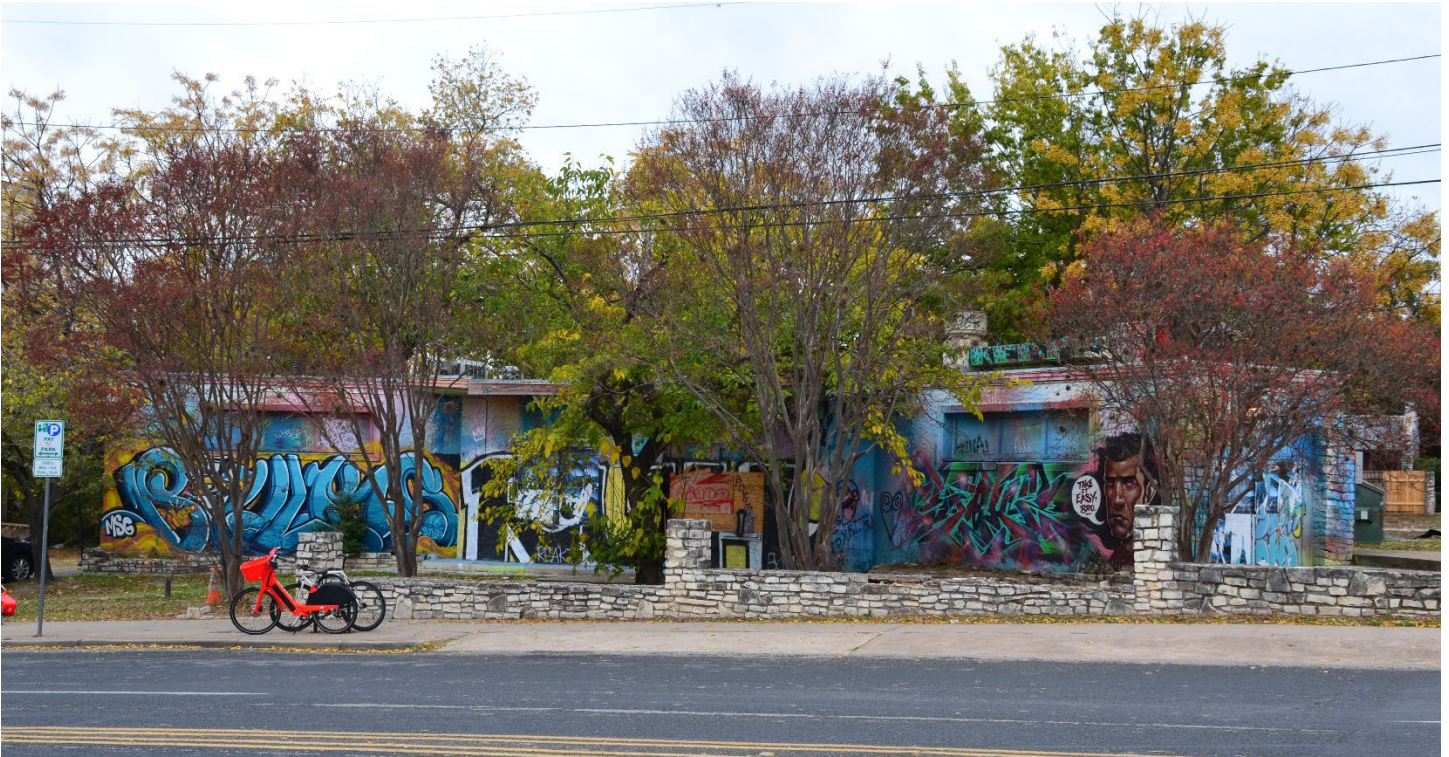
HHM, Inc., Historic Resources Survey for Old Austin Neighborhood Association, 2019