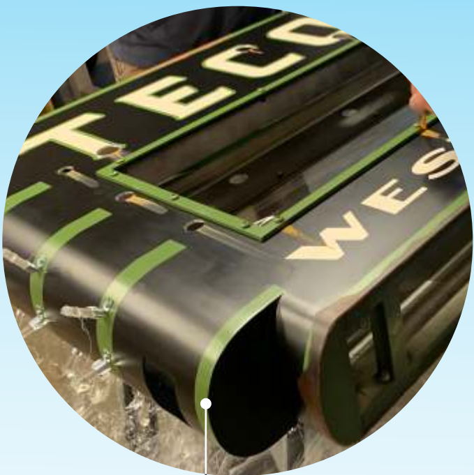
Contoured Aluminum cabinet