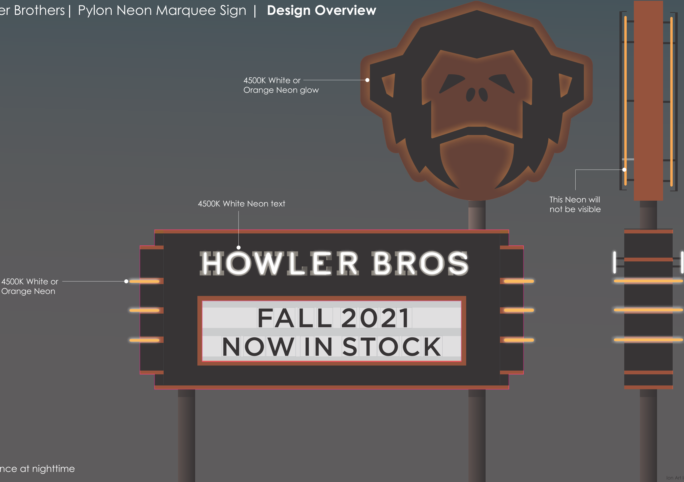
Appearance at nighttime