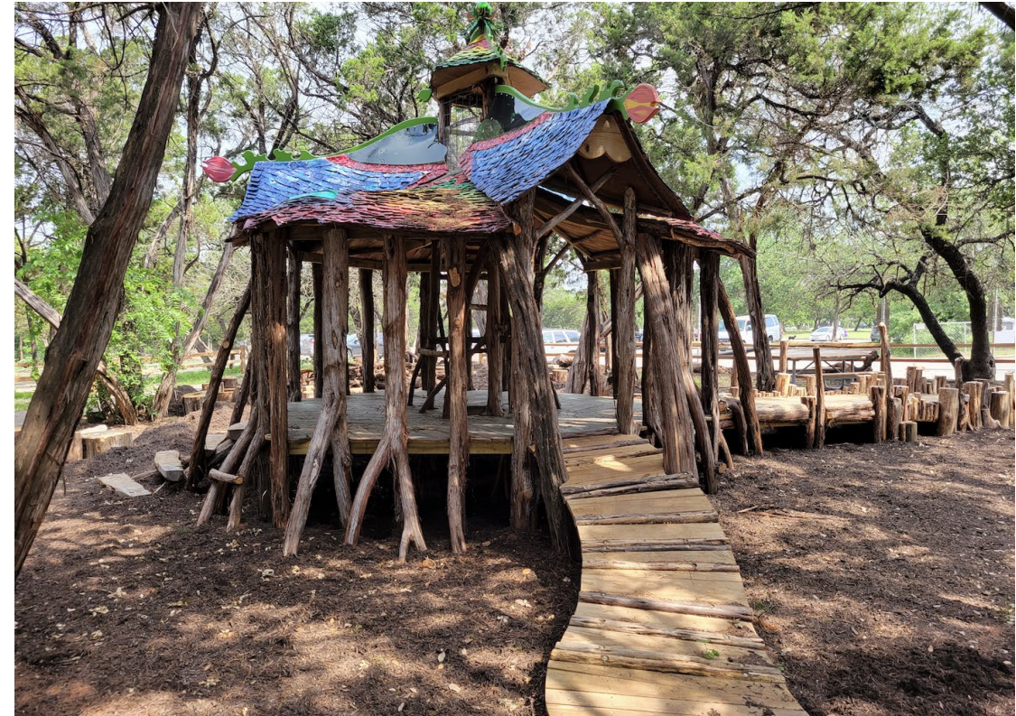
Walnut Creek Metro Park Playground and Nature Play (D7)