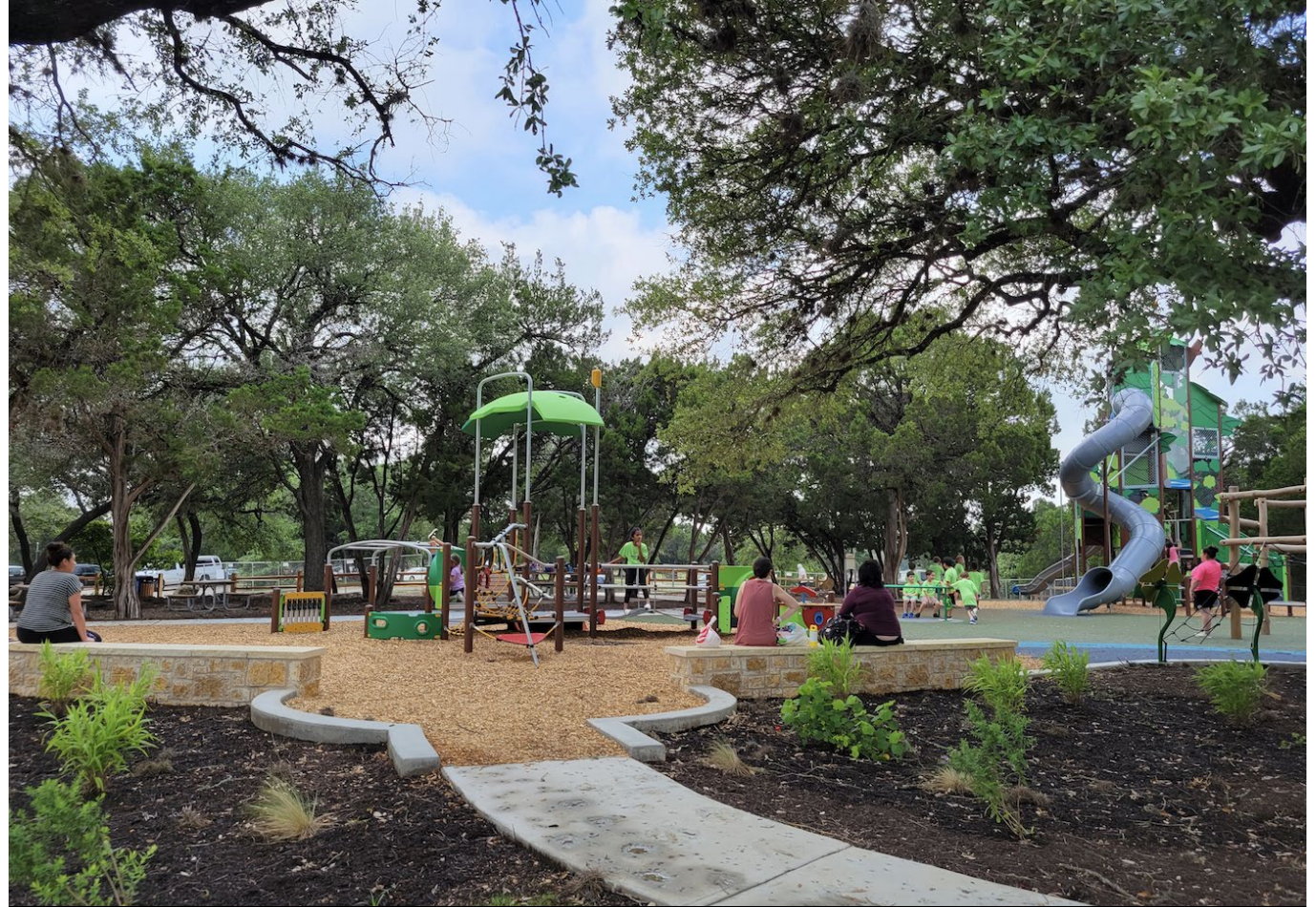
Walnut Creek Metro Park Playground and Nature Play (D7)