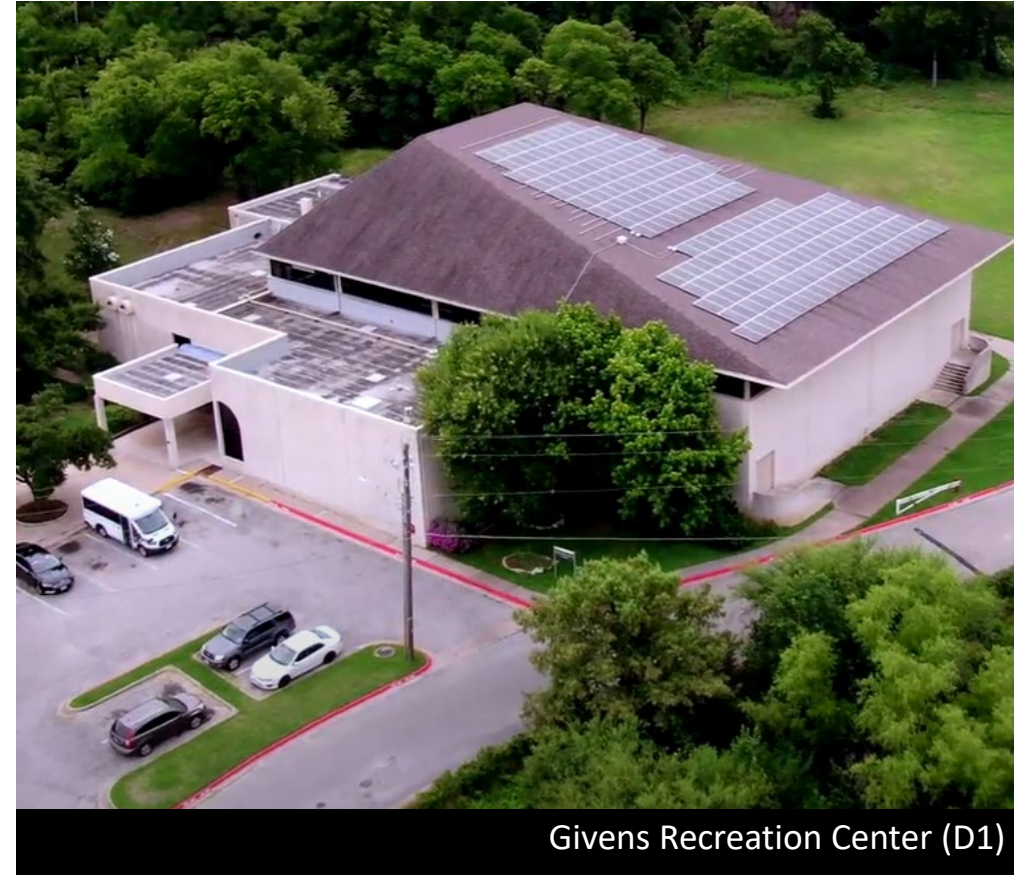
Givens Recreation Center (D1)