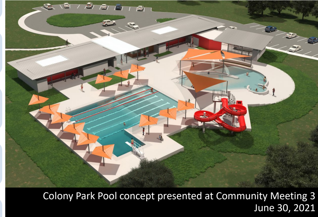
Colony Park Pool concept presented at Community Meeting 3 June 30, 2021