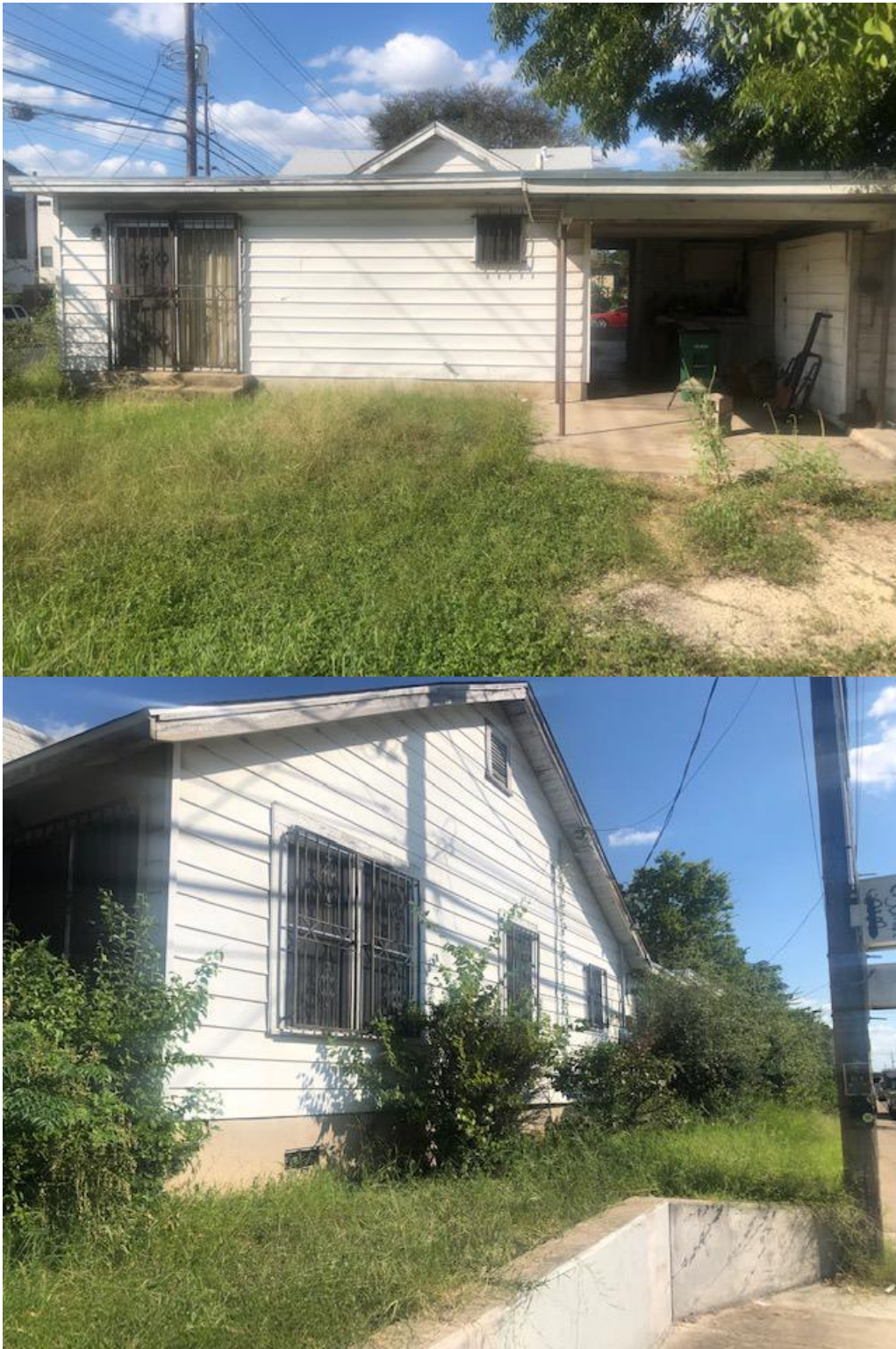
Demolition application, 2021