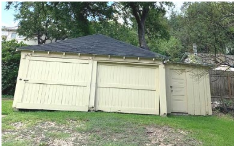
Google Street View and demolition application, 2021