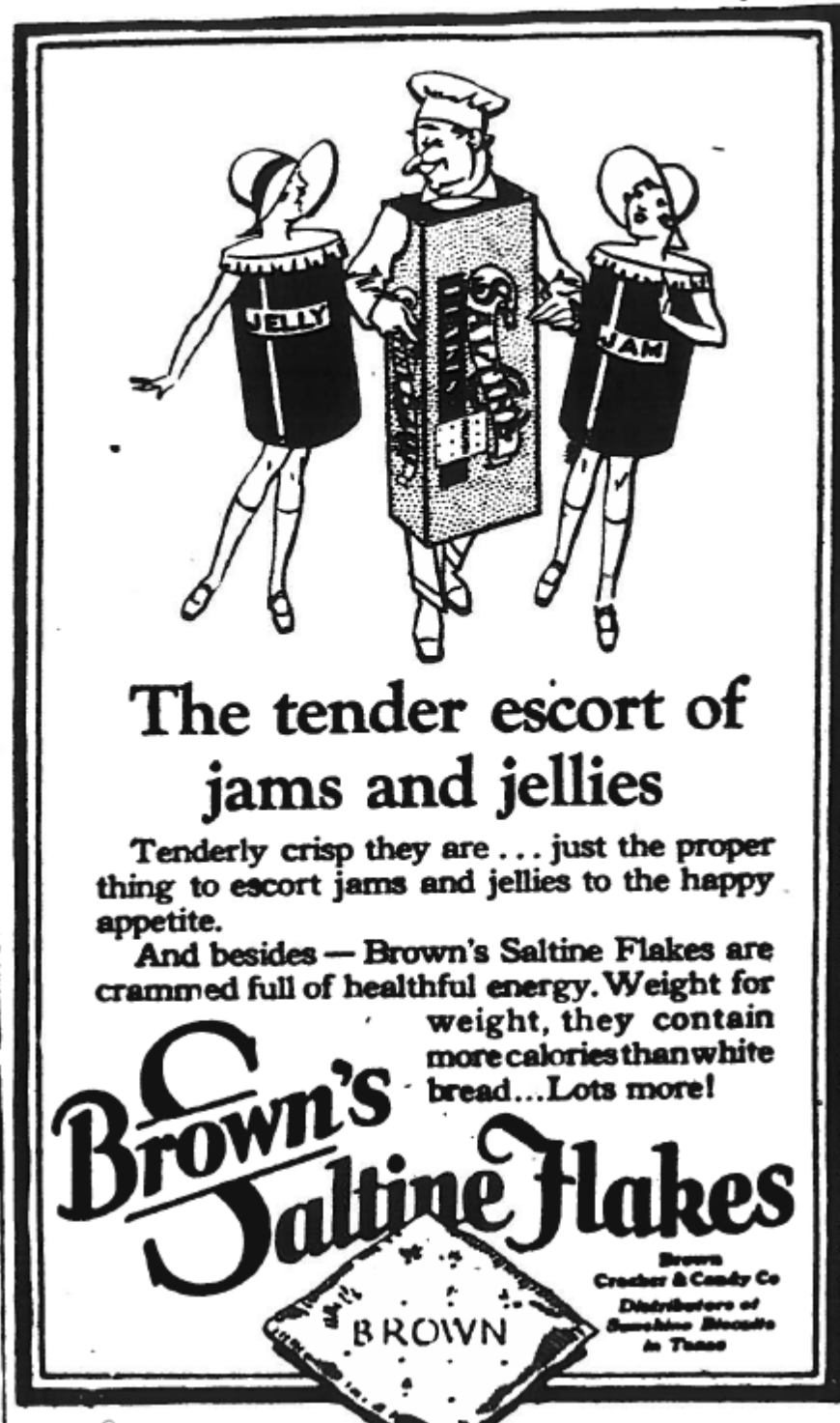
Advertisement for Brown's Crackers Austin American , November 7, 1928

NOTE: Brown Cracker and Candy Company was located at 120 E. 4 th Street.