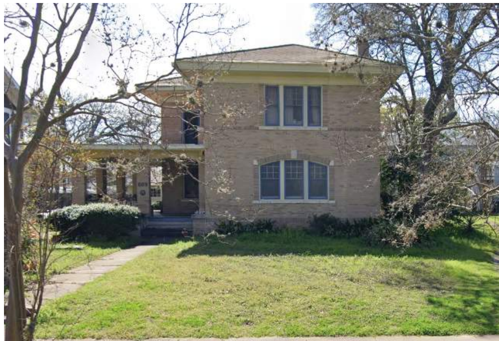
609 W. 32ND ST. McCaleb House