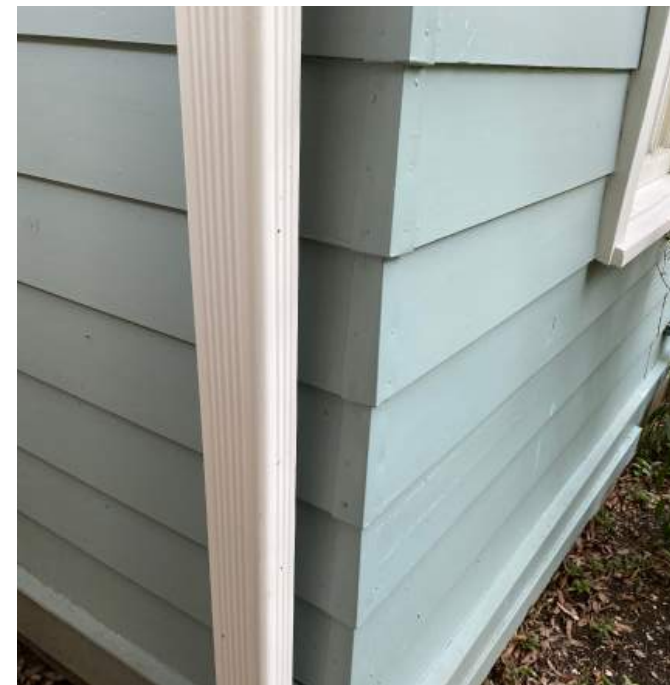
Painted lap siding with mitered corners.