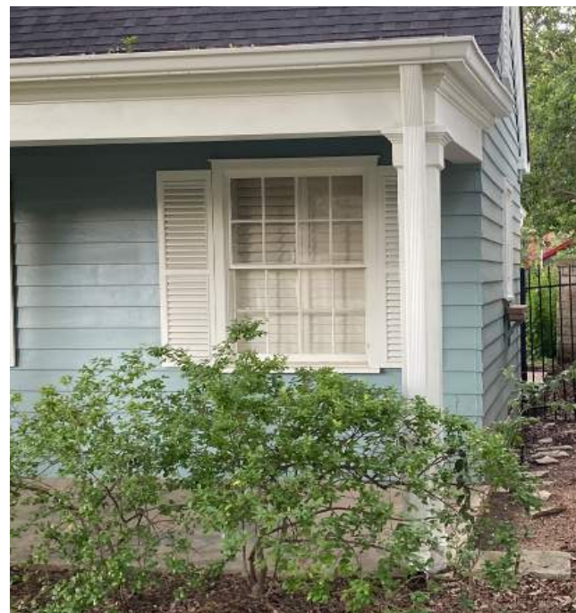
Painted Double Hung Windows with Divided Lites