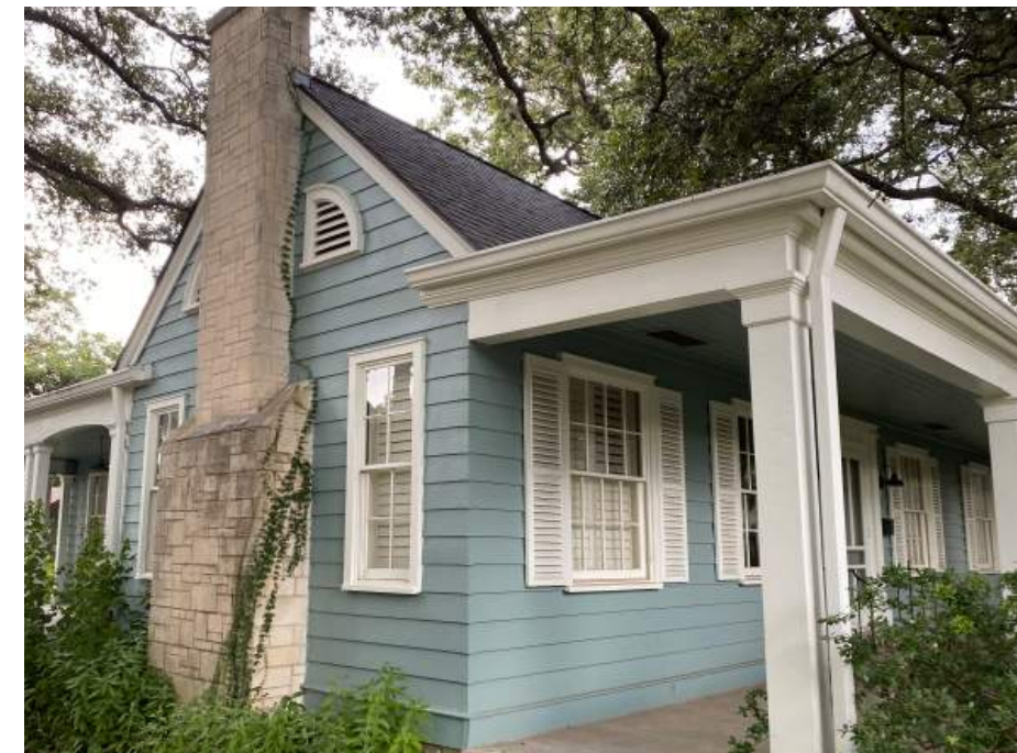
Painted columns and beams w/ minimal trim. Concrete patio. K-Style gutters and downspouts. Side gable w/ steep roof.