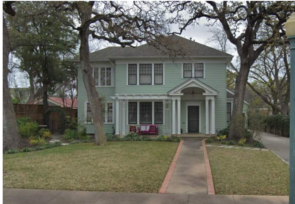
105 W. 32ND ST. Padgett - Painter House