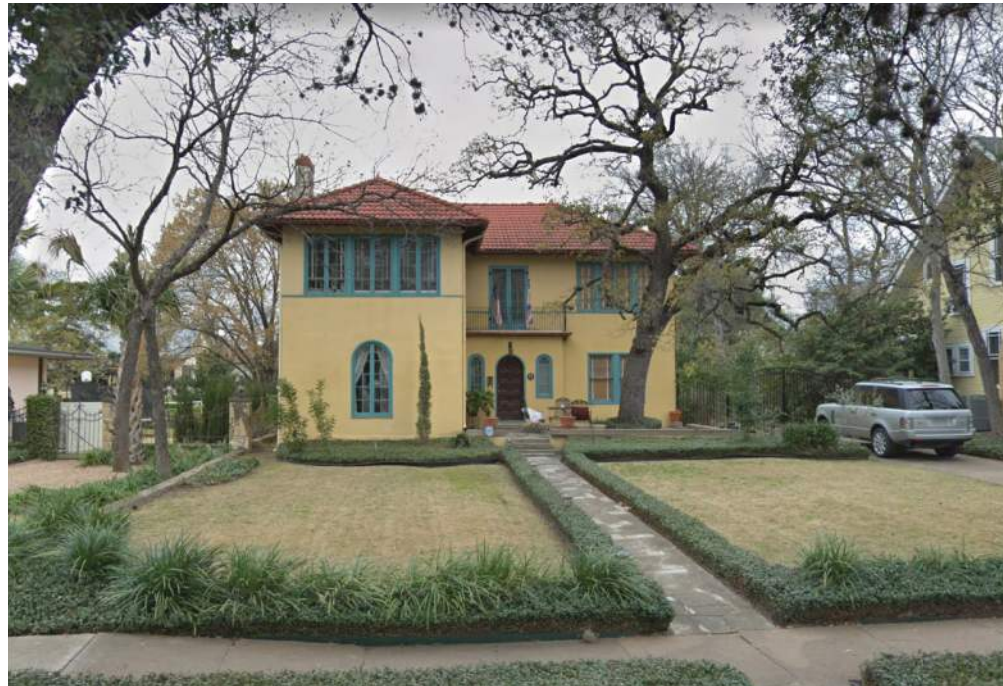
106 W. 32ND ST. Spurgeon Bell House