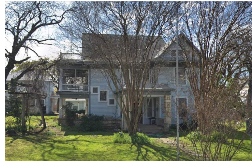
613 W. 32ND ST. McCallum House National Register Property