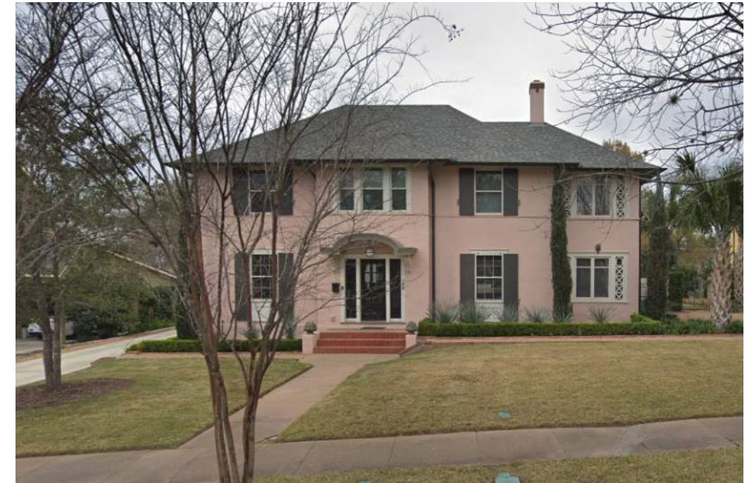
108 W. 32ND ST. Webb - Simms - Aldridge House