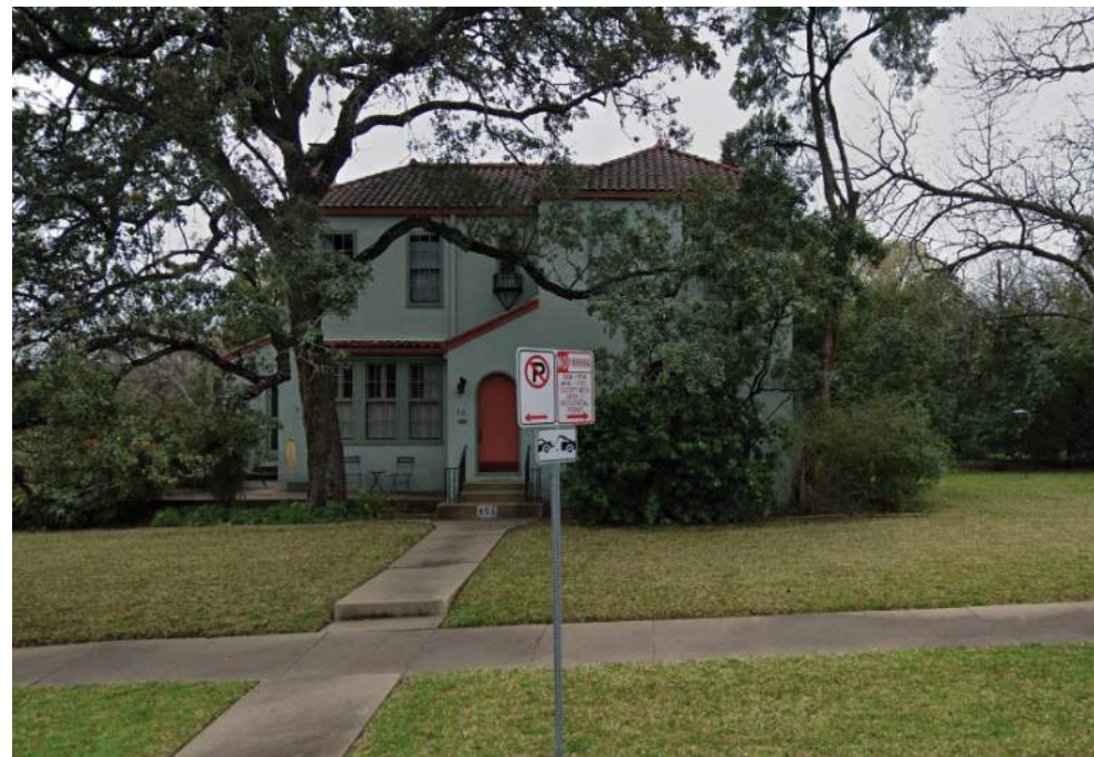
401 W. 32ND ST. Dr. Walter Bacon Black House