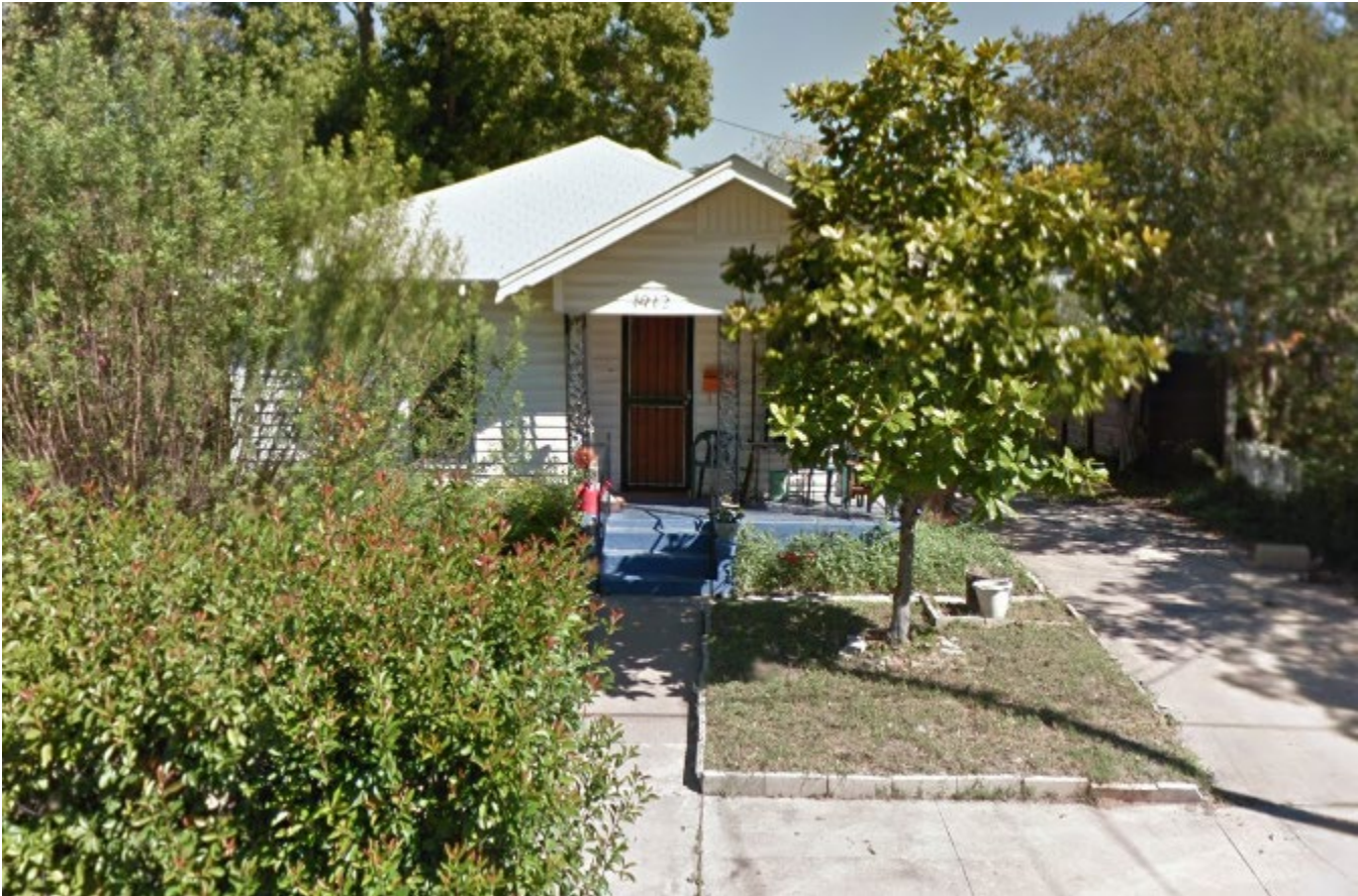
Google Street View, 2014