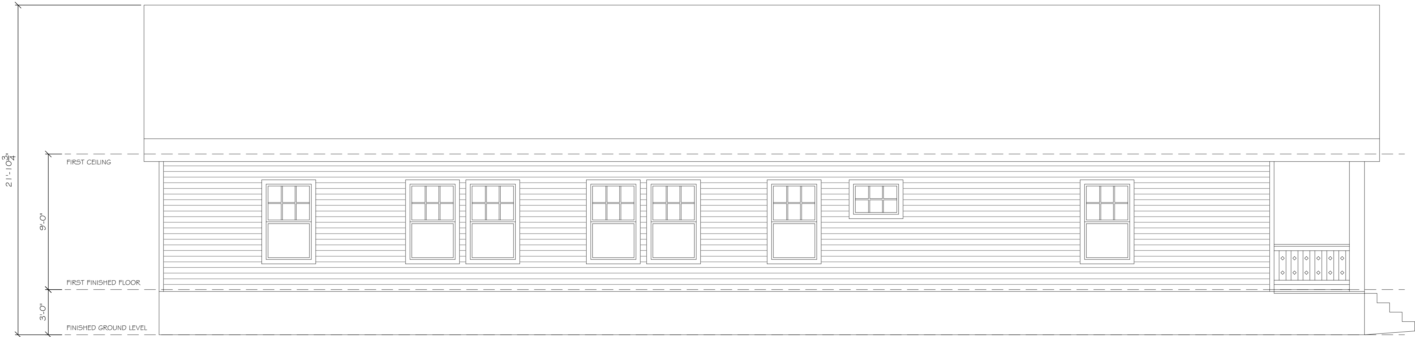
Proposed Duplex Side Elevation