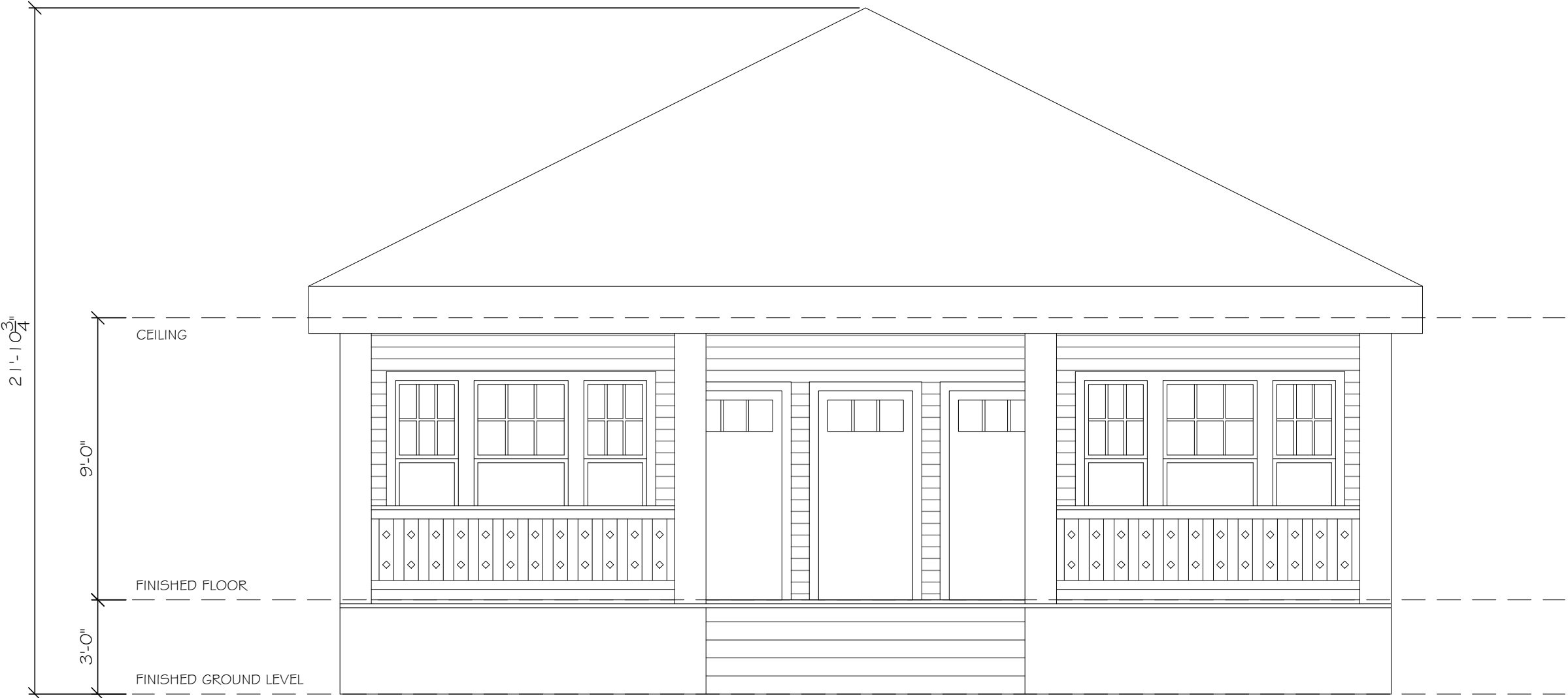
Proposed Duplex Front Elevation