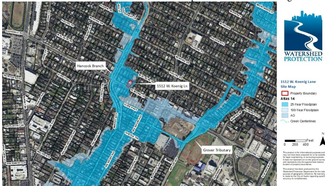
Site Location Map with Current Floodplains for 1512 W Koenig

Concerning a public hearing and consideration of an ordinance authorizing floodplain variances to construct a parking area located at 1512 W. Koenig Lane, which encroaches in the 25-year and 100-year floodplains of Hancock Branch of Shoal Creek.