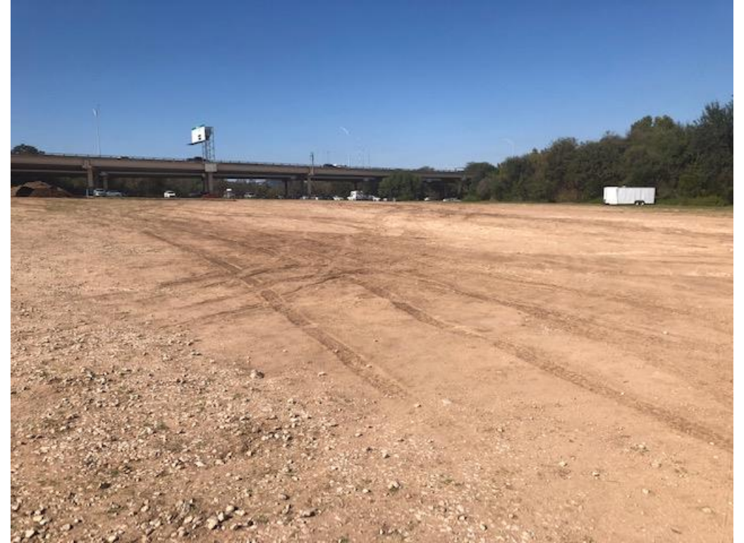
Ruts and evidence of ponding on non vegetated area of landfill cap