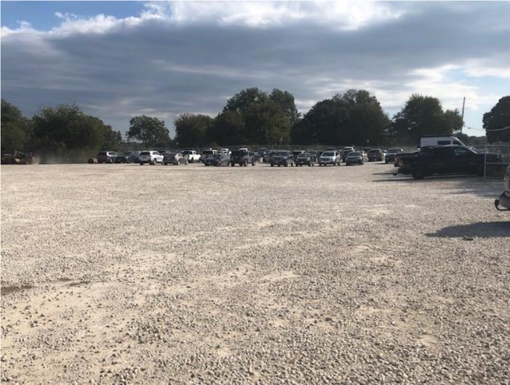
Condition of gravel area