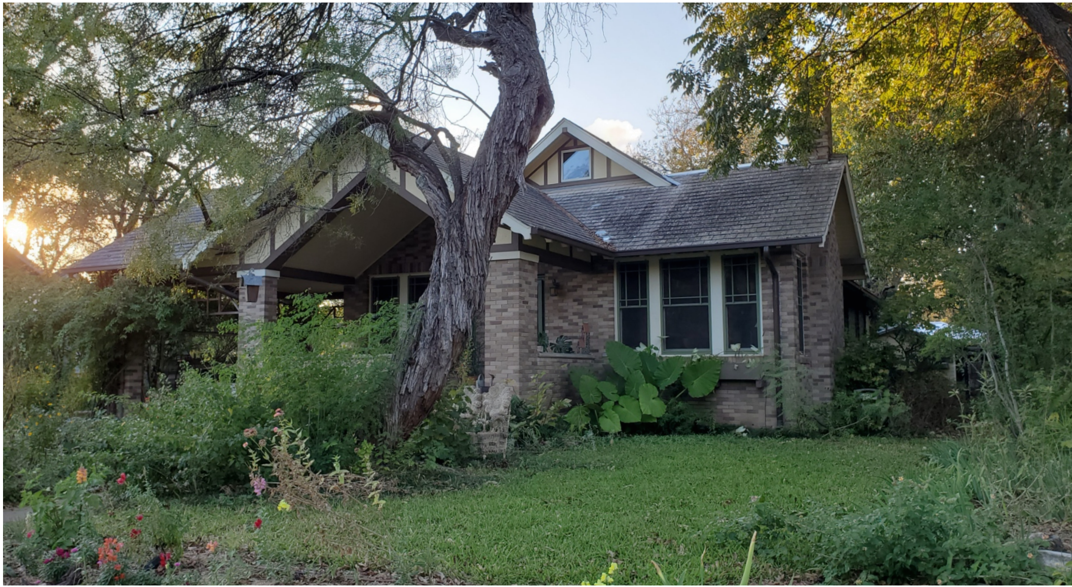
EXISTING FRONT ELEVATION PHOTOS