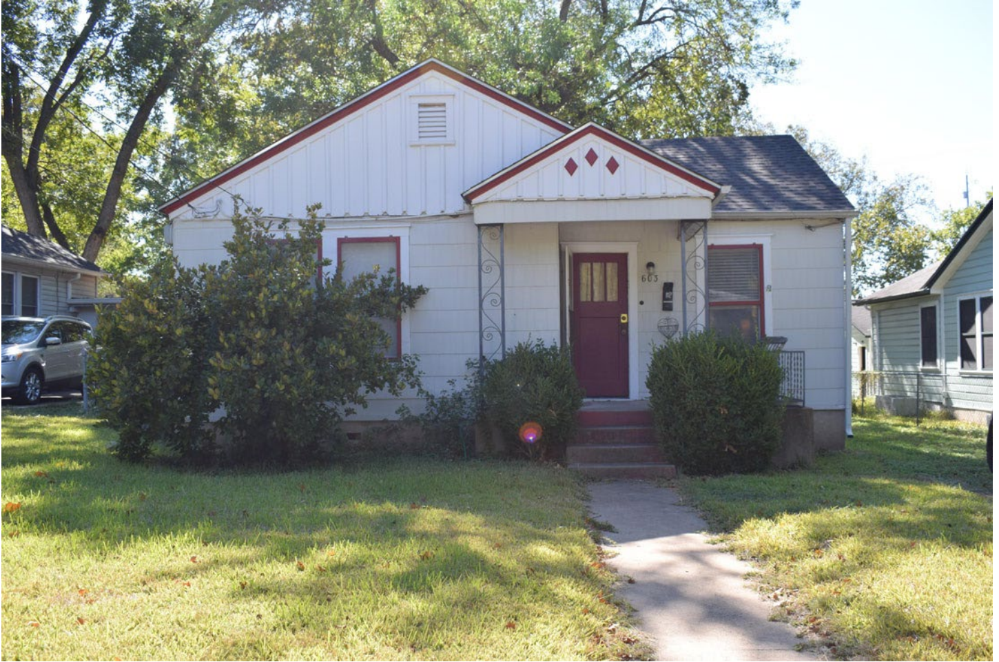
HHM, Inc., Historic Building Survey Report for North Central Austin, 2019