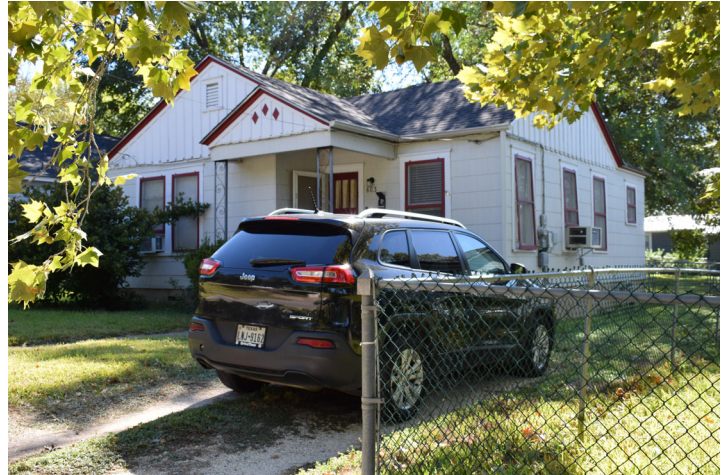
Thu, 31 Oct 2019