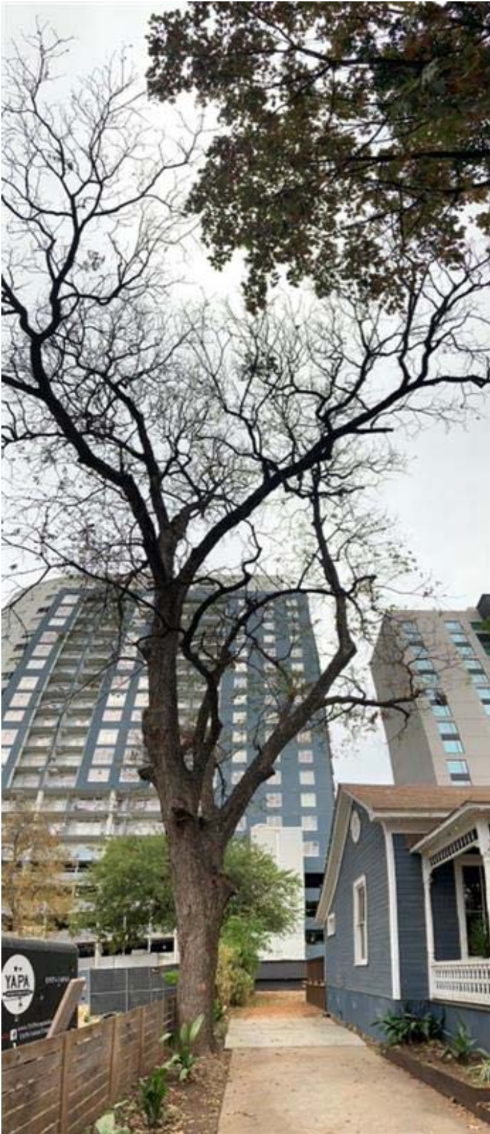
Exhibit 1: Whole tree and co-dominant leaders