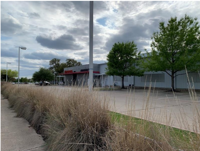
South of 4700 Weidemar Lane: Toyota Service Center, AutoNation 4800 S IH 35 Frontage Rd Suite 1

The photos below show the businesses and homes directly adjacent to 4700 Weidemar Lane.