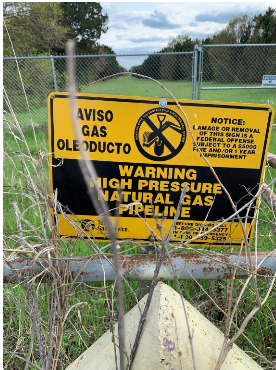
Warning sign for high pressure pipeline on 4700 Weidemar Lane. At this time, there is a 60 foot easement for the two lines that run parallel through this property. The closest homes are about 250 feet from the pipelines.