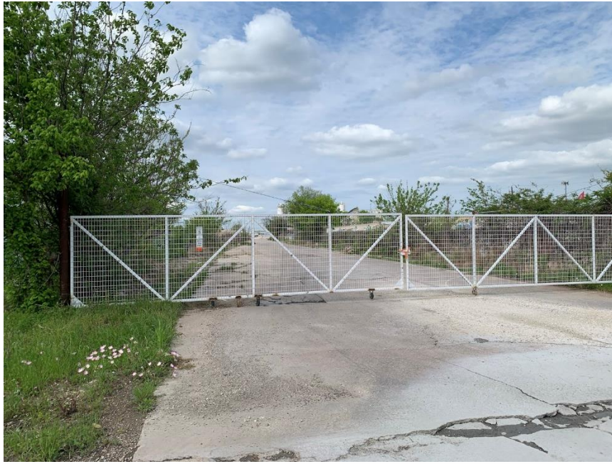
North of 4700 Weidemar Lane: Back entrance to Centex Materials, Inc. This entrance is frequented by cement trucks, delivery trucks, and dump trucks transporting heavy rocks. This entrance is approximately 30 feet from the proposed development.