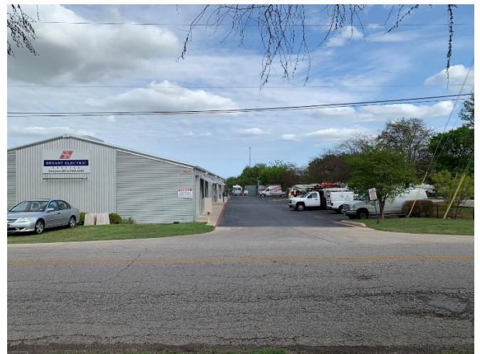
East of 4700 Weidemar Lane: Bryant Electric, 4825 Weidemar Ln STE 600