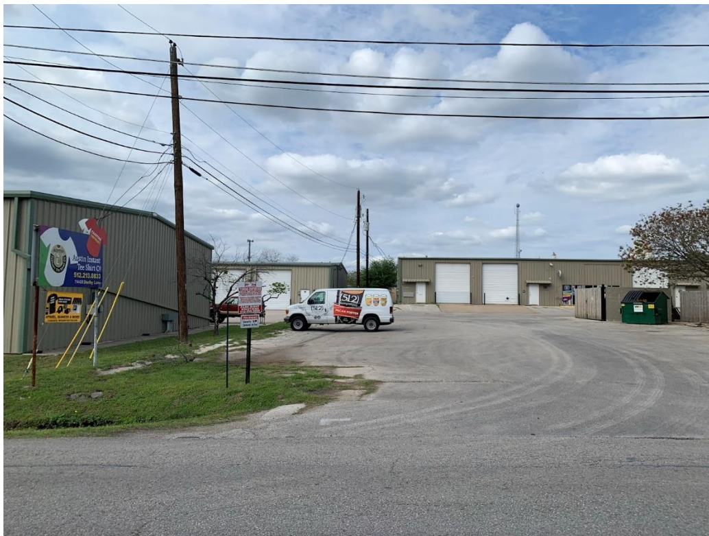
North of 4700 Weidemar Lane: Various warehouses and industrial businesses, 712 Shelby Lane