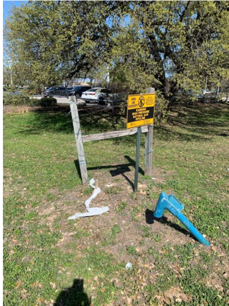
Sign at the corner of Weidemar Lane and the south end of Colonial Park Blvd. This is where the pipeline veers from IH-35 and cuts across the property on Weidemar Lane and onto the depressurization facility located north of Weidemar Lane on St. Elmo Rd.