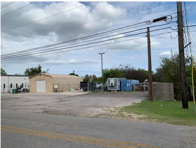
East of 4700 Weidemar Lane: Elk Electric, 4704 Weidemar Lane