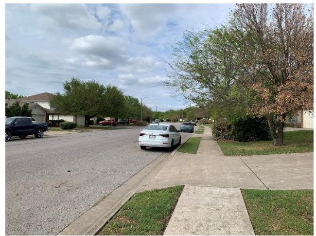
West of 4700 Weidemar Lane: Single family homes along Colonial Park Blvd.

The proposed rezoning amendment to construct the “Multifamily Residence” Shelby Lane complex is in direct conflict to the following goals and priorities found in the Imagine Austin plan.