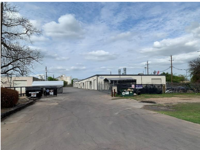
Northeast of 4700 Weidemar Lane: Various Warehouses with commercial and industrial businesses, 900 Shelby Lane and 820 Shelby Lane