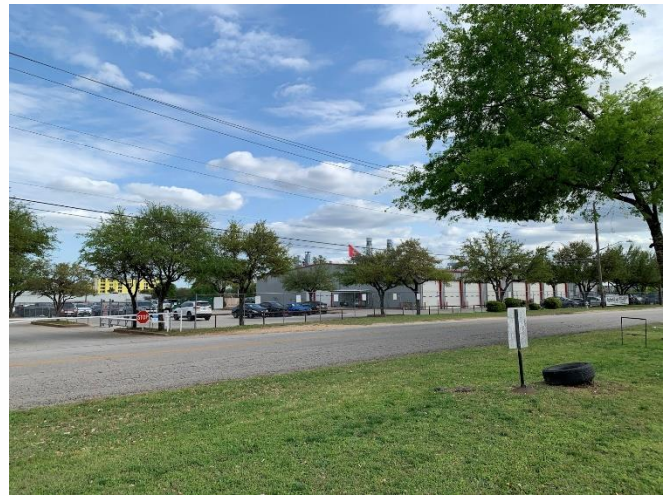
Southeast of 4700 Weidemar Lane: Collision Center, 4901 Weidemar Lane