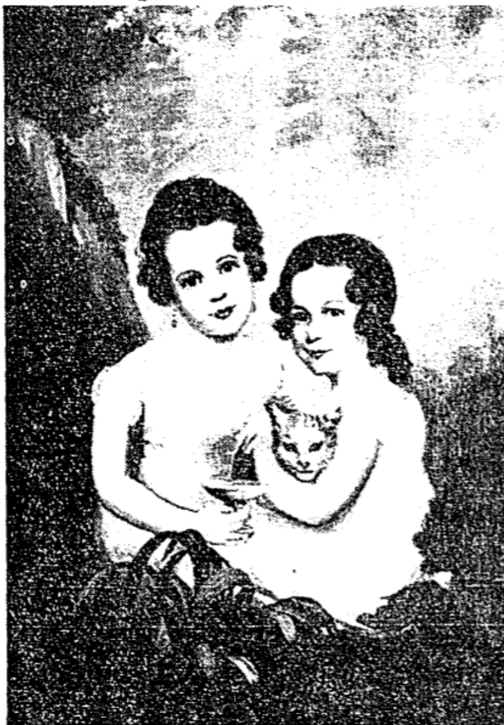
This beautiful painting, the property of Mrs. Buford Brown of Austin, now hangs in the Texas Memorial museum.

The wonderfully preserved painting, apparently as fresh as the day it was finished is one of the numerous exhibits that form special attractions at the museum. Others of unusual popular interest include saddles for men and women of all periods in Texas history; irons for branding cattle and used on famous pioneer ranches of the Southwest;