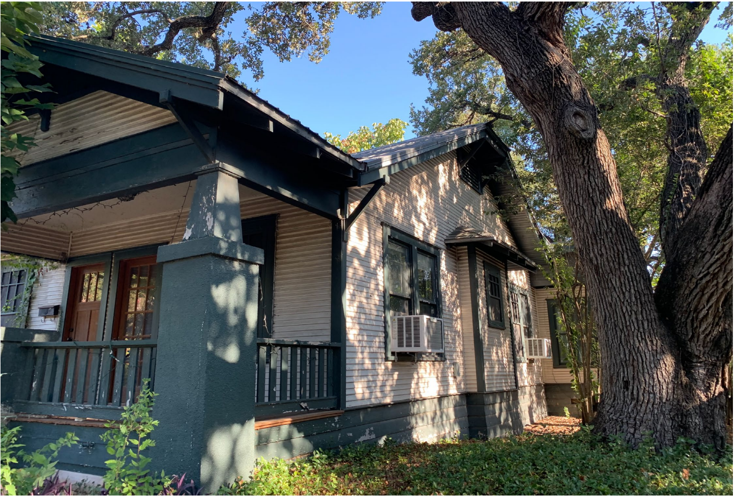
Demolition Permit Application, 2021