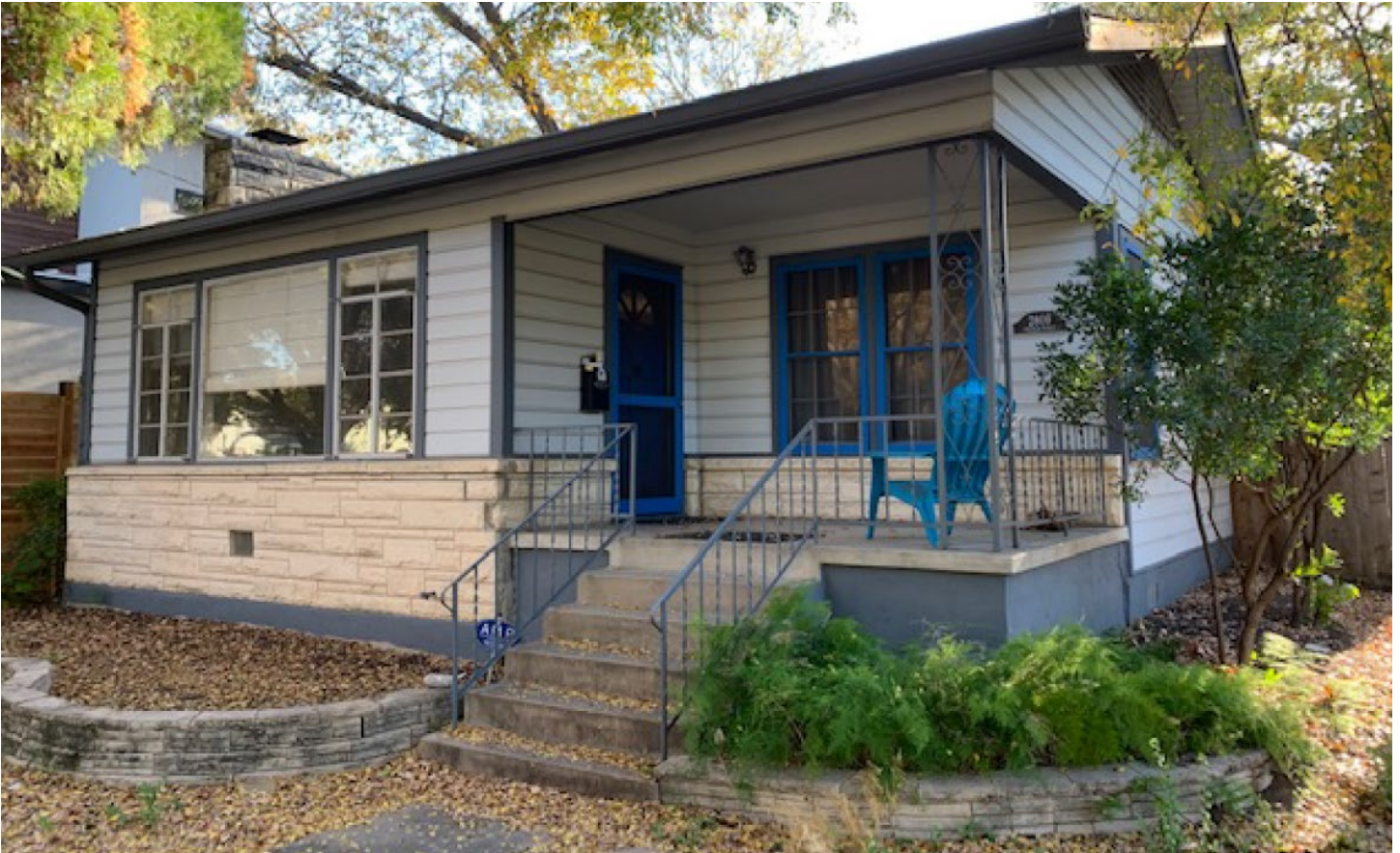
Demolition permit application, 2022