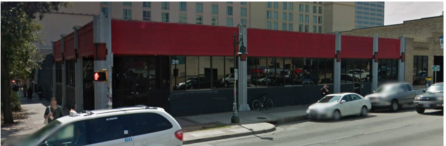
Google Street View, Mar. 2011