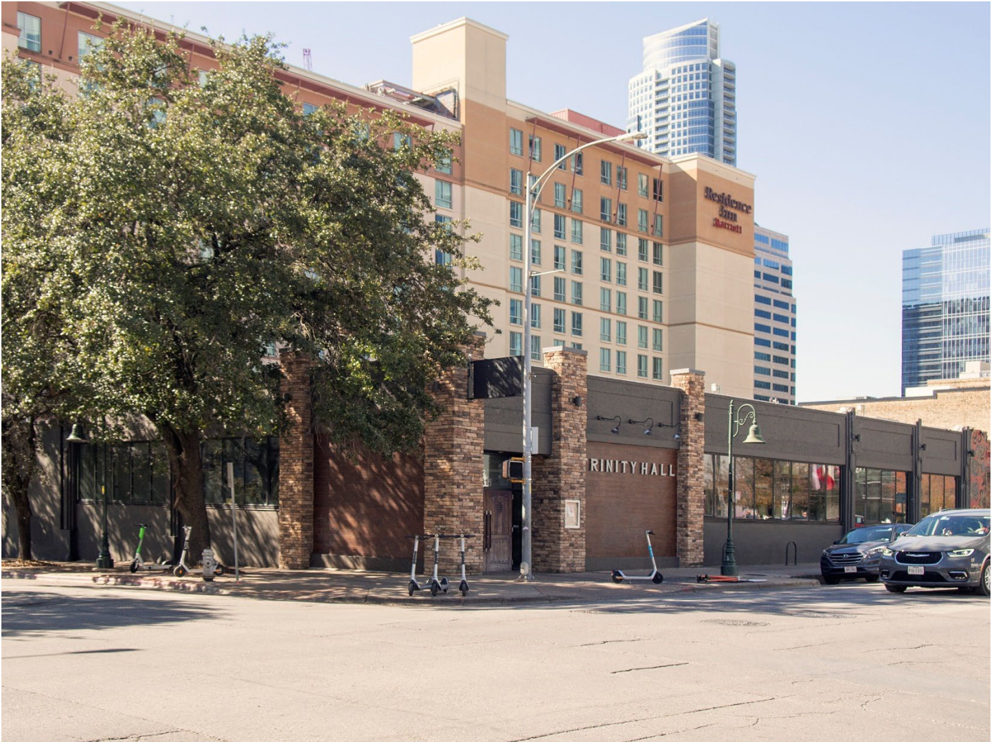
Photograph by Historic Preservation Office staff, 2022