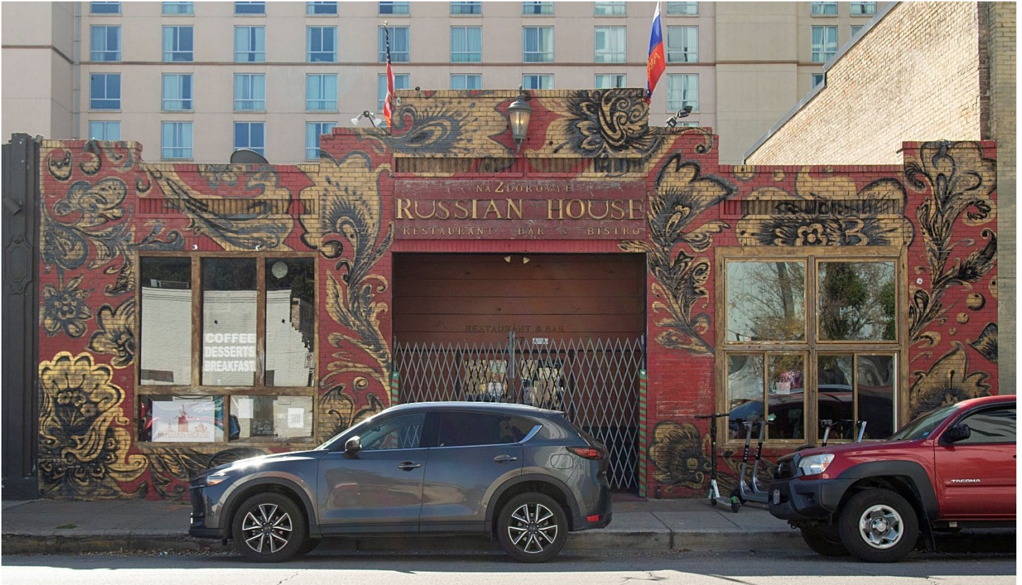
Photograph by Historic Preservation Office Staff, 2022