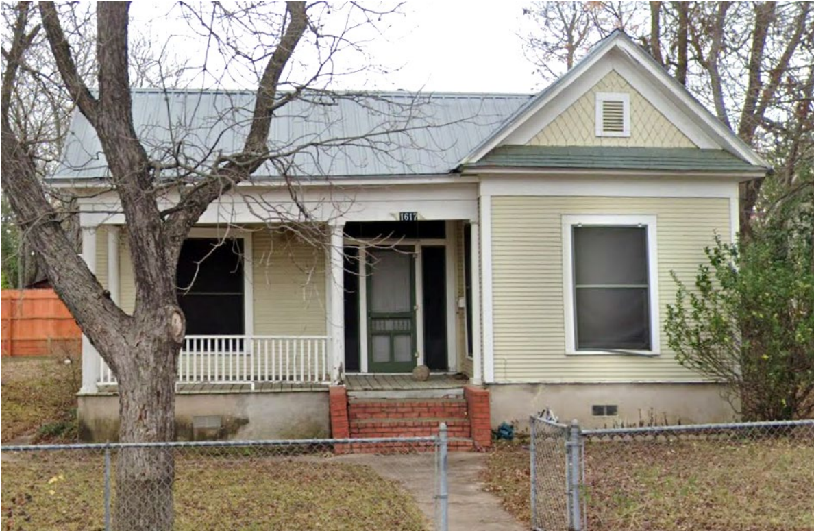
Google Street View, 2020