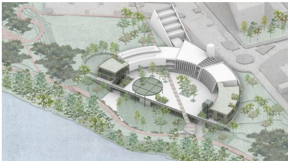
Site rendering, Emma S. Barrientos Mexican American Cultural Center (ESB-MACC) Phase 2 Improvements

Sanchez Elementary Green School Park: The Austin Parks Foundation awarded the Sanchez School Park a grant for a new water fountain and seating for the planned nature play area, scheduled to begin construction in Summer 2022. The nature-based features and other amenities are being implemented as part of the Green School Program and Austin’s Cities Connecting Children to Nature Initiative. District 3 https://austinparks.org/austin-parks-foundation-awards-over-75000-in-2021-fall-community-grants/