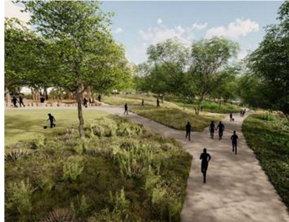
Proposed view from Existing Trailhead