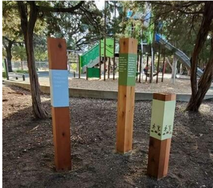
New signs installed at Walnut Creek Metro Park

Walnut Creek Metropolitan Park: Signage was installed at the nature play spaces at Walnut Creek Metro Park to help educate the public about the activities permitted in the area. As a pilot, these signs will be assessed to determine if they are appropriate for all future nature play spaces. District 4