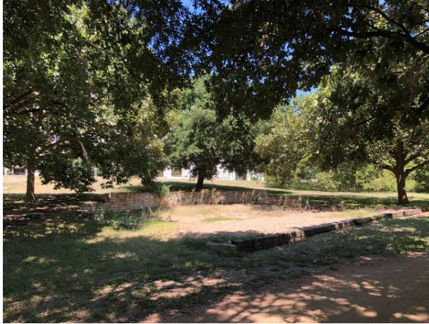
Existing site conditions

The Trail Foundation Rainey Street Trailhead: The Trail Foundation is seeking a Site Development Permit for the Rainey Street Trailhead Project. As part of the permit requirements, The Trail Foundation provided a briefing on the trailhead design to the Waller Creek District Design Guidelines Committee on January 19, the Downtown Commission on January 19, and the Design Commission on January 24. The proposed design for the Rainey Street Trailhead includes improved access to the Butler Hike and Bike Trail, a nature play area, picnic areas, native plantings and an overlook dock on Ladybird Lake. https://thetrailfoundation.org/portfolio/rainey-street-trailhead/ . District 9