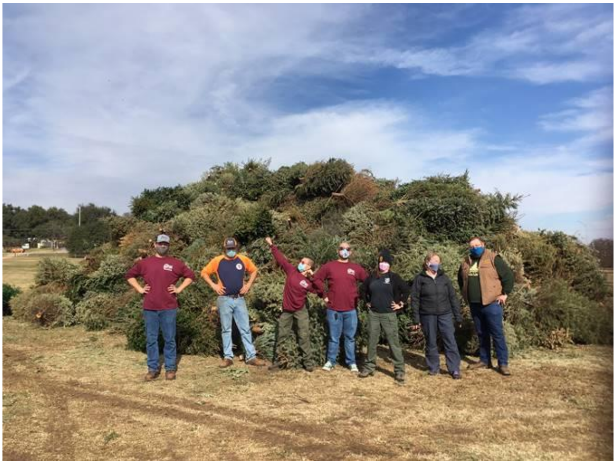
Volunteers and staff collected thousands of trees over three days

Holiday Tree Recycling at Zilker Metropolitan Park: The Parks and Recreation Department (PARD) and Austin Resource Recovery partnered again for the 35 th year of Christmas and holiday tree recycling to give trees another life through mulching. All Austin residents were invited to drop trees and wreaths free of tinsel and decorations on January 2, January 9, and January 10. Contactless drop off was encouraged and all staff and City volunteers wore masks to ensure safety during COVID Stage 5. An estimated 2,000 trees were collected, and mulch was offered free to the public on January 13 in the same location. Twenty trees were also given directly to Central Texas Pig Rescue. They attest their pigs love Christmas trees for both food and entertainment.