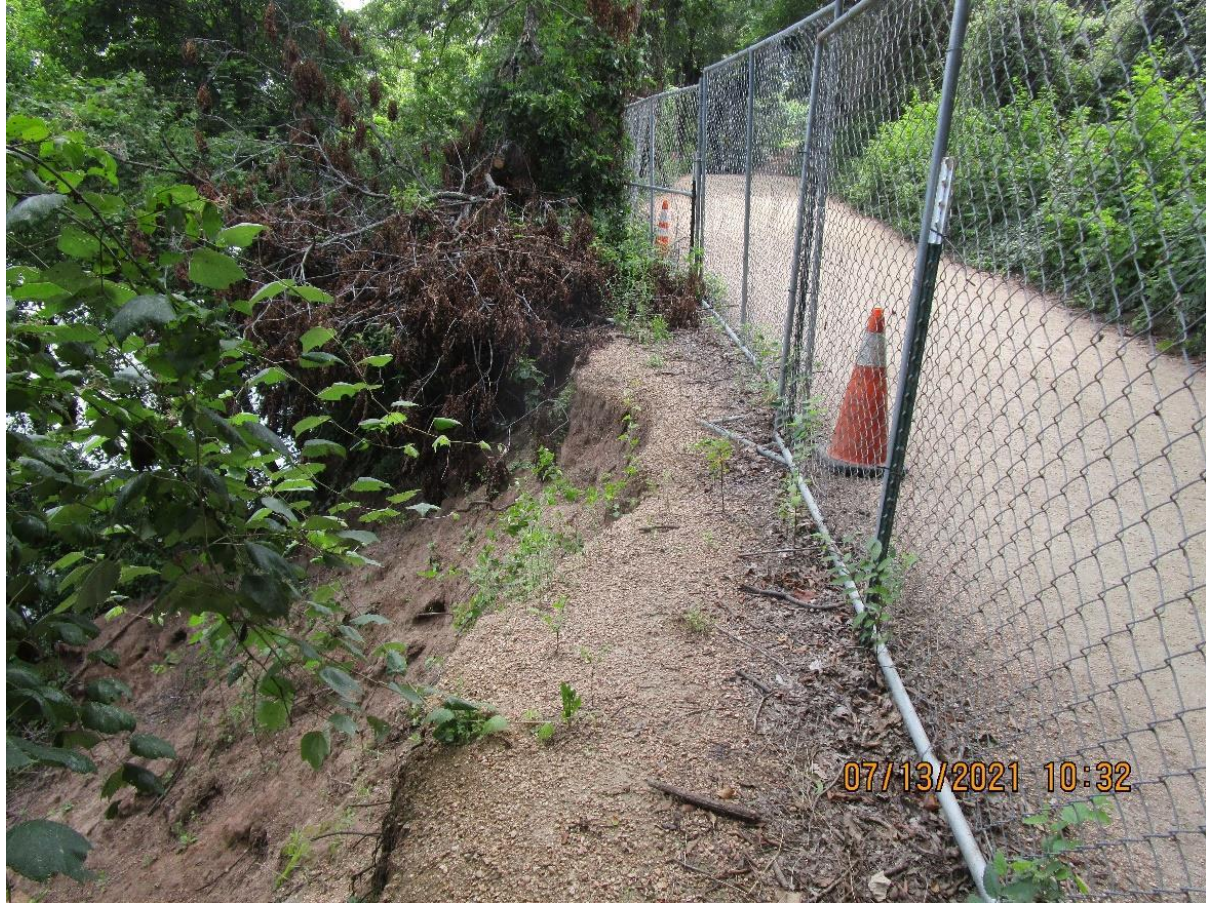
Photo taken at site of slop failure

Krieg Athletic Complex: The Krieg Athletic Complex is receiving upgraded ball field lighting on fields 9-11. The three fields have had their existing lighting for at least 30 years. There are many advantages to replacing the old lights with Musco LED ball field lighting. The lights will provide better light levels for the games that are played under the lights. The energy efficient lights will also save money due to lower electric bills. As a result, there will be less light pollution and a 25-year warranty. These are additional benefits that we shall notice over the years. District 3