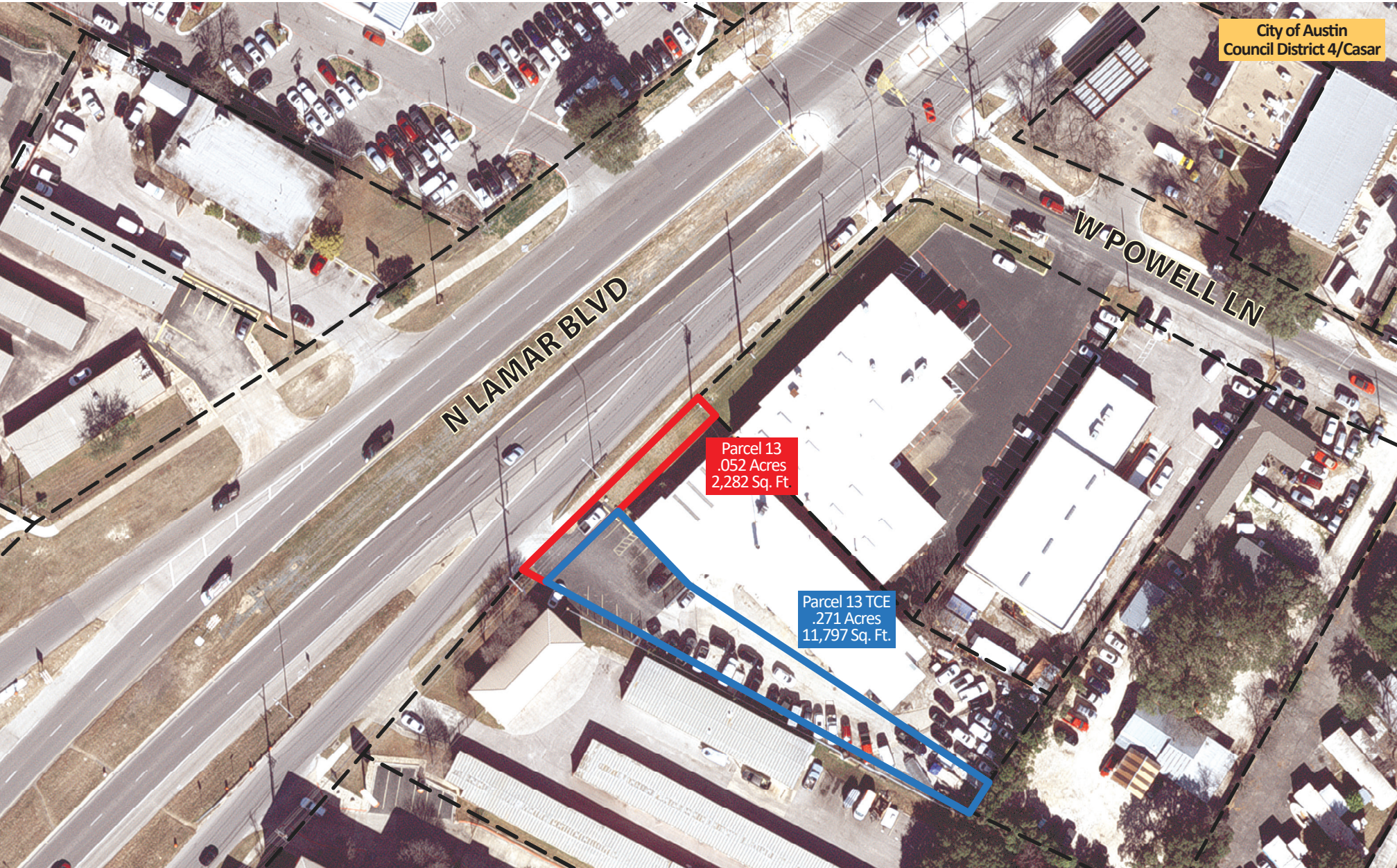
2021 Aerial Imagery, City of Austin