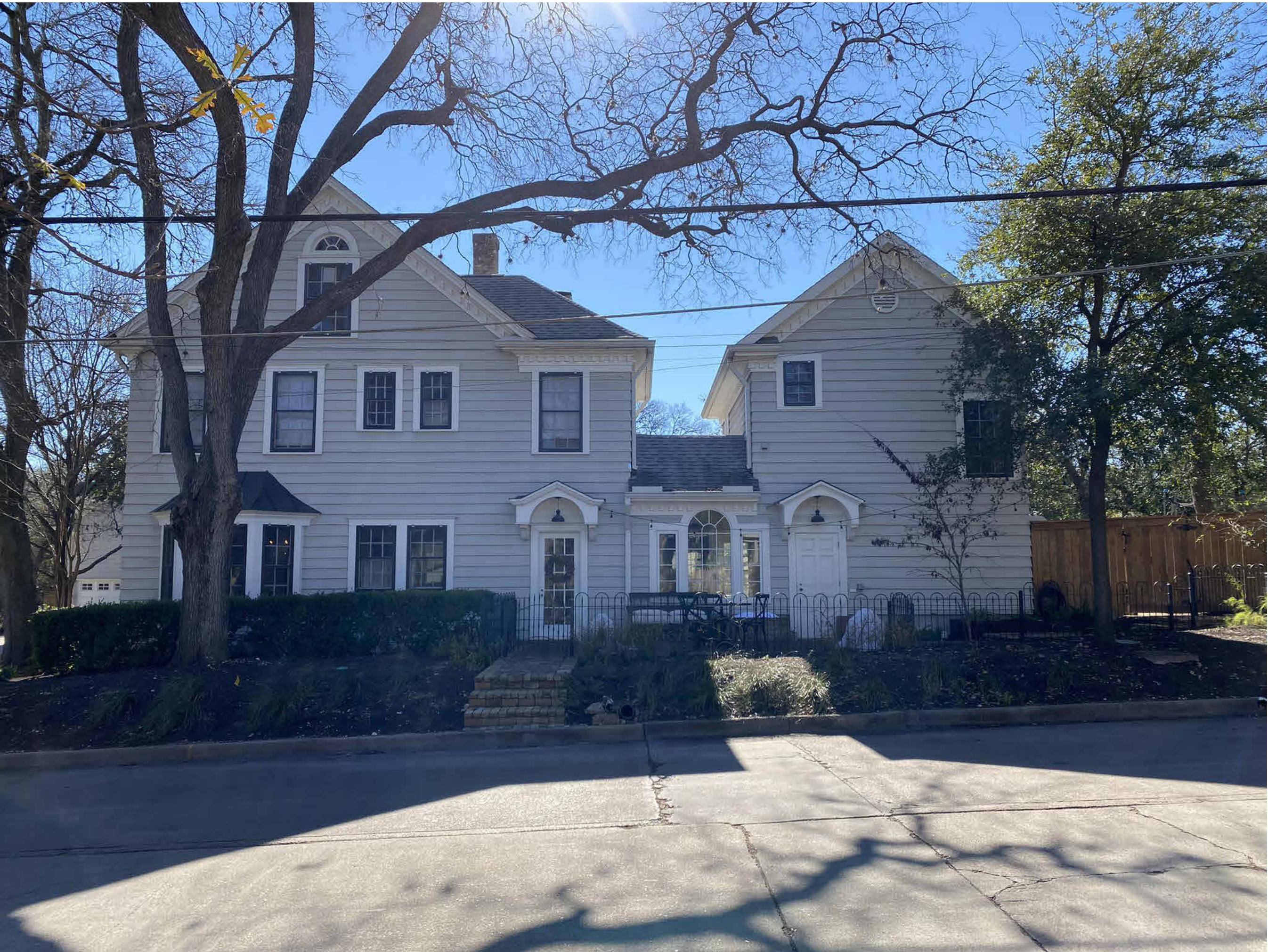
Existing 34th Street frontage (above) Proposed 34th Street frontage (below)