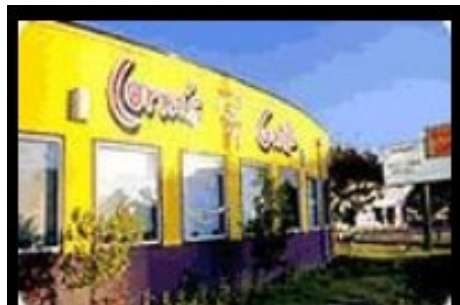
Most Recent Frisco Location: 6801 Burnet Road

The announcement came Tuesday following approval of plans by the city building inspector's office for a $22,000 frame restaurant building at 5819 Burnet Road. Harry Aiken, operator of the chain, said the new restaurant will specialize in Frisco hamburgers.