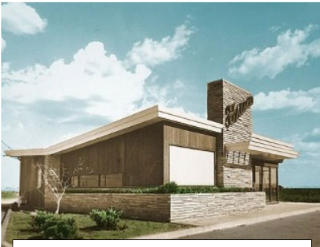
Original Frisco Location: 5819 Burnet Road

The Austin Statesman (1921-1973); Feb 11, 1953; ProQuest Historical Newspapers: The Austin American Statesman pg. 19