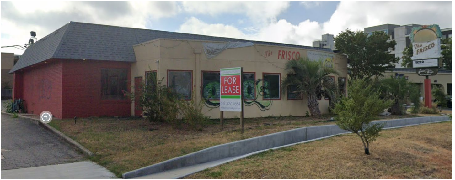
Google Street View, 2019