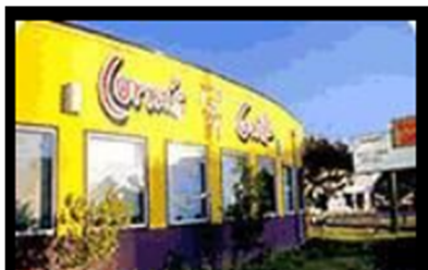
Most Recent Frisco Location: 6801 Burnet Road (Seen here as the old Curra's Grill)

Other 30 -- No Title The Austin American Statesman (1973-1980); Mar 3, 1979; ProQuest Historical Newspapers: The Austin American Statesman pg. 20