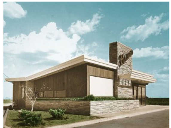
Original Frisco Location: 5819 Burnet Road