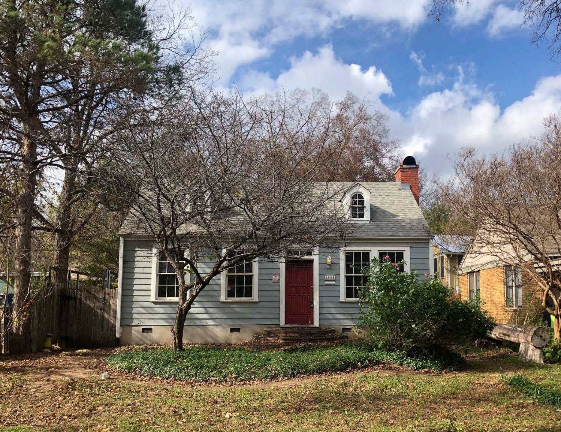
3006 Hemphill Park ca. 1935 Aldridge Place Historic District