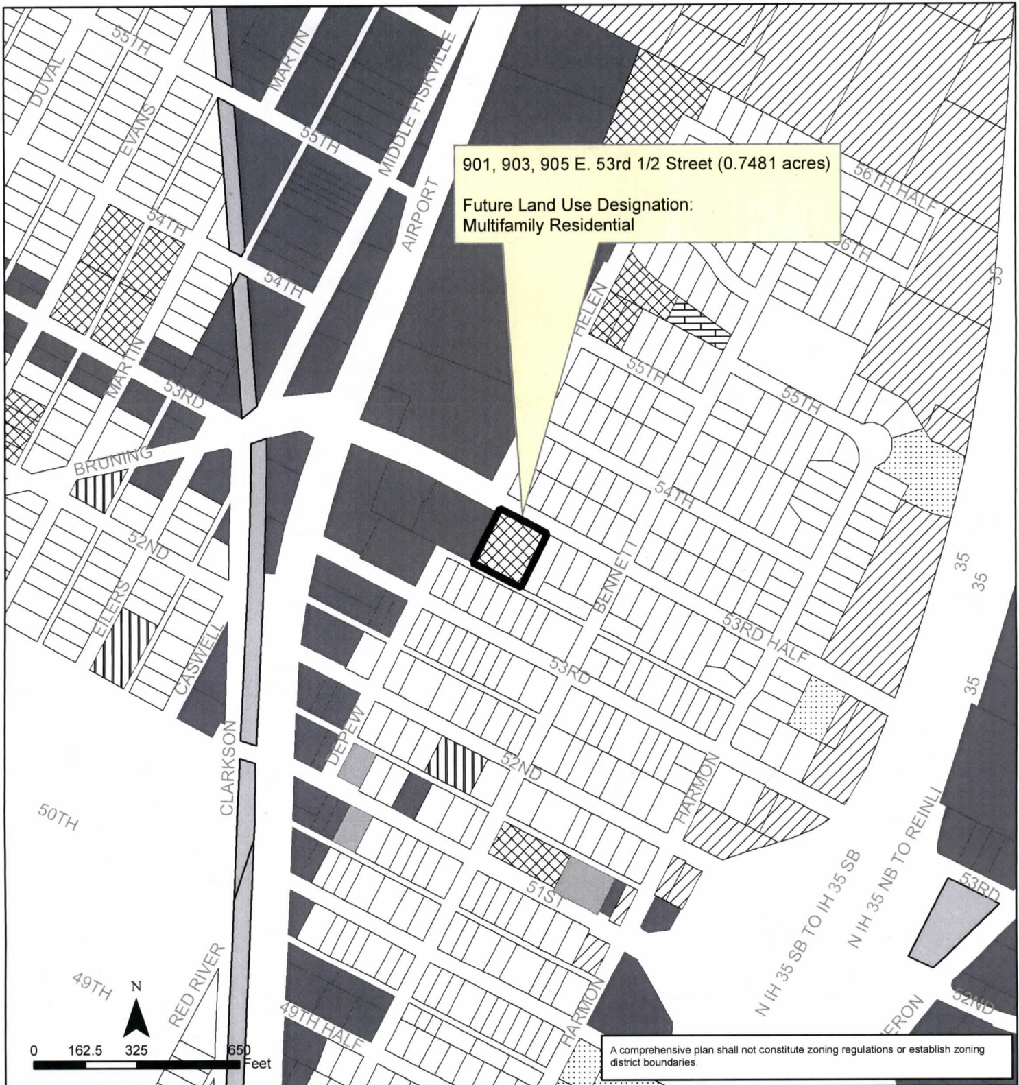
Exhibit A North Loop Neighborhood Planning Area NPA-2021-0011.01

This product is for informational purposes and may not have been prepared for or be suitable for legal, engineering, or surveying purposes. It does not represent an on-the-ground survey and represents only the approximate relative location of property boundaries.