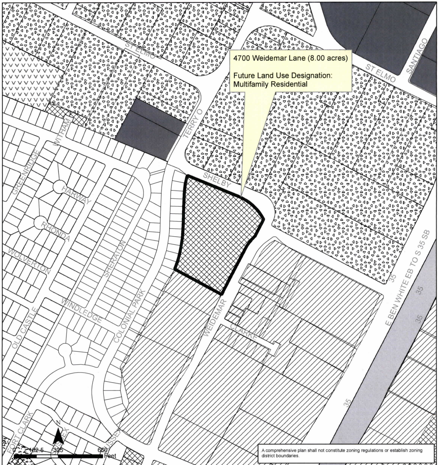
Exhibit A South Congress Combined (East Congress) Neighborhood Planning Area NPA-2021-0020.01

This product is for informational purposes and may not have been prepared for or be suitable for legal, engineering, or surveying purposes. It does not represent an on-the-ground survey and represents only the approximate relative location of property boundaries.