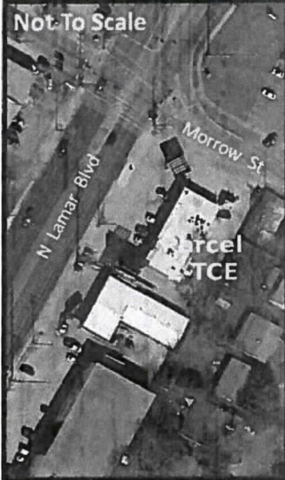
EXHIBIT "B" SKETCH TO ACCOMPANY FIELD NOTES